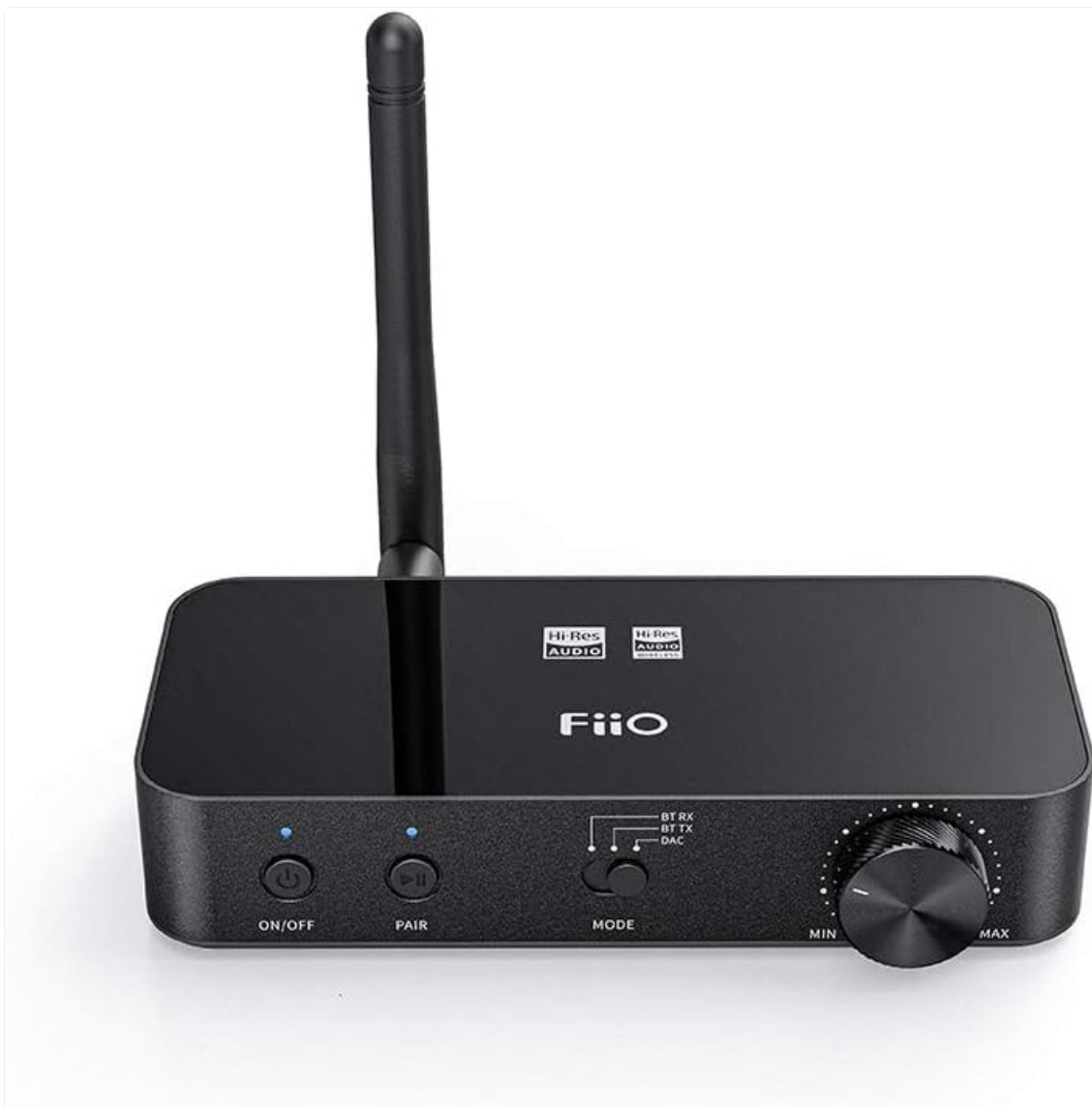
Figure 3.1: Front view of FiiO BTA30.