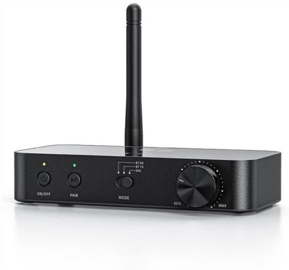
Figure 5.2: Bluetooth Receiver (RX) Mode Setup.