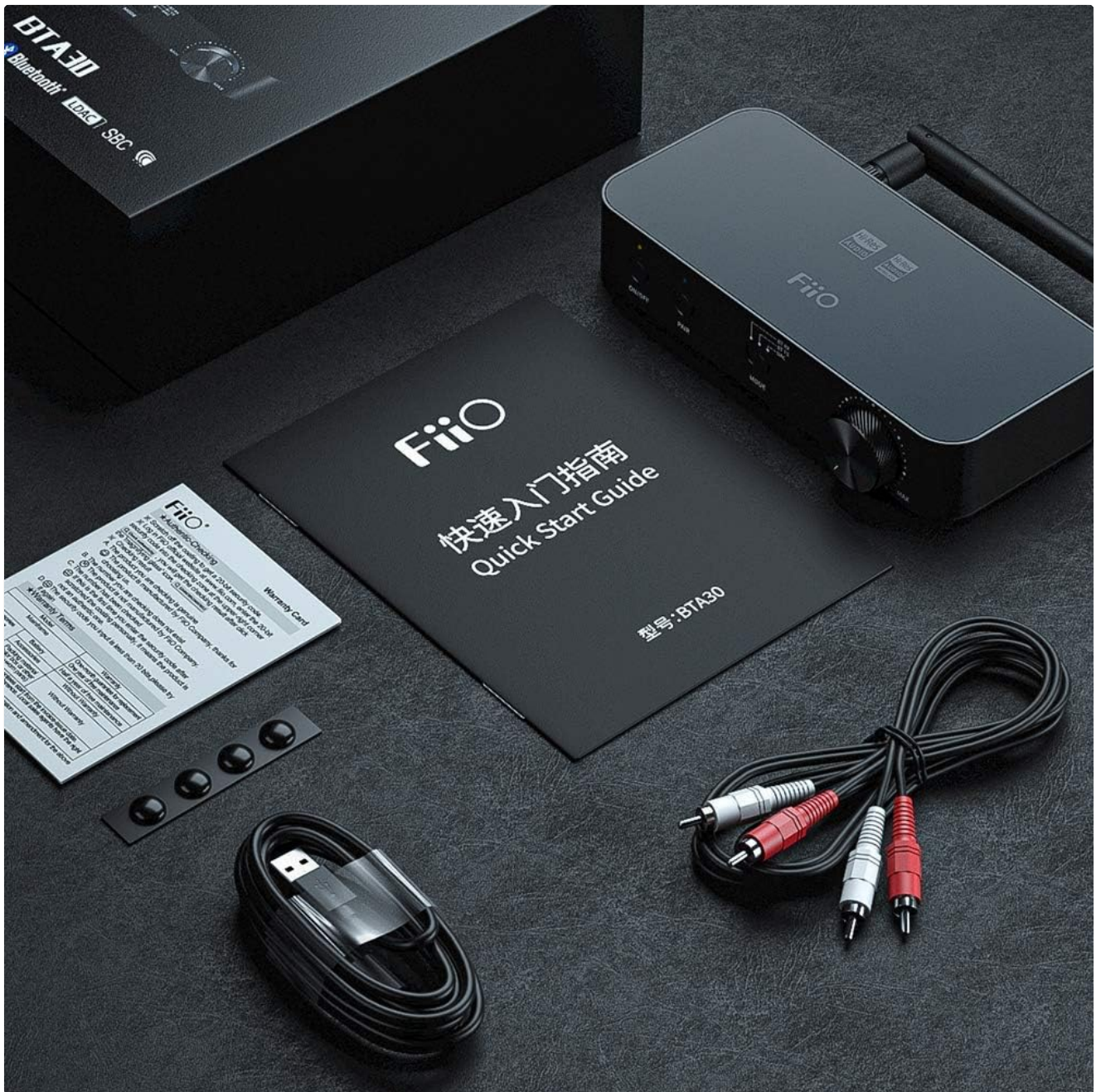
Figure 2.1: FiiO BTA30 and included accessories.