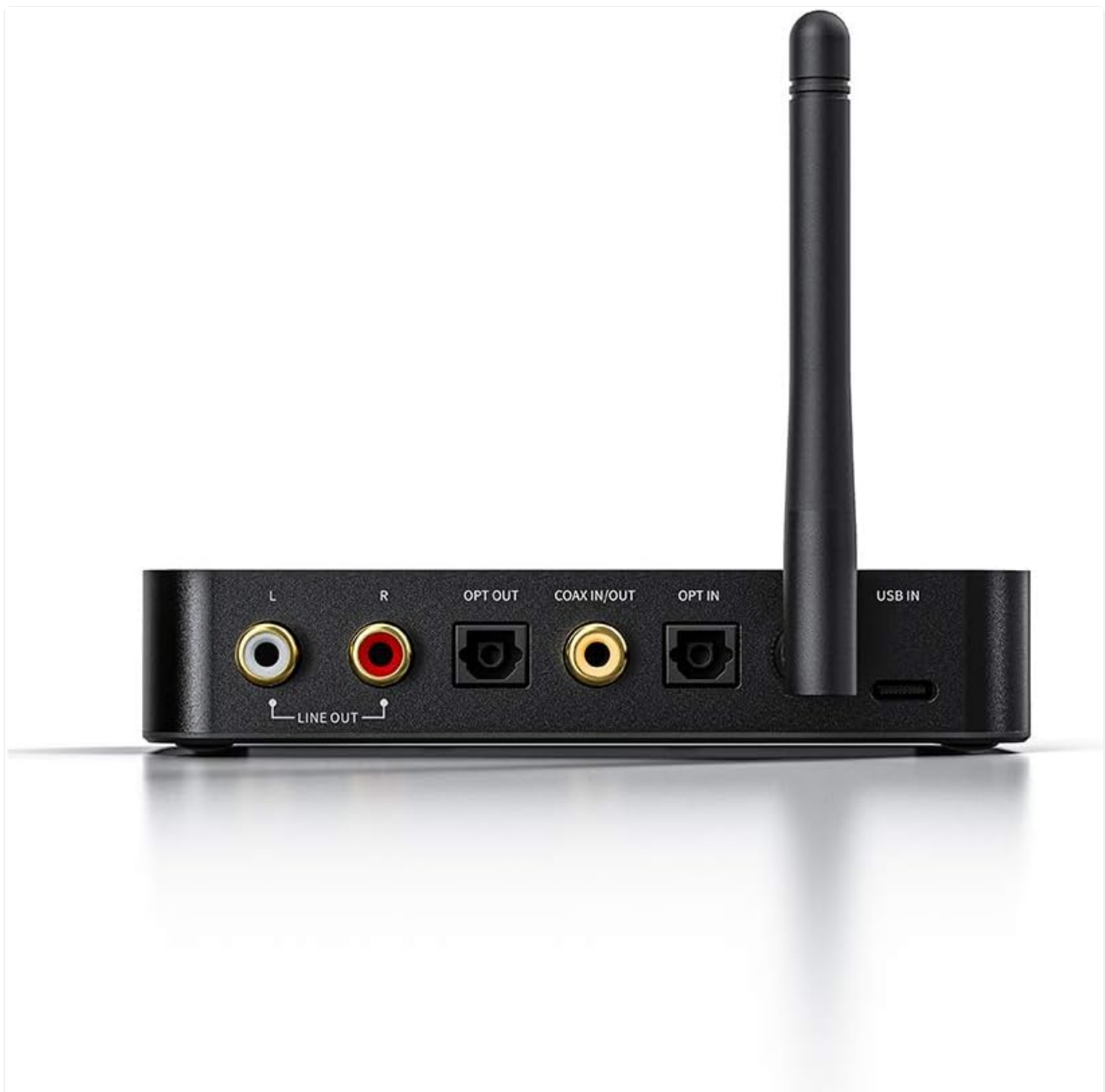
Figure 3.2: Rear view of FiiO BTA30 with input/output ports.