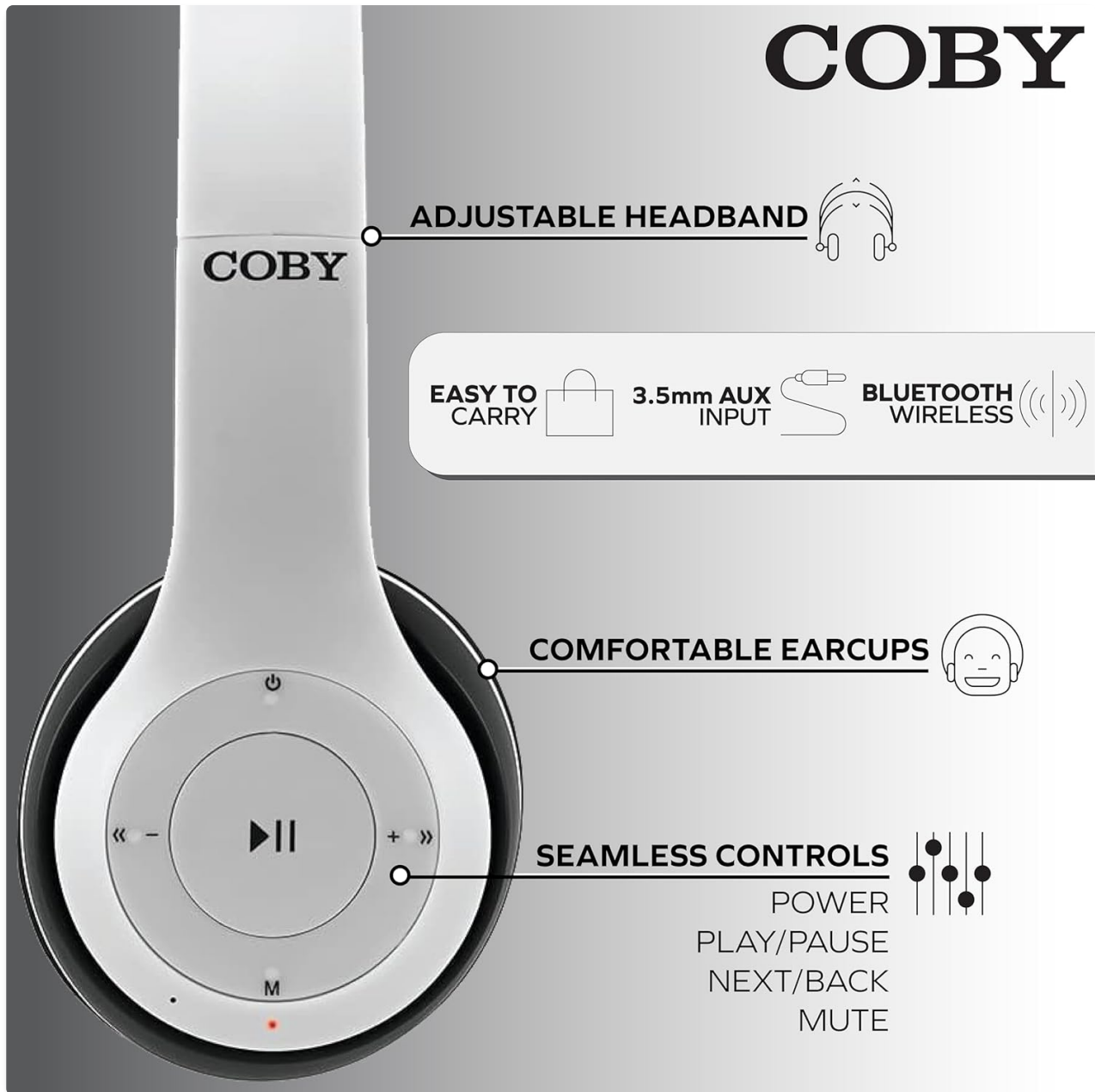
Image: A detailed diagram highlighting key features of the headphones, including the adjustable headband, 3.5mm AUX input, Bluetooth wireless capability, comfortable earcups, and the layout of the seamless control buttons.