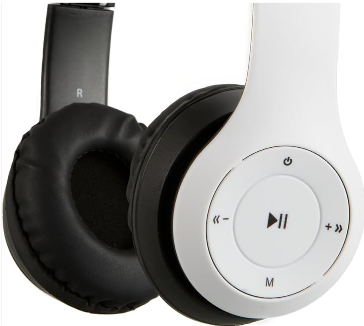
Image: Front view of the Coby Wireless & Wired Headphones in white, showcasing the over-ear design and control buttons on the earcup.