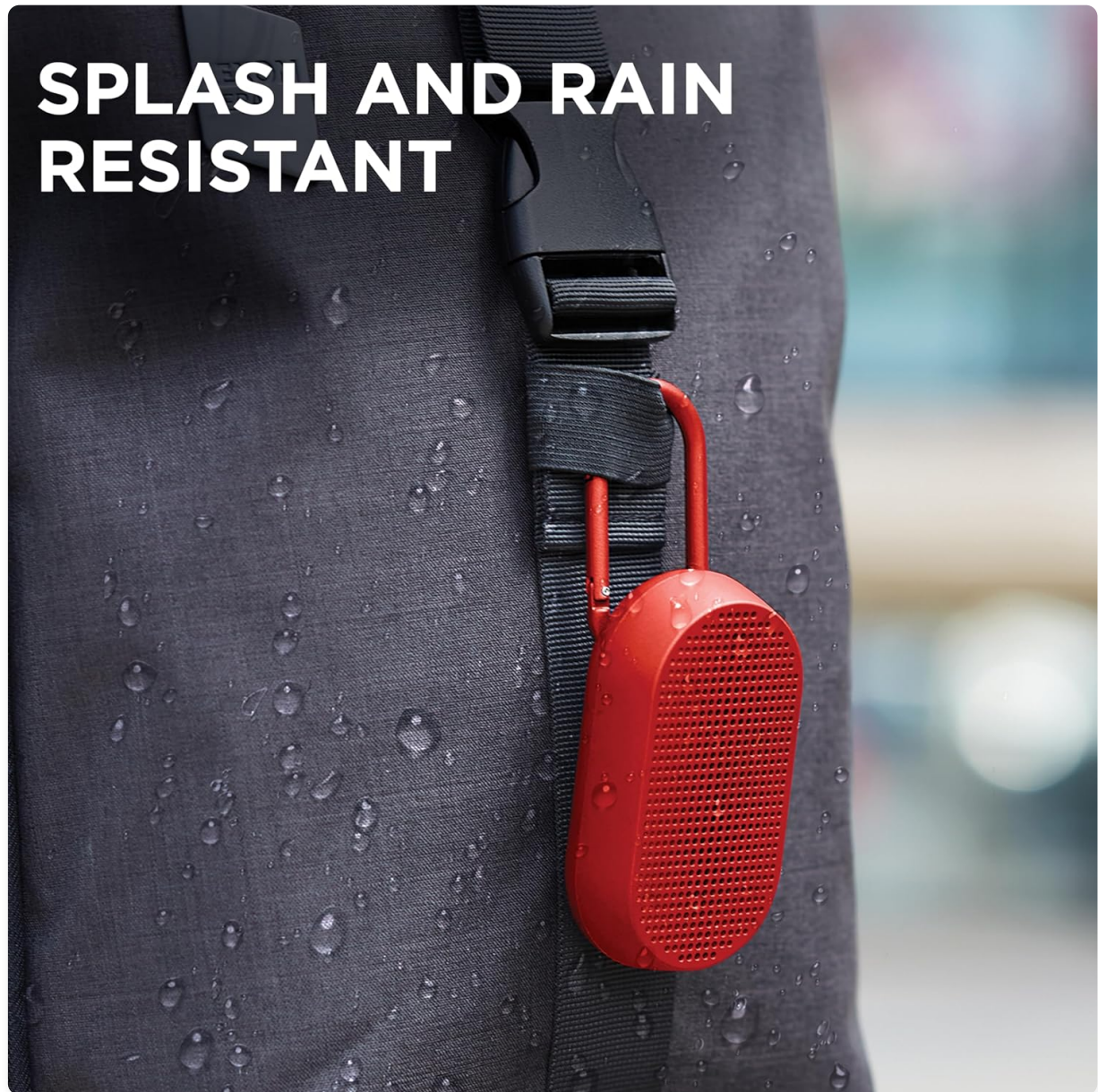
Image: A red MINO T speaker with water droplets, illustrating its splash-resistant design.

splashing water from any direction. It is suitable for outdoor use and can withstand light rain or splashes, but it should not be submerged in water.