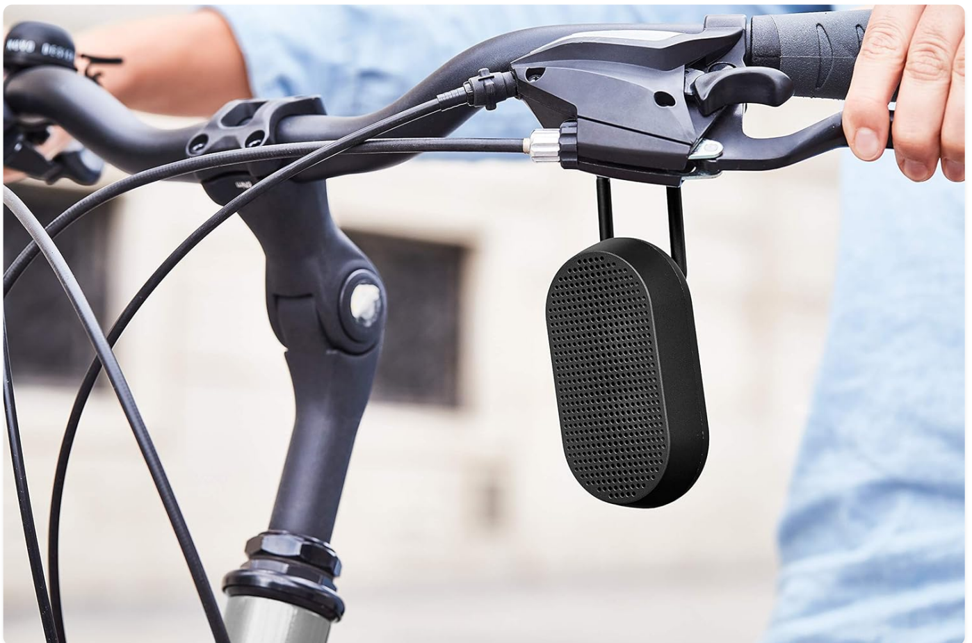
Easily clip the speaker to your bicycle for music on the go.