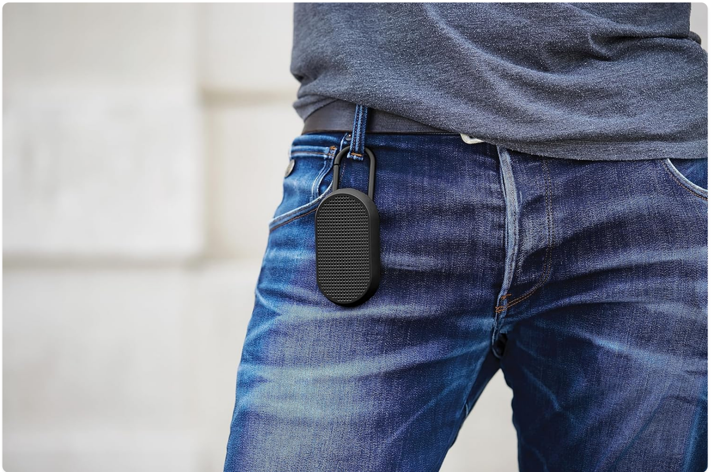
The carabiner clip allows for convenient attachment to your belt loop.