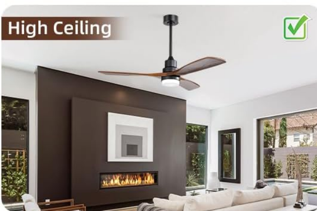
Figure 4: Visual representation of fan dimensions and suitability for different room sizes and ceiling types (low, medium, high, sloped).