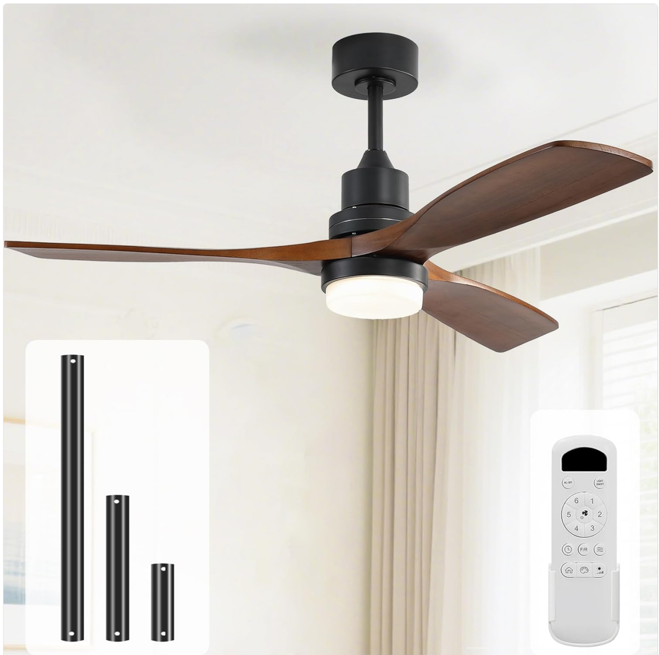
Figure 1: Sofucor 52-inch Low Profile Ceiling Fan with included remote control and various downrod lengths.