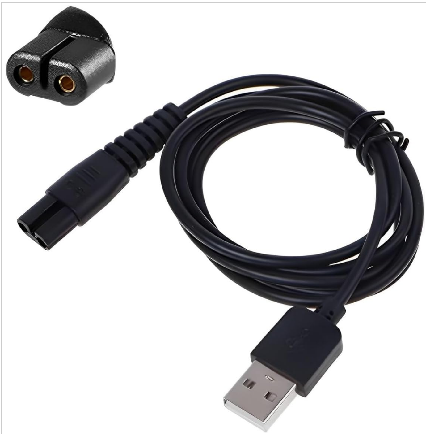
Image: KEMEI USB Charger Cable. This image displays the black USB charging cable, featuring a standard USB-A connector on one end and a specialized double round mouth connector on the other, designed for KEMEI electric razors and hair clippers.