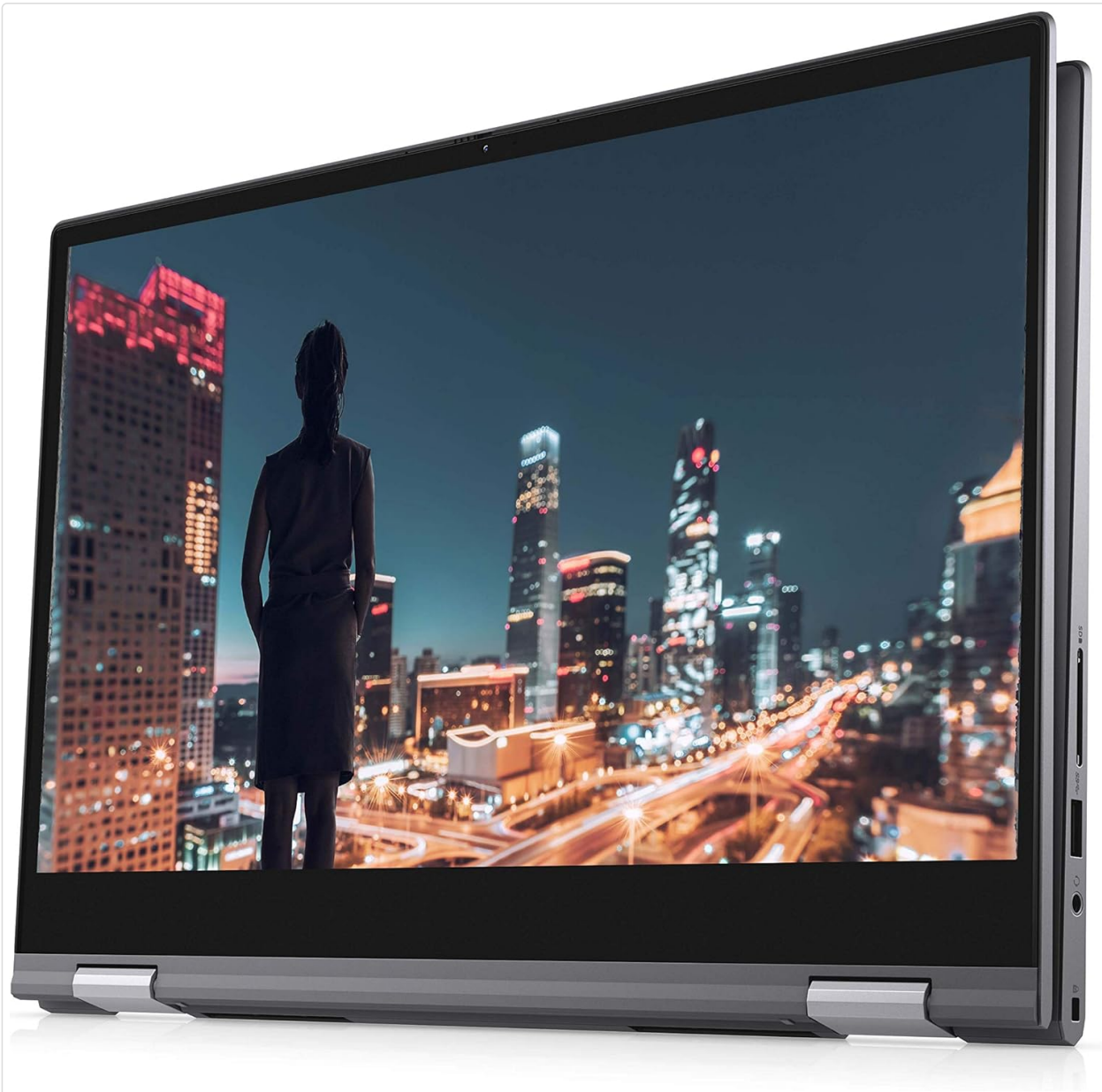
Figure 2.4: Right side view of the laptop, showing the SD card reader, USB-A port, and security lock slot.