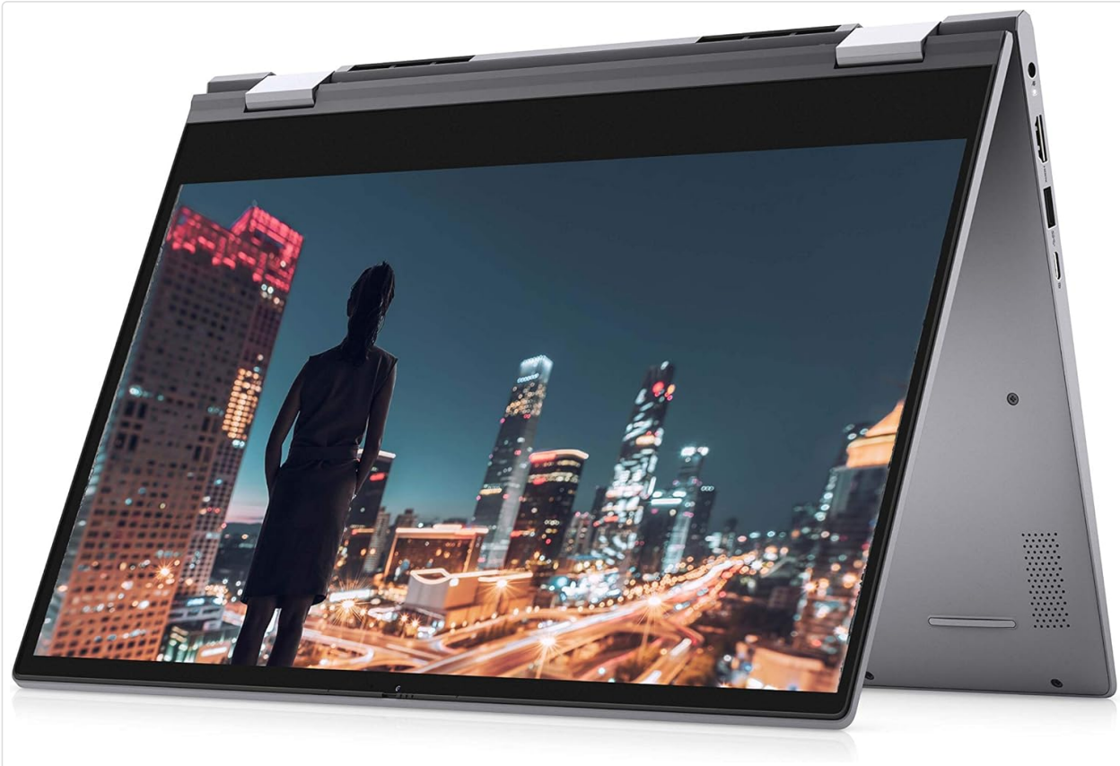
Figure 4.1: The laptop configured in tent mode, suitable for viewing content.