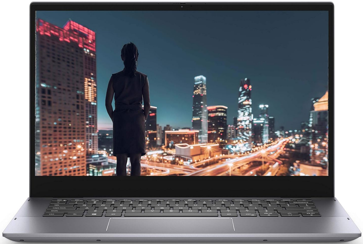
Figure 2.1: Front view of the Dell Inspiron 14 5406 in traditional laptop mode, showcasing the display and keyboard.