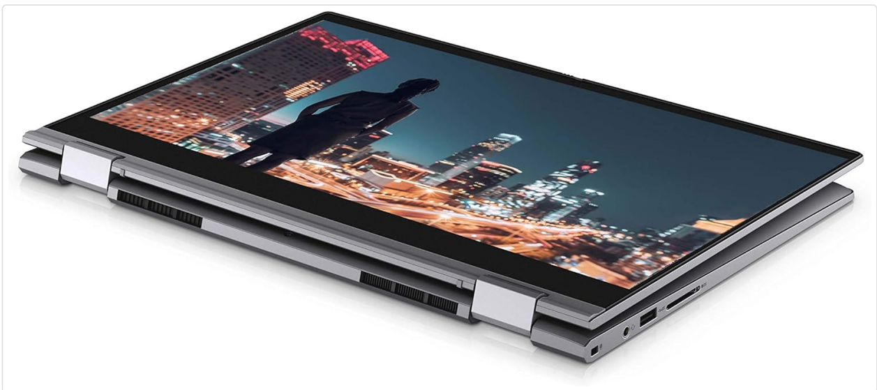
Figure 4.3: The laptop fully folded into tablet mode for touch-only interaction.