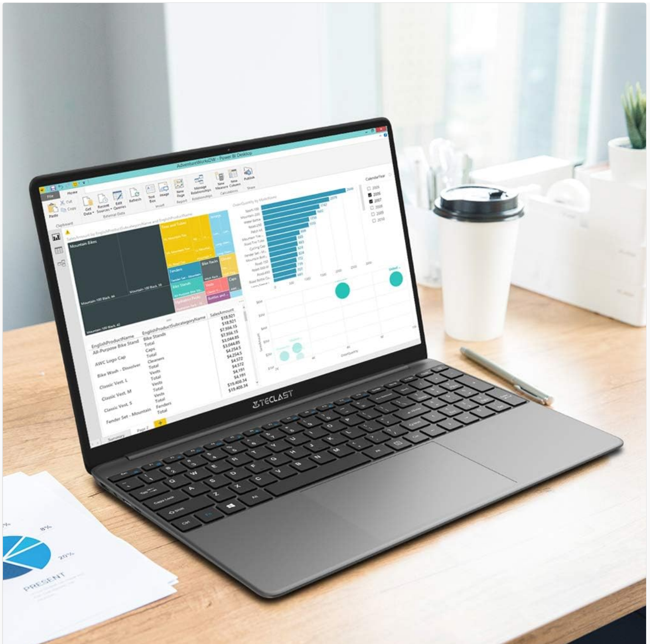
Figure 4.1: The TECLAST F15S in a typical usage scenario.