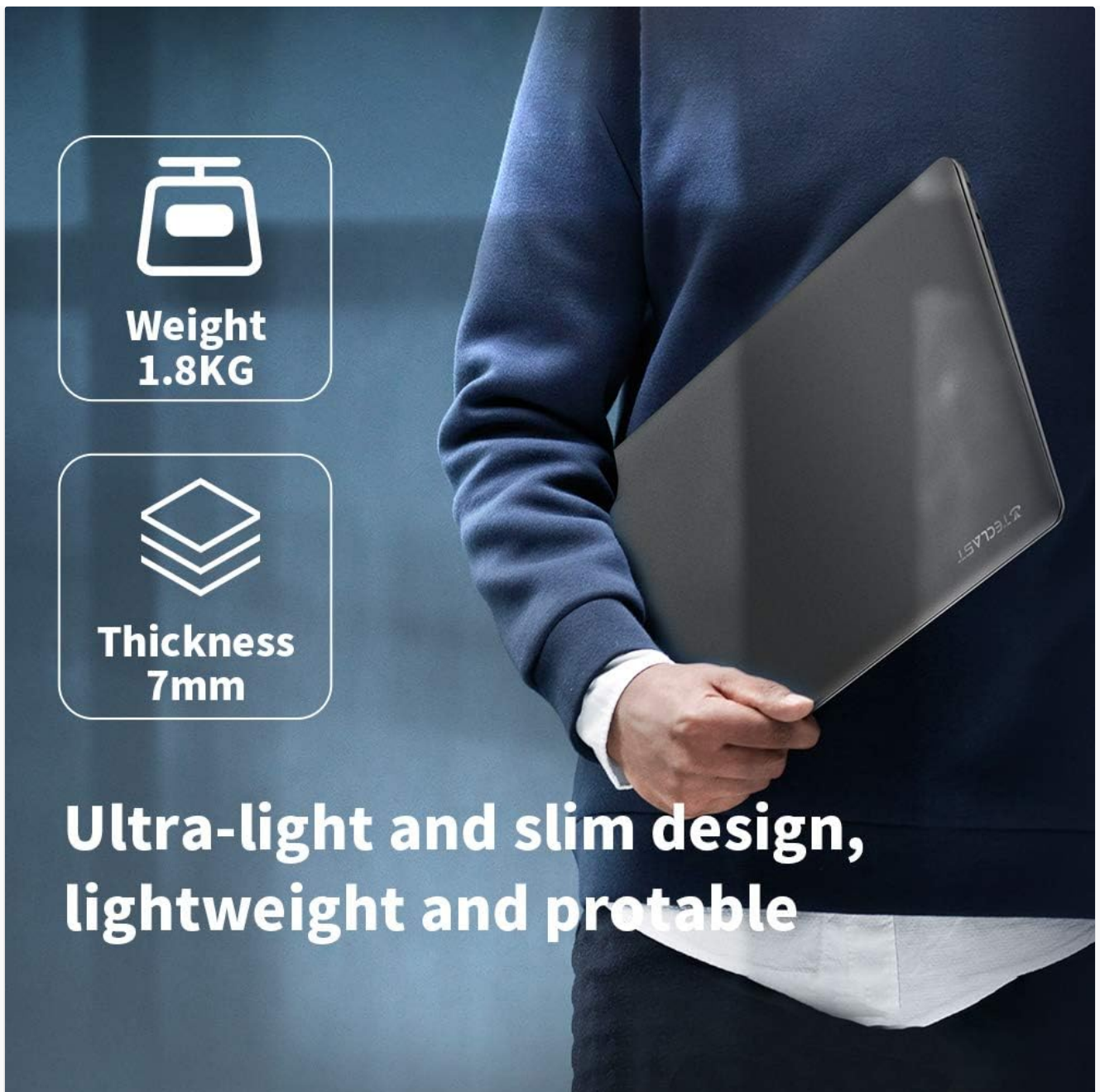
Figure 2.2: The TECLAST F15S demonstrating its lightweight (1.8 kg) and slim (7mm) profile.