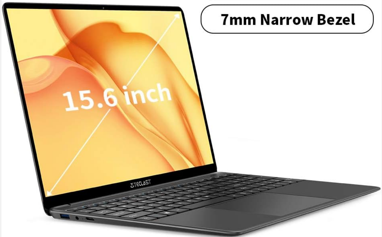
Figure 2.1: TECLAST F15S laptop highlighting the 15.6-inch Full HD display with narrow bezels.