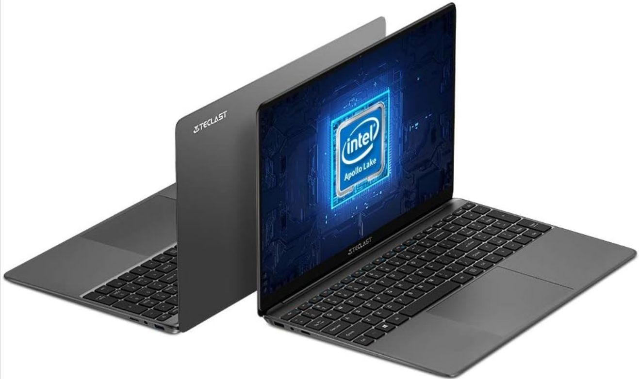
Figure 2.4: Visual representation of the Intel N3350 processor and integrated HD Graphics.