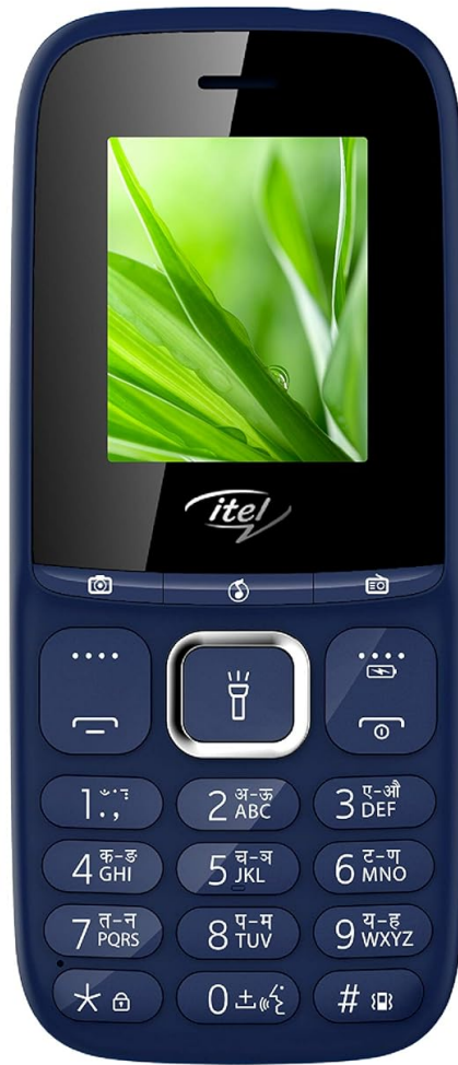
Image: Front view of the ITEL it2173 mobile phone, showing the display, keypad, and navigation buttons.