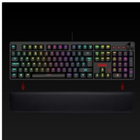
Image: A detailed view of the RedThunder K55's dedicated media control keys and the high-quality metal scroll wheel for volume adjustment.