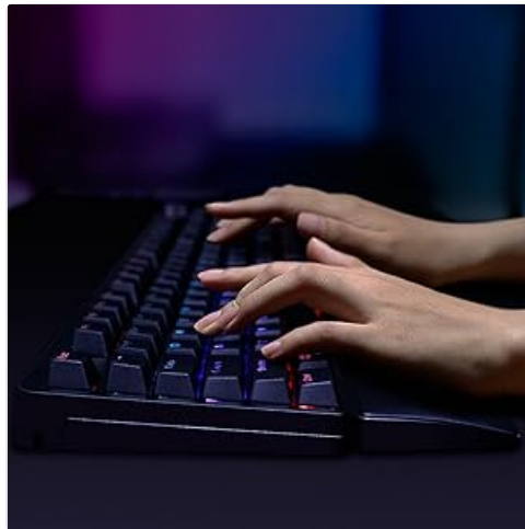
Image: A user's hands positioned on the RedThunder K55 keyboard with the wrist-rest, illustrating the ergonomic design for comfortable use.