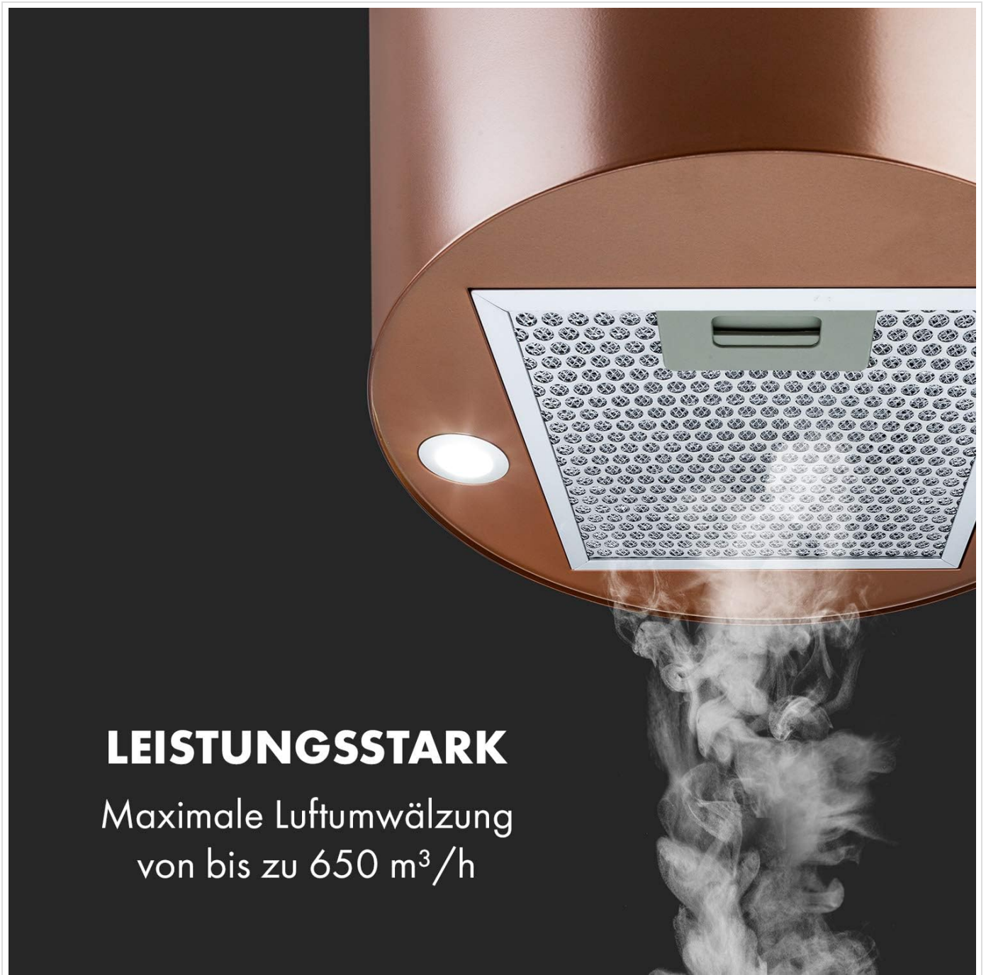
Figure 5: The hood effectively extracting steam during cooking.