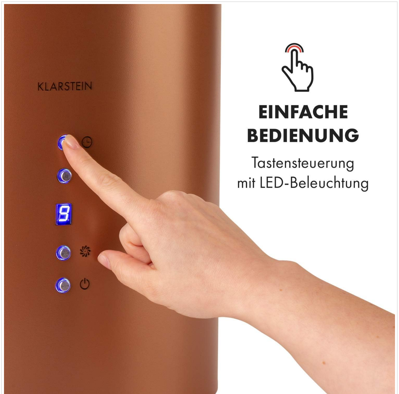
Figure 2: Control panel with LED illumination. The buttons control power, fan speed, and lighting.