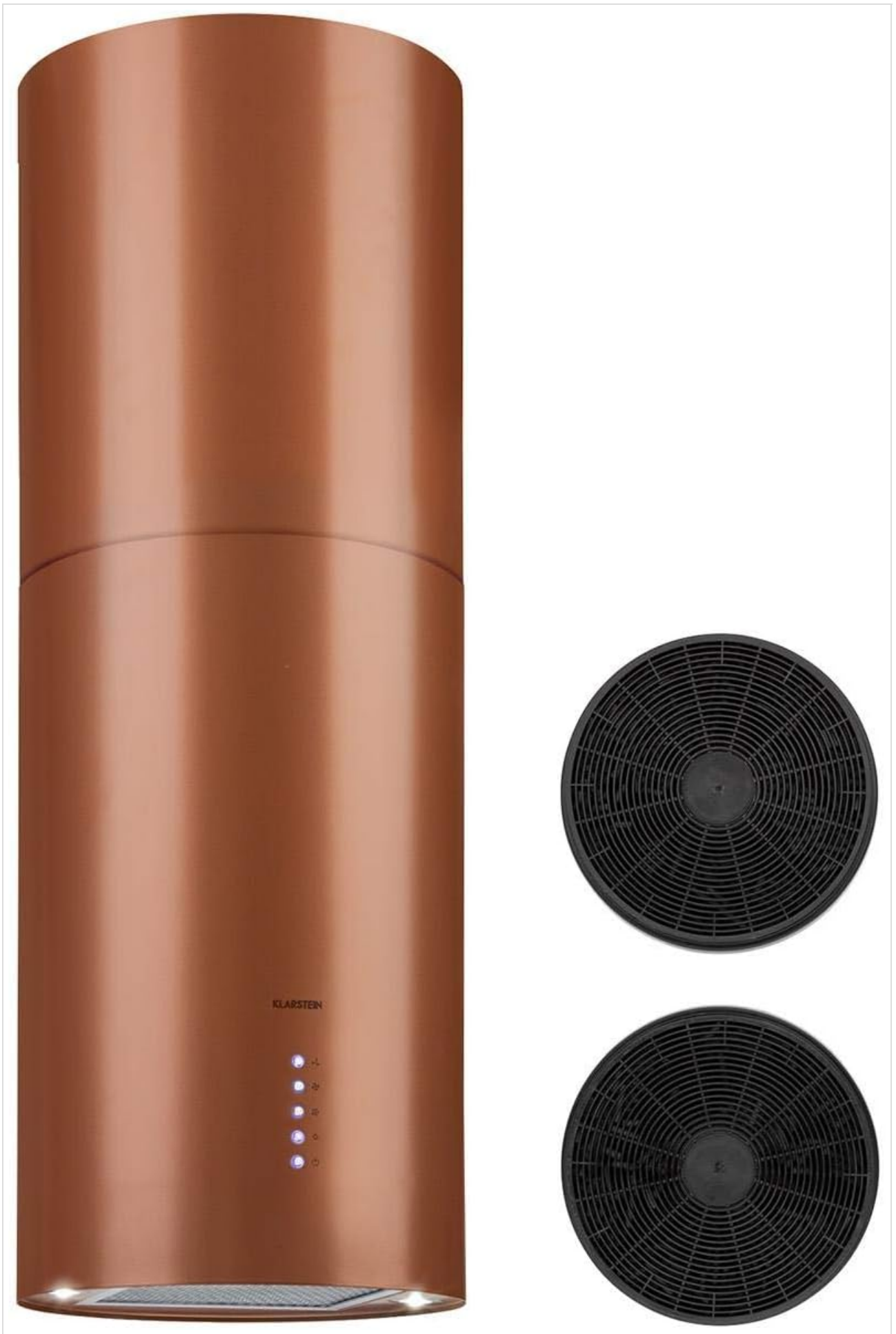
Figure 1: Klarstein Beretta Island Exhaust Hood (copper) and activated carbon filters.