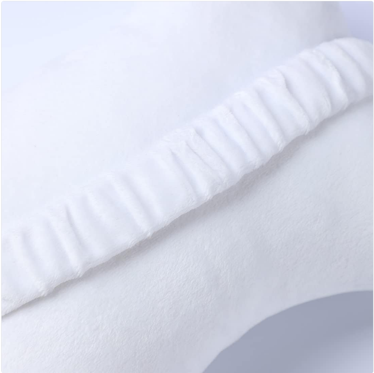
Image 2.2: Close-up of the elastic strap on the back of the neck pillow. This image shows the detail of the adjustable elastic band used for securing the pillow.