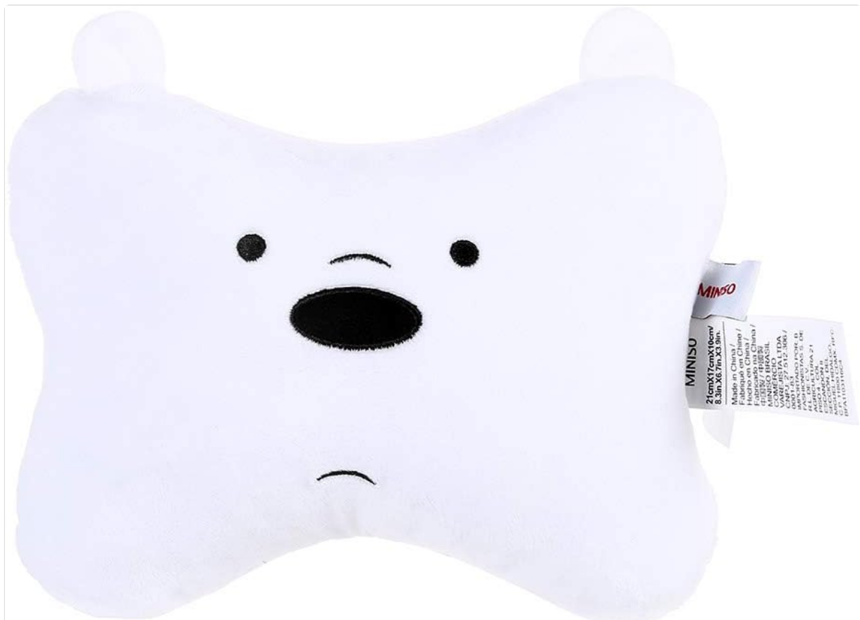
Image 1.1: Front view of the MINISO We Bare Bears Ice Bear neck pillow. This image displays the pillow's overall shape and the Ice Bear character design.

The MINISO We Bare Bears Car Neck Pillow (Ice Bear) is designed to provide comfortable neck support, primarily for use in car seats. It helps fill the gap between the back of the neck and the seat, preventing discomfort during travel or extended sitting. Its soft polyester filling offers excellent rebound resilience, while the smooth, wear-resistant polyester cover ensures durability and comfort.