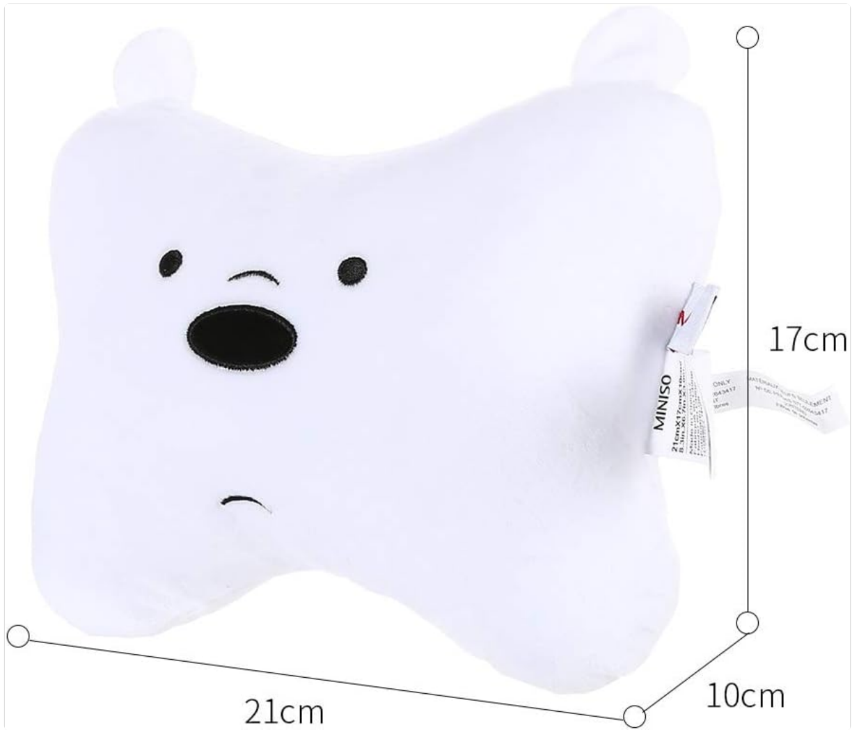
Image 7.1: MINISO We Bare Bears Ice Bear neck pillow with dimensions labeled. This image provides a visual representation of the pillow's length, width, and height.