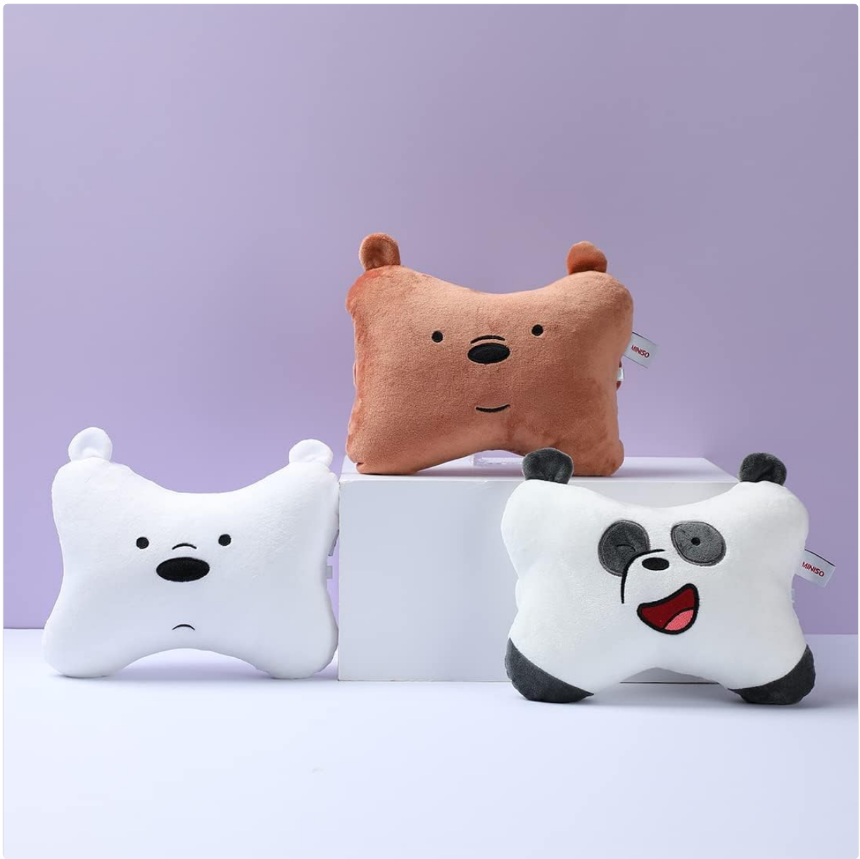
Image 4.1: Three We Bare Bears neck pillows (Ice Bear, Grizz, Panda) displayed together. This image shows the variety of available designs and the general appearance of the pillows in a setting.