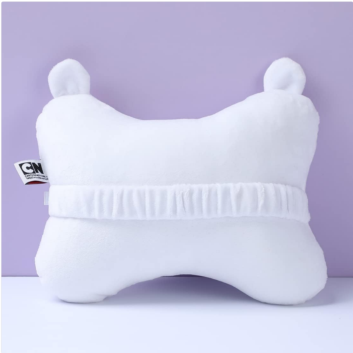
Image 3.1: Back view of the Ice Bear neck pillow showing the elastic strap. This image illustrates how the elastic strap is positioned on the pillow for attachment to a seat.