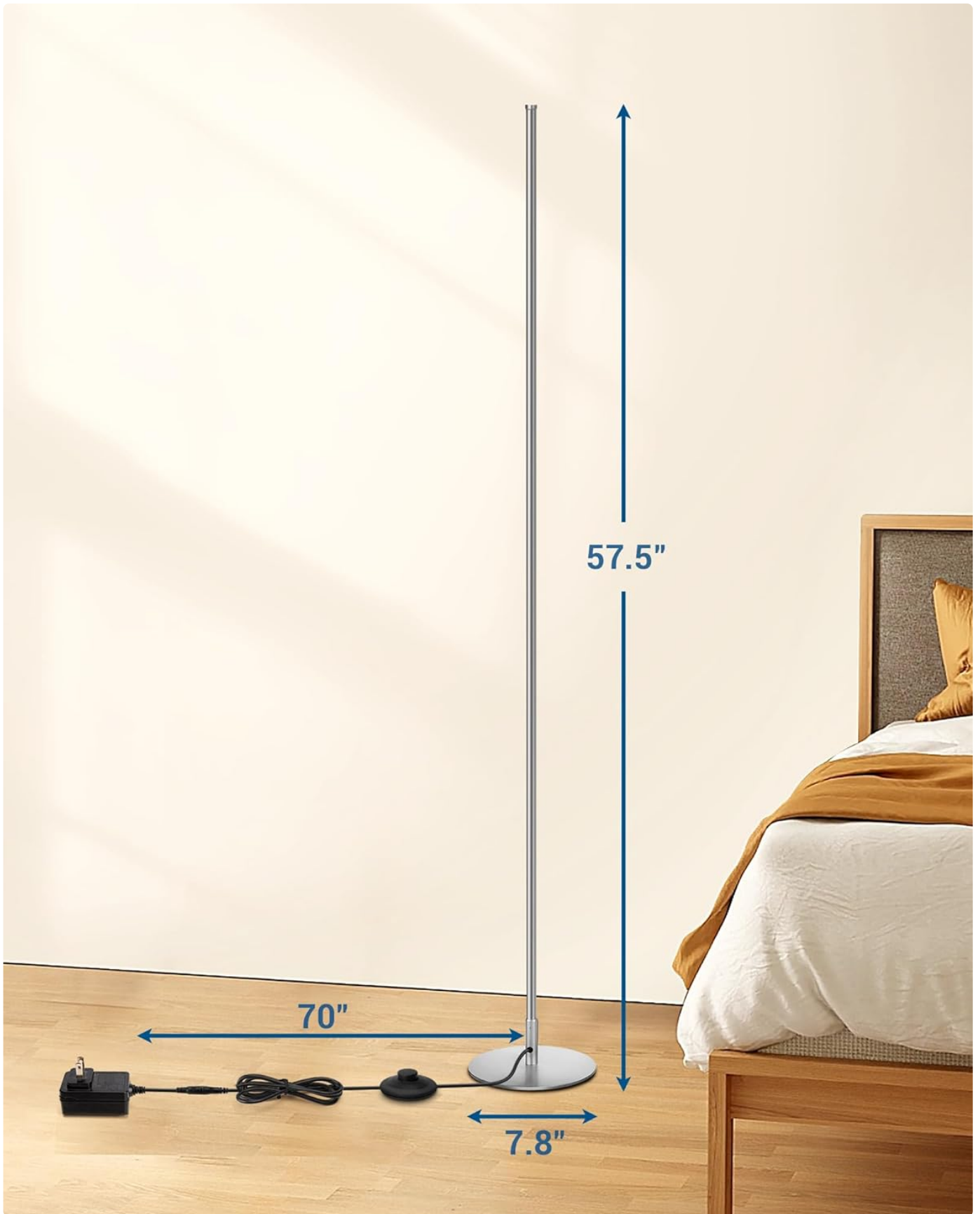
Figure 4: Product Dimensions and Cable Length.