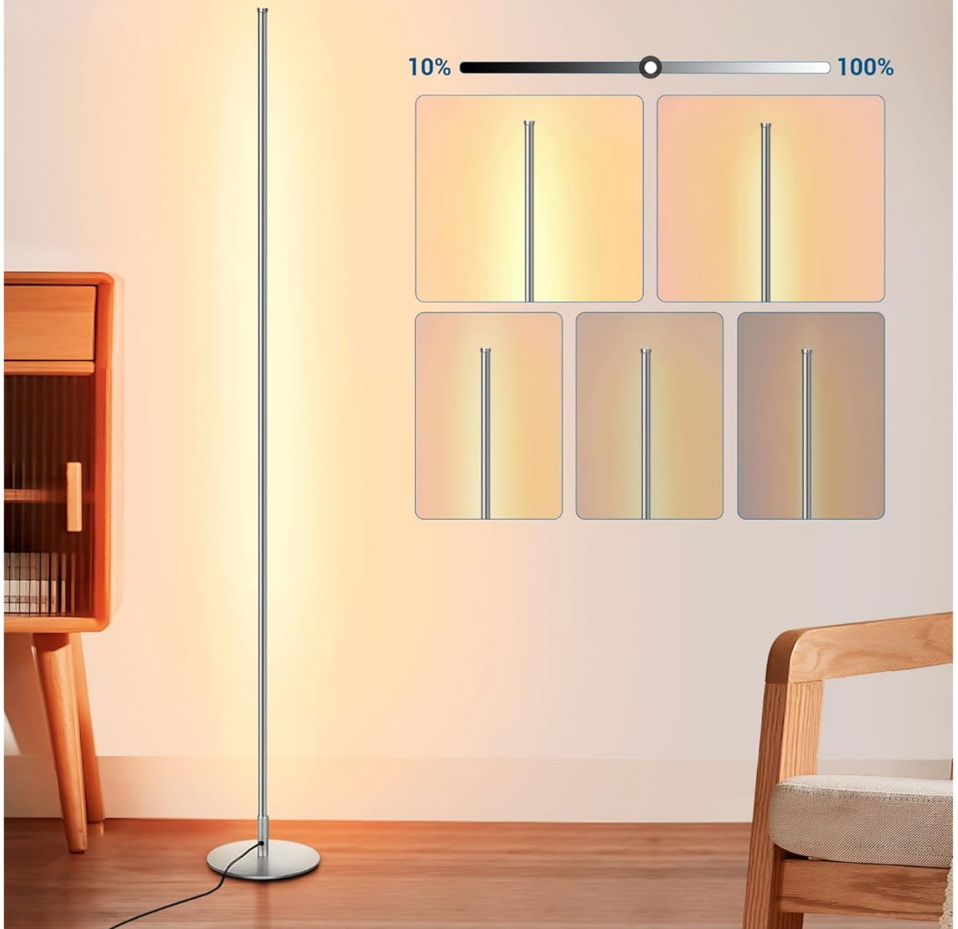
Figure 3: Dimmable and Memory Function allows for personalized lighting.

Memorize the brightness you set before turning it off