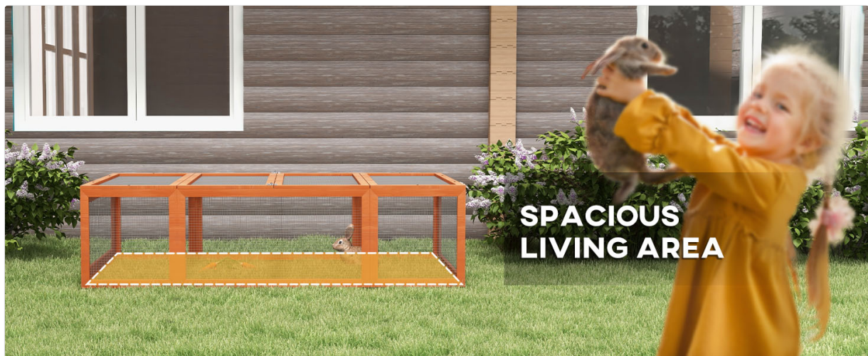
Image 4.1: Illustration of the hutch's multiple access points, including the openable roof and side door.