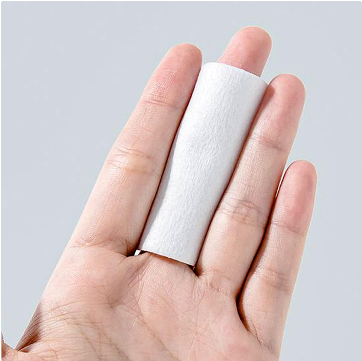
Image 5: A single MINISO Square Cotton Pad held on a hand, demonstrating its size and flexibility.