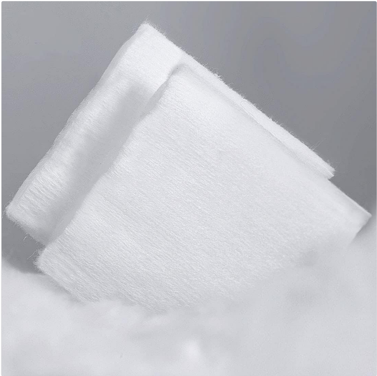
Image 3: A close-up view of two MINISO Square Cotton Pads, highlighting their soft and smooth texture.