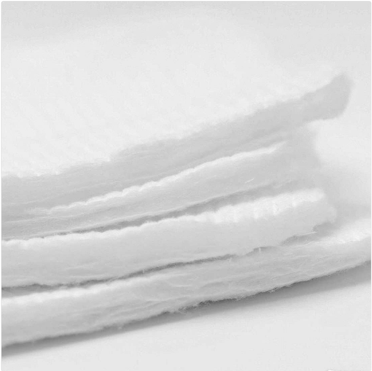
Image 4: A close-up of a stack of MINISO Square Cotton Pads, showing the individual layers and thinness.

2. Press the pad onto the nail for a few seconds, then wipe firmly to remove polish.