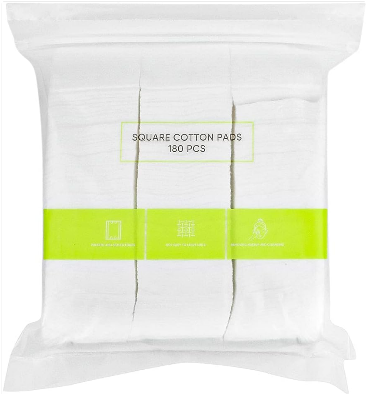
Image 1: Packaging of MINISO Square Cotton Pads, showing 180 pieces.

These pads are super absorbent, minimizing product waste, and are gentle enough for daily facial care, skin cleaning, and nail polish removal.