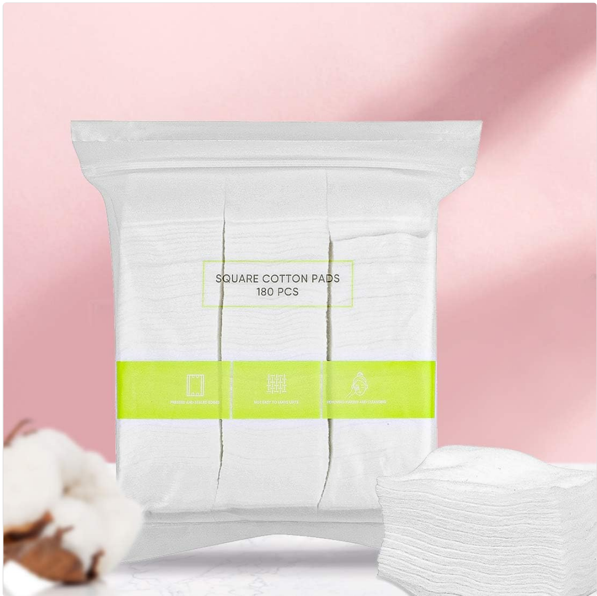
Image 2: A stack of MINISO Square Cotton Pads next to cotton plant, illustrating their softness and natural origin.