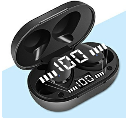
Image: The charging case with earbuds, illustrating the individual LED power display for battery status.

Before first use, fully charge the earbuds and the charging case. Place the earbuds into the charging case. Connect the charging case to a power source using the provided USB cable. The LED display on the charging case will indicate the charging status and battery level.