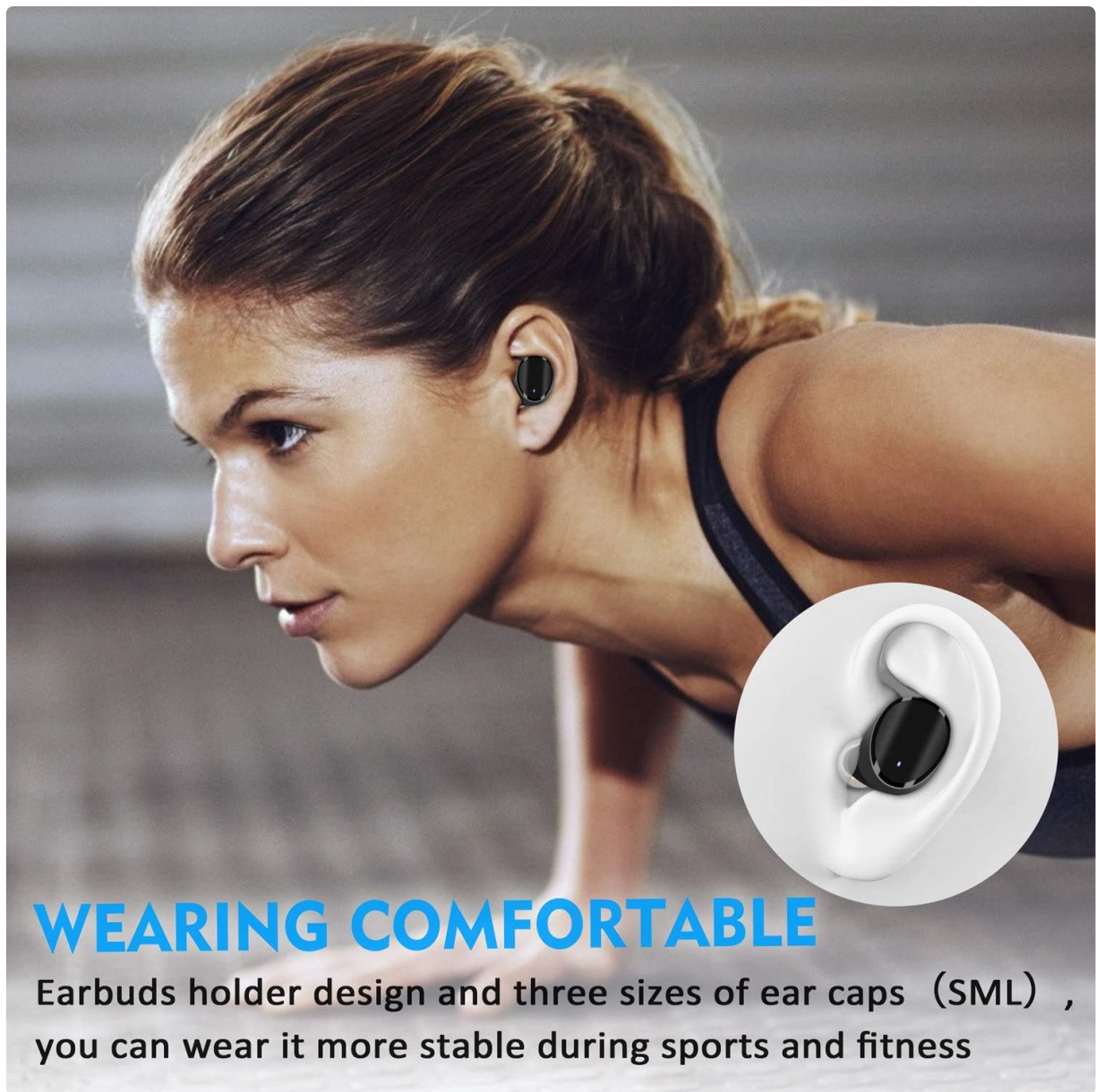
Image: A person wearing the earbud, demonstrating the comfortable and secure fit during physical activity.