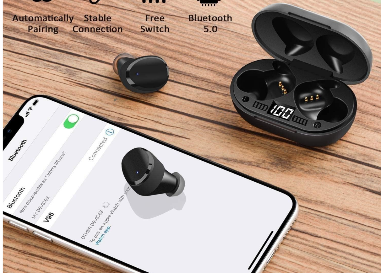
Image: A smartphone screen showing the Bluetooth pairing process, with the DuoTen V98 earbuds ready to connect.