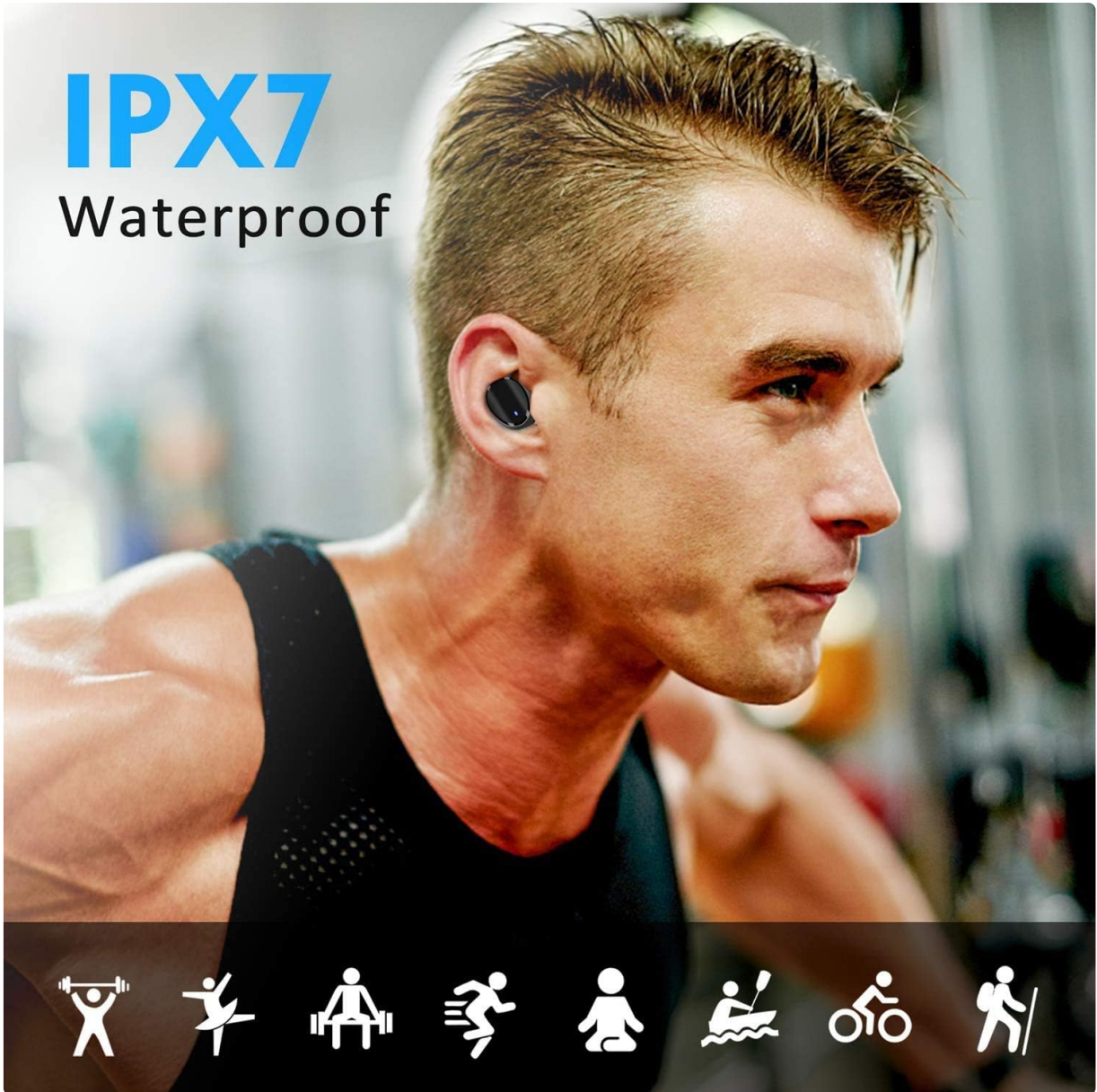
Image: Illustration of the IPX7 waterproof feature, highlighting its suitability for sports and active lifestyles.