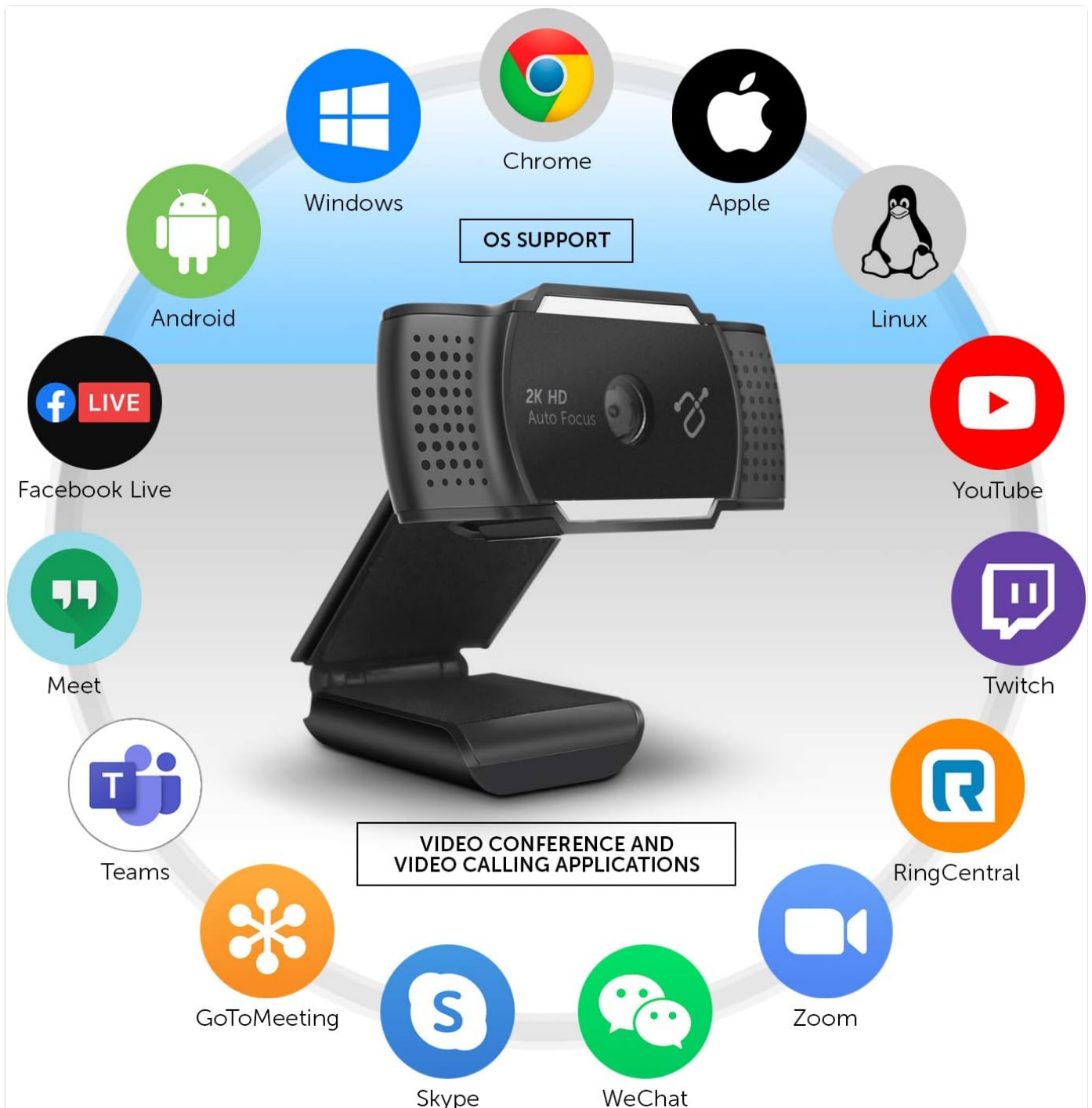
Figure 4: Operating System and Application Compatibility.