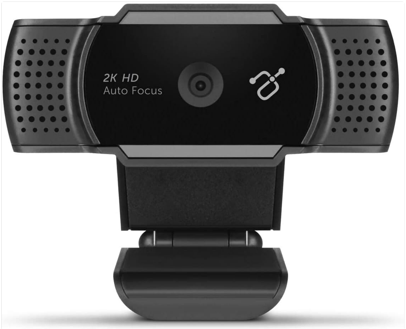
Figure 5: Front view of the webcam, highlighting the integrated light.

The camera eye can also be adjusted up to 30 degrees to perfectly frame your face or desired area.