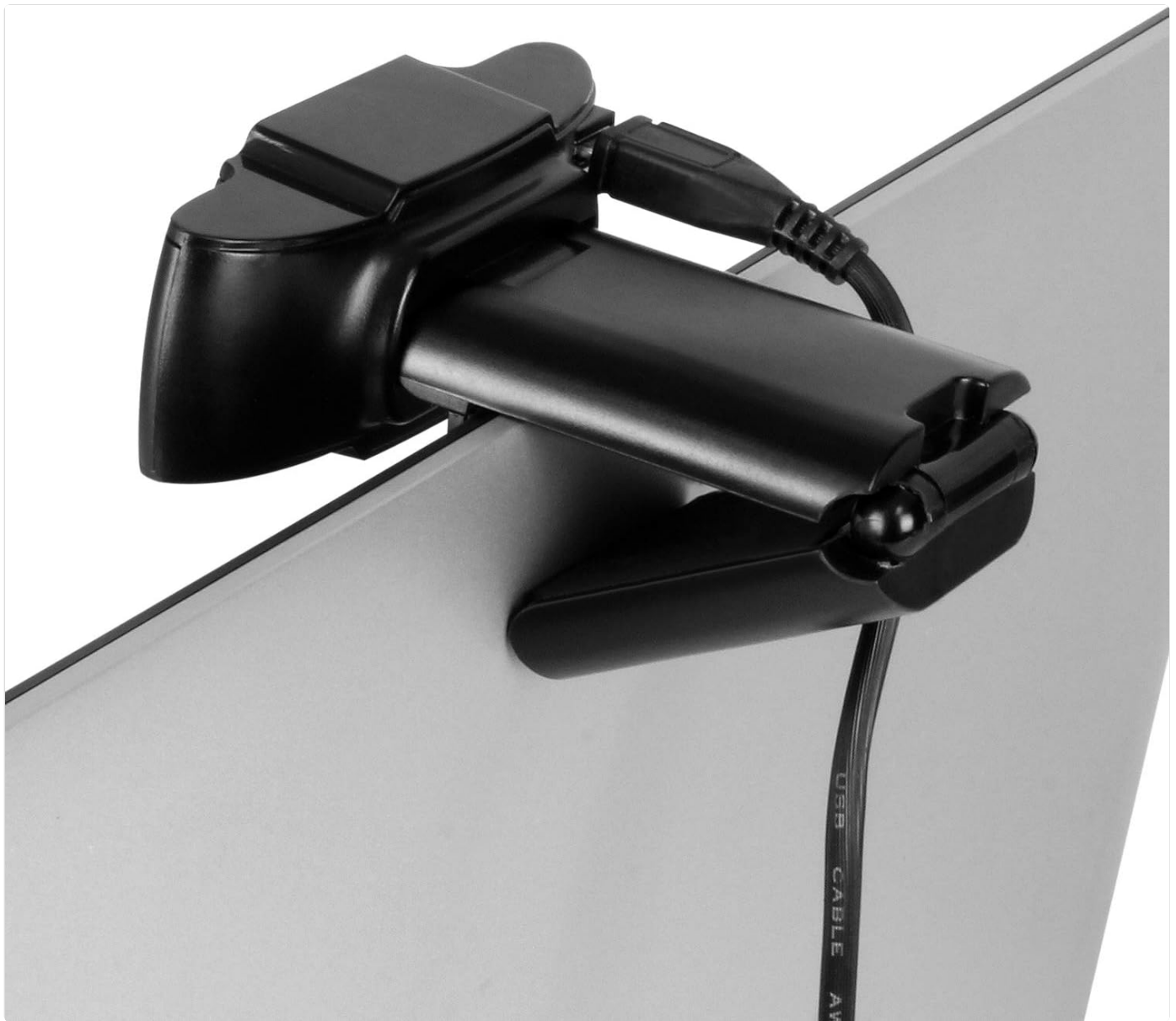
Figure 2: Webcam securely mounted on a laptop.