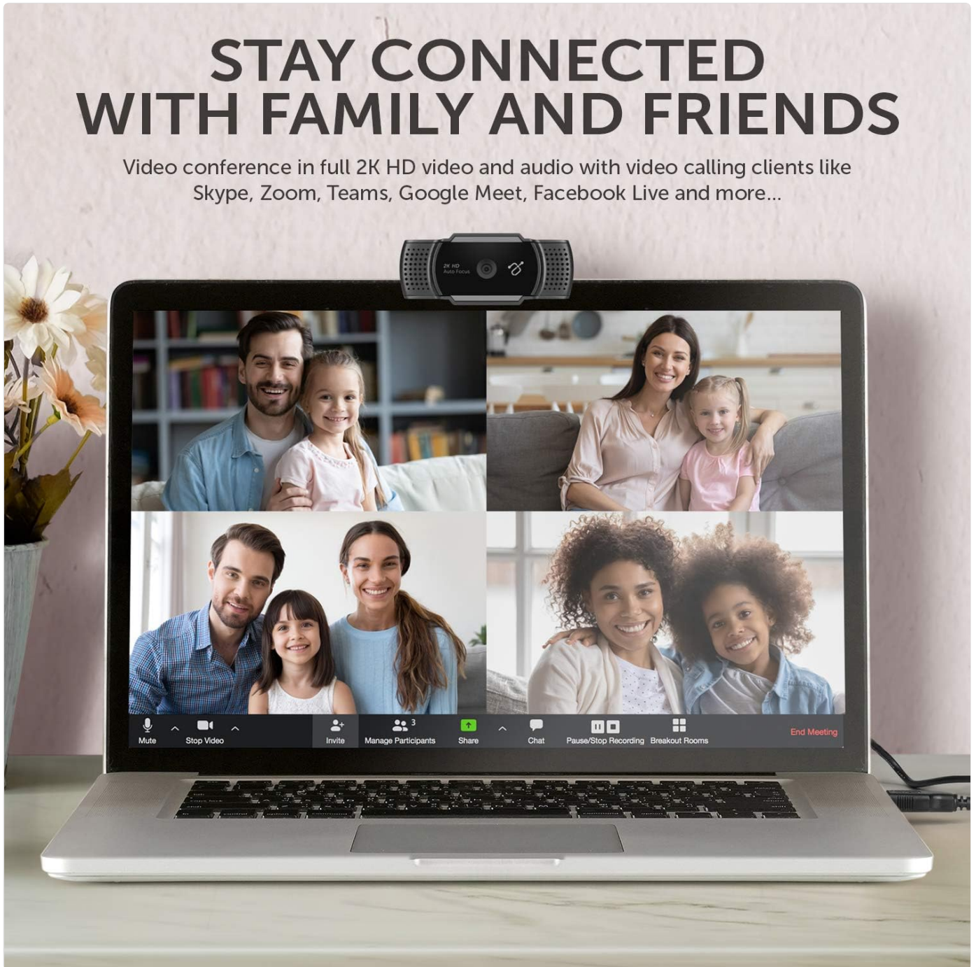
Figure 3: Webcam in use for video conferencing.