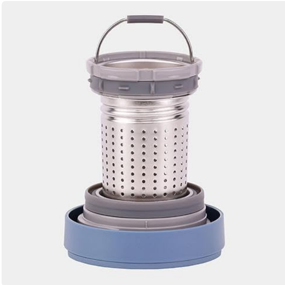
Image: The dual infuser and tea strainer, disassembled to show individual parts.