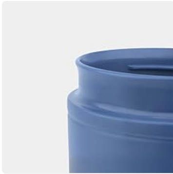
Image: A close-up view of the tumbler's curved lip, designed for comfortable sipping.