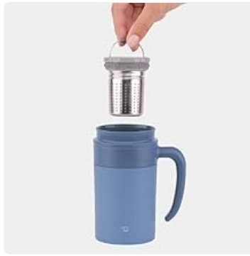
Image: A hand demonstrating how to insert the tea infuser into the tumbler.