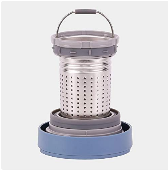
Image: The lid used as a stand for the infuser after steeping.