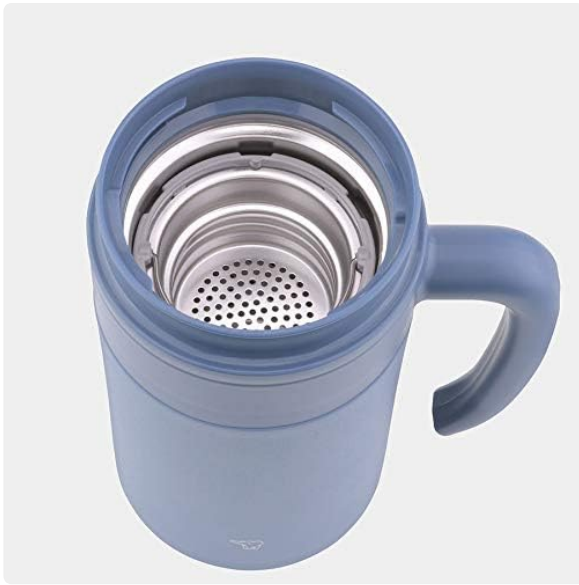
Image: Top view of the tumbler, illustrating the internal components including the infuser.