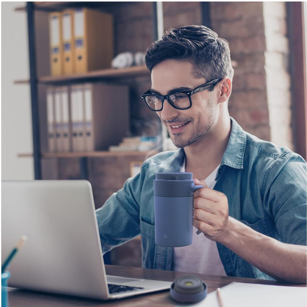
Image: A person using the Zojirushi Stainless Tea Tumbler while working on a laptop, demonstrating typical use.