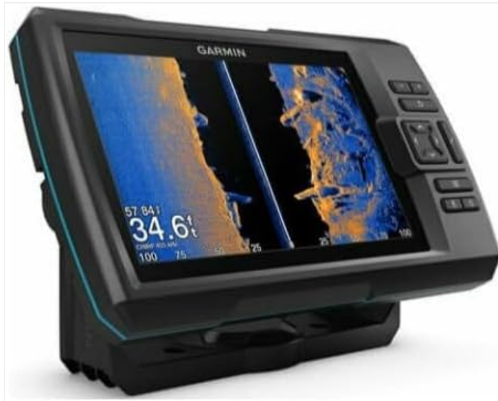
Image: Angled view of the Garmin STRIKER Vivid 7sv fishfinder, showing its display and physical buttons.

boat's console or dashboard. Ensure the mounting surface is stable and provides clear visibility of the screen from your operating position.