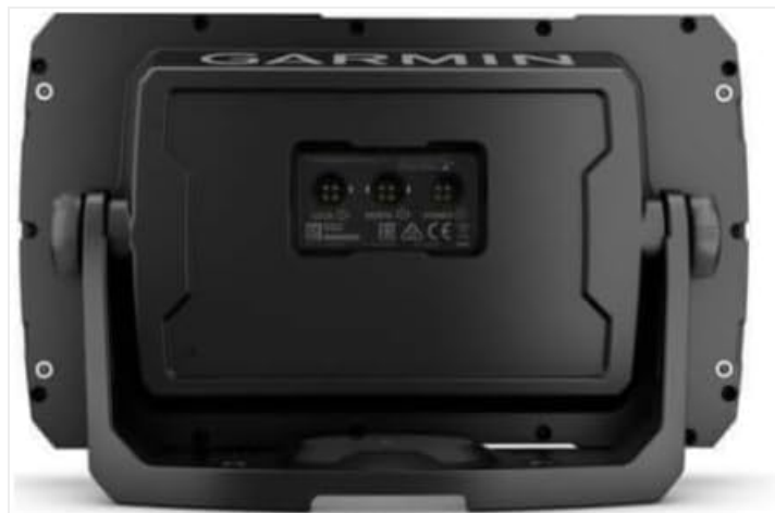
Image: Rear view of the Garmin STRIKER Vivid 7sv unit, highlighting the connection ports for power and transducer cables.

The GT52HW-TM transducer supports both transom mount and trolling motor mount installations. Select the appropriate mounting method for your vessel. Ensure the transducer is positioned correctly to avoid interference and achieve optimal sonar readings. Connect the transducer cable to the back of the STRIKER Vivid 7sv unit using the provided 12-pin to dual 4-pin adapter cable.