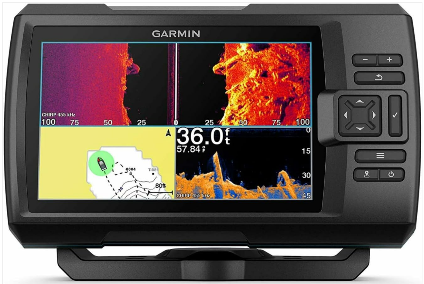
Image: Garmin STRIKER Vivid 7sv screen showing a split display with both sonar data and a GPS map, allowing simultaneous monitoring of underwater conditions and navigation.