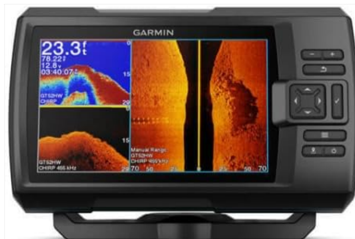
Image: Garmin STRIKER Vivid 7sv screen showing a split display with different sonar views, including traditional and scanning sonar, for comparison.