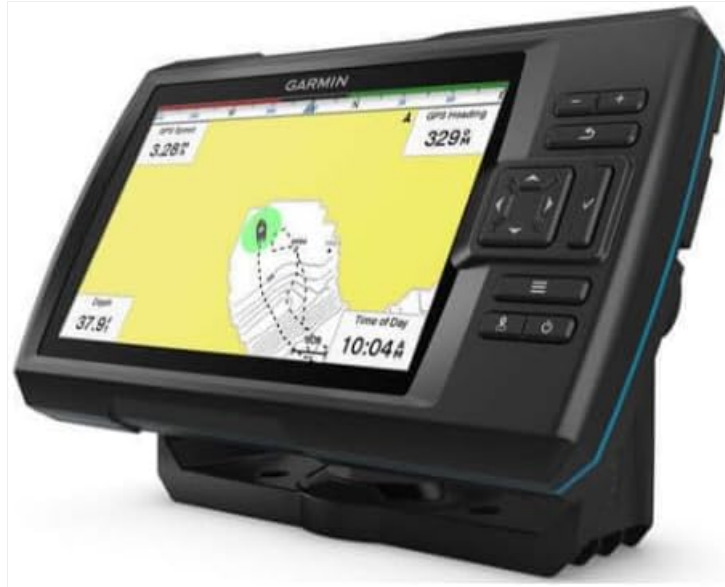
Image: Angled view of the Garmin STRIKER Vivid 7sv displaying a GPS map, showing boat heading, speed, and marked waypoints.