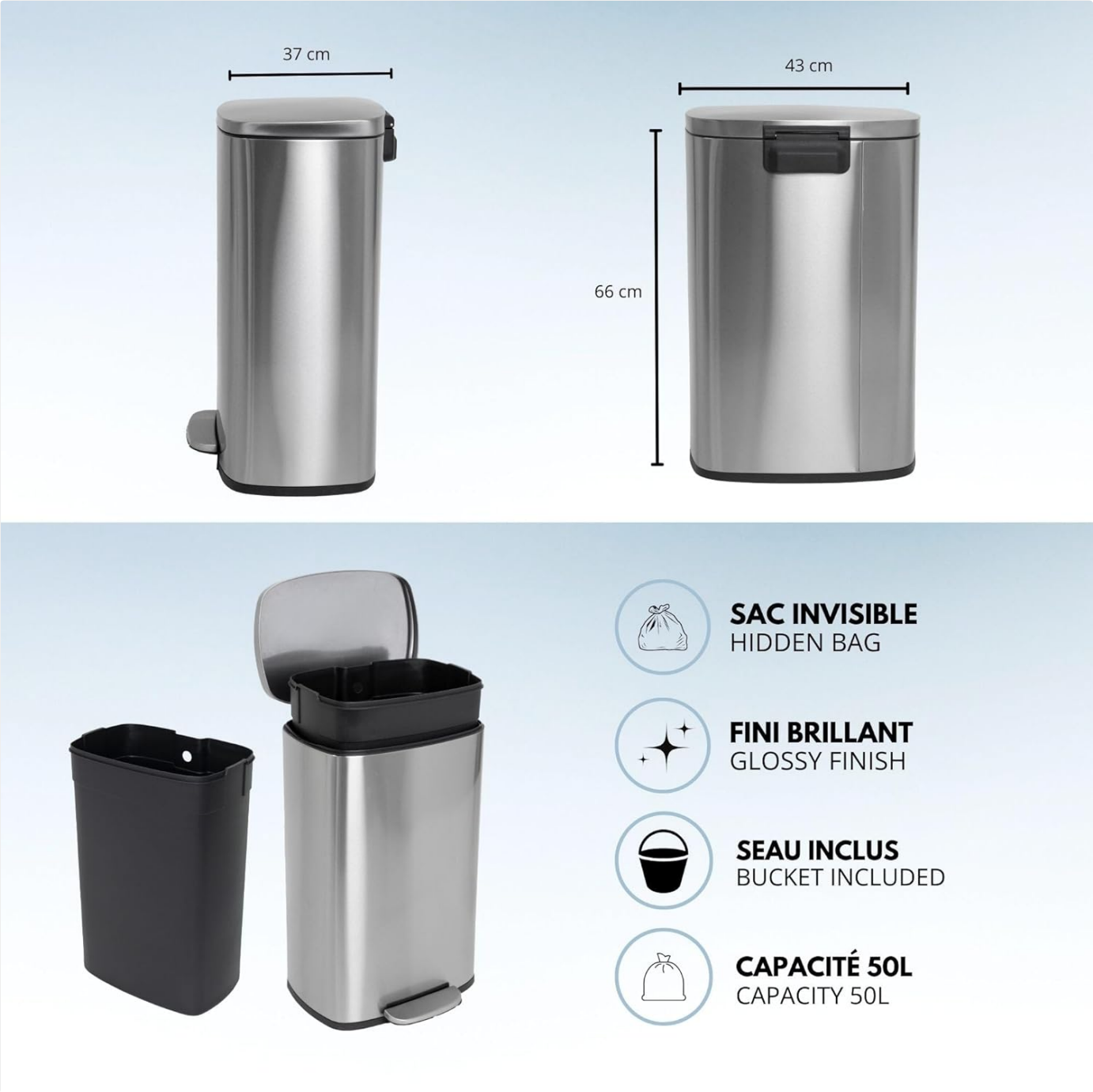
Image: A detailed graphic illustrating the dimensions (43x37x66 cm) of the KITCHEN MOVE BAT-97965 pedal bin and highlighting key features such as "Hidden Bag", "Glossy Finish", "Bucket Included", and "Capacity 50L". This provides a comprehensive overview of the product's physical attributes and benefits.