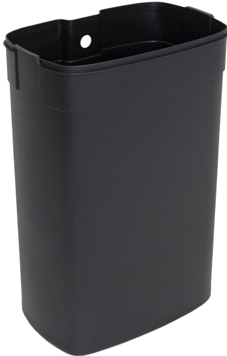
Image: A close-up view of the removable black plastic inner bucket. This component is designed to hold the bin liner and facilitate easy waste disposal and cleaning.