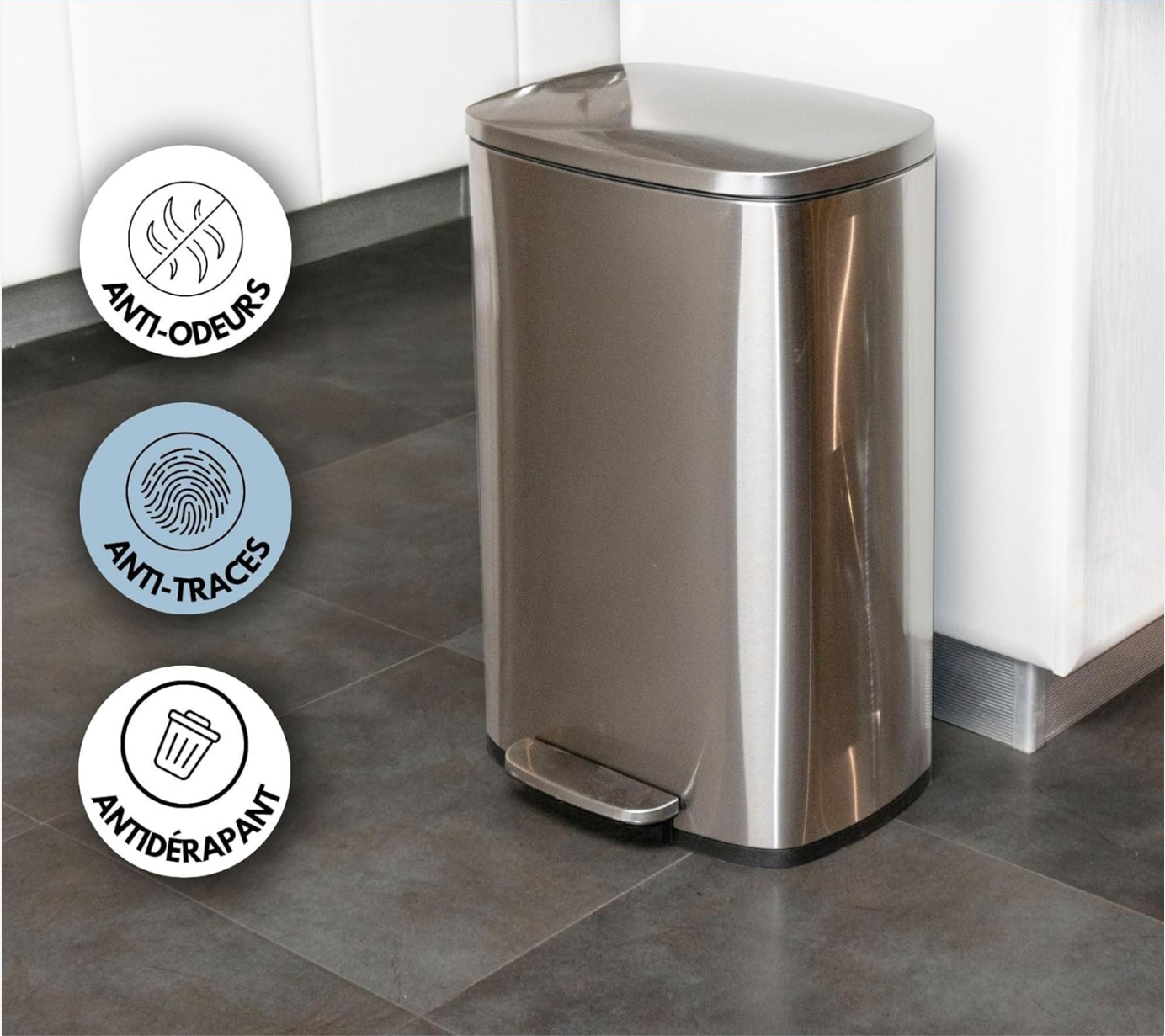
Image: The KITCHEN MOVE BAT-97965 pedal bin with icons indicating its anti-odor, anti-fingerprint, and non-slip base features. This visual emphasizes the bin's hygienic and user-friendly design aspects.