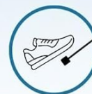
Image: A composite image showing the "Easy to Move" handle at the back of the bin and the "Pedal Opening" mechanism at the base. This illustrates the convenience features for operation and portability.