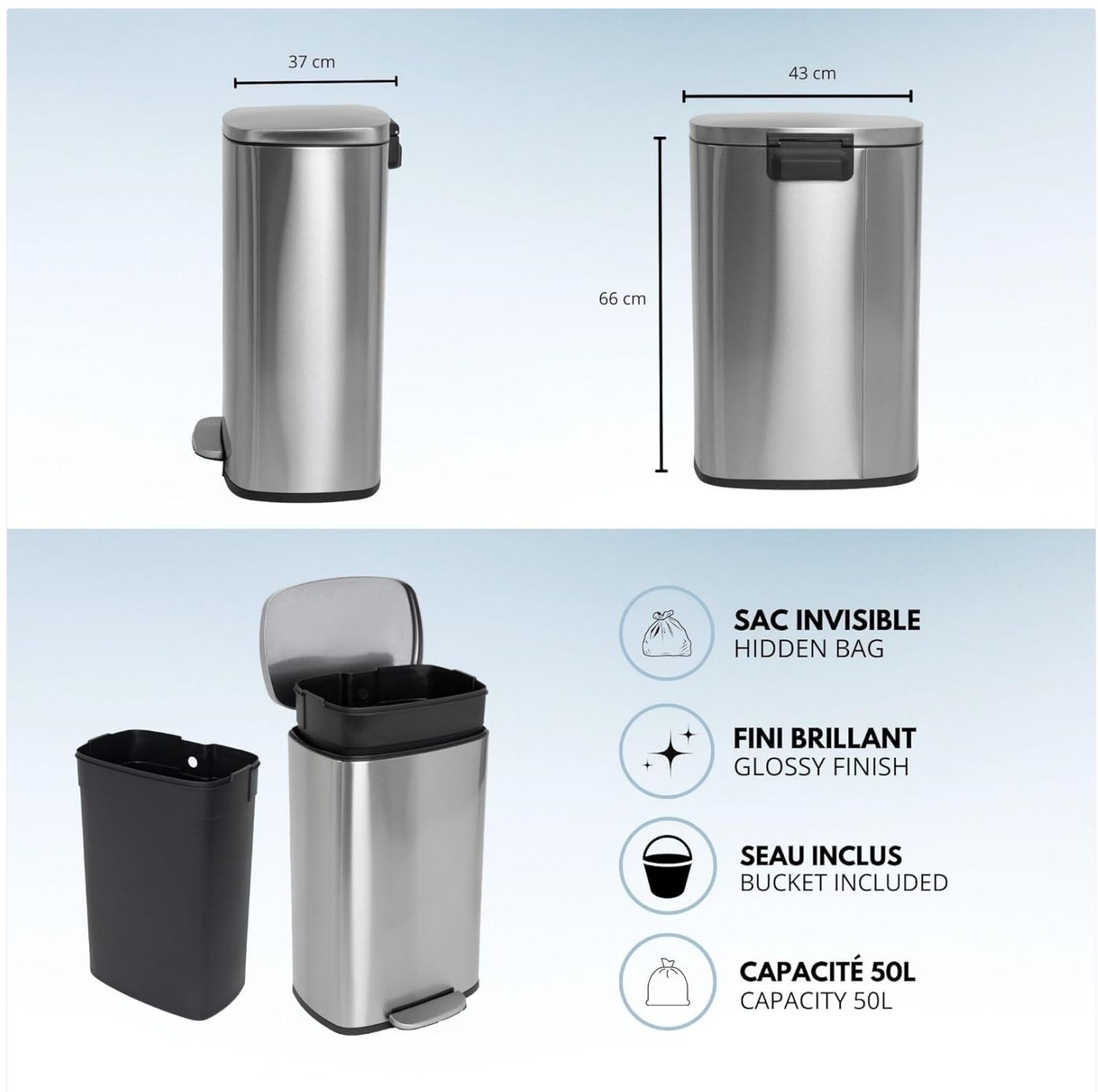
Image: An exploded view of the KITCHEN MOVE BAT-97965 pedal bin, showing the outer stainless steel body and the removable black plastic inner bucket. This image highlights the bin's internal structure and its components.