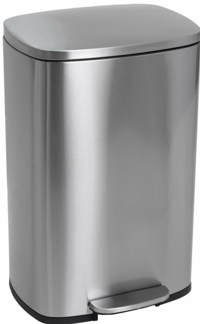
Image: The KITCHEN MOVE BAT-97965 50L Metal Pedal Bin, featuring a brushed stainless steel finish, positioned next to a kitchen island. This image illustrates the bin's sleek design and how it integrates into a contemporary kitchen environment.