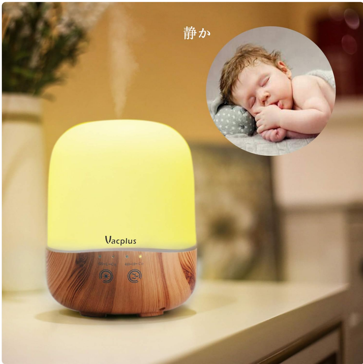
The Vacplus humidifier emitting a soft yellow light, highlighting its quiet operation, with an inset image of a sleeping baby, suggesting its suitability for use in a nursery or bedroom.