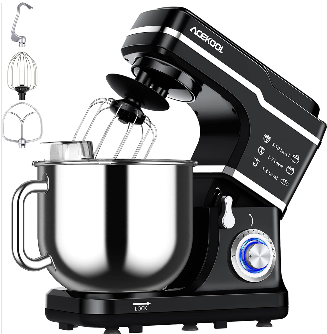
Figure 1: Acekool Stand Mixer with its primary attachments and stainless steel bowl.