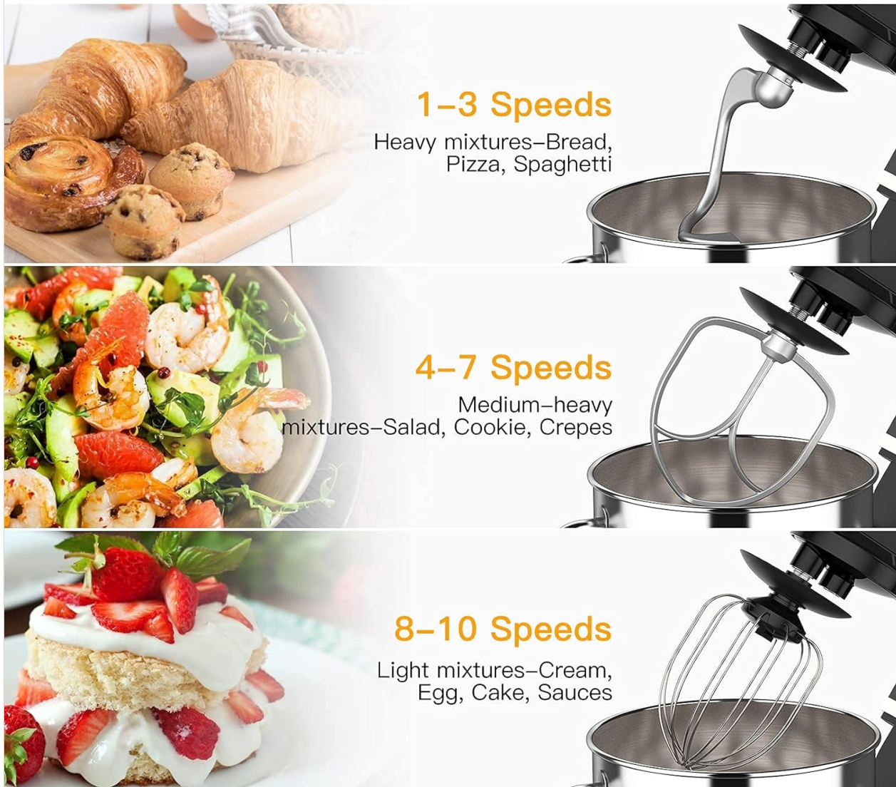
Figure 5: Visual guide to the 10-speed settings and their corresponding attachments for various mixing tasks.