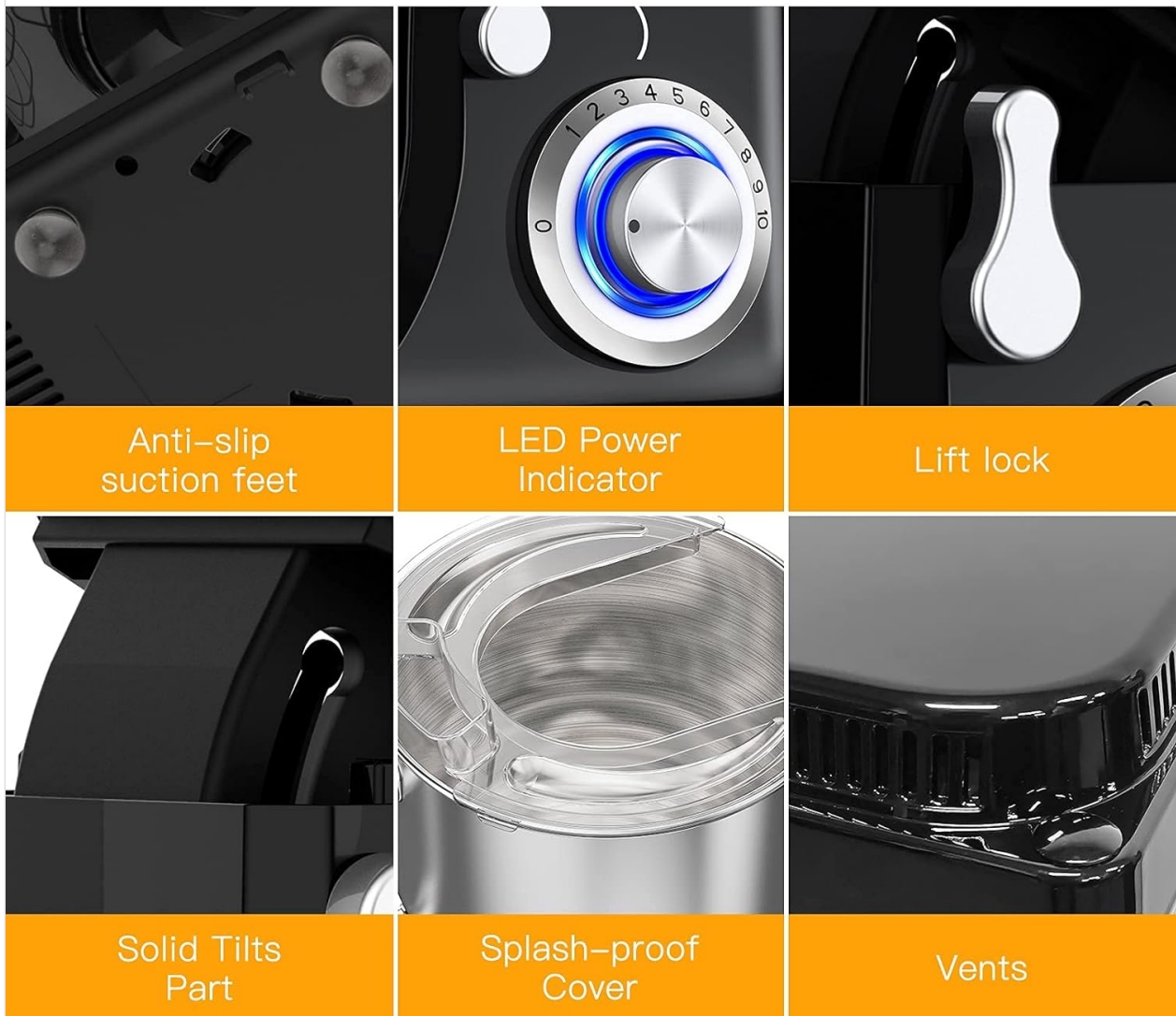
Figure 4: Close-up of the mixer's design, showing the tilt-head mechanism, LED power indicator, and anti-slip suction feet.