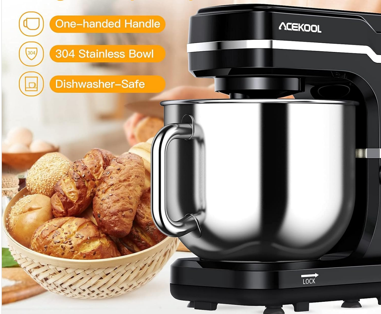
Figure 2: The 7.5-quart stainless steel mixing bowl, featuring a convenient handle for easy lifting and pouring.