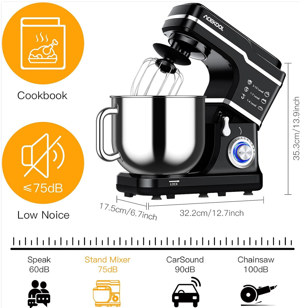
Figure 3: Overview of the Acekool Stand Mixer, highlighting its compact dimensions (12.68"W x 6.89"D x 13.9"H) and low noise operation ( \leq 75\text{dB} ).