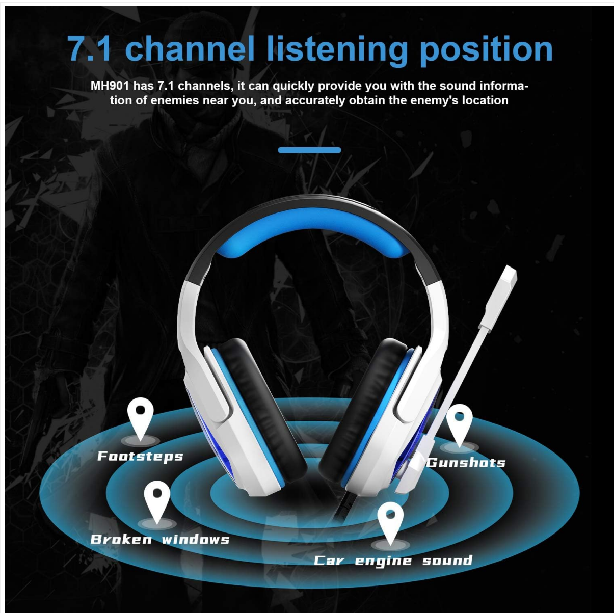
Image: Visual representation of 7.1 channel audio, showing how different sound effects are perceived from various directions.

The Anivia Y-901B-M headset delivers an immersive 7.1 virtual surround sound experience through its high-precision 50mm neodymium audio drivers. This feature enhances spatial awareness in games, allowing you to pinpoint sound sources like footsteps or gunshots from various directions.