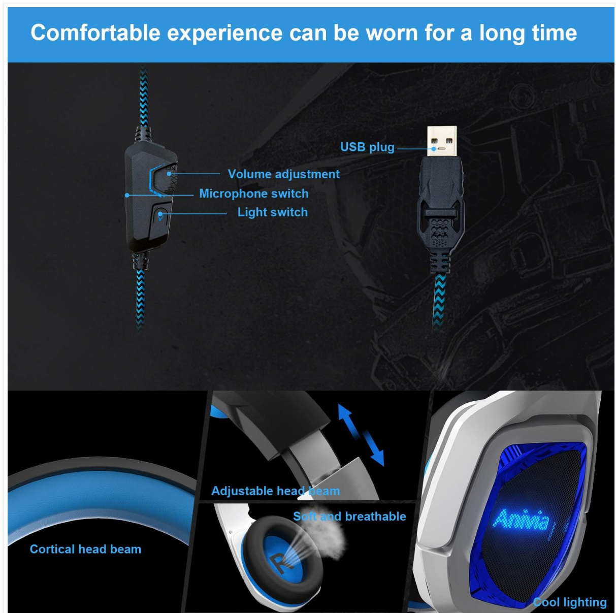
Image: Detailed view of the headset's in-line controls, adjustable headband, soft earcups, and LED lighting.