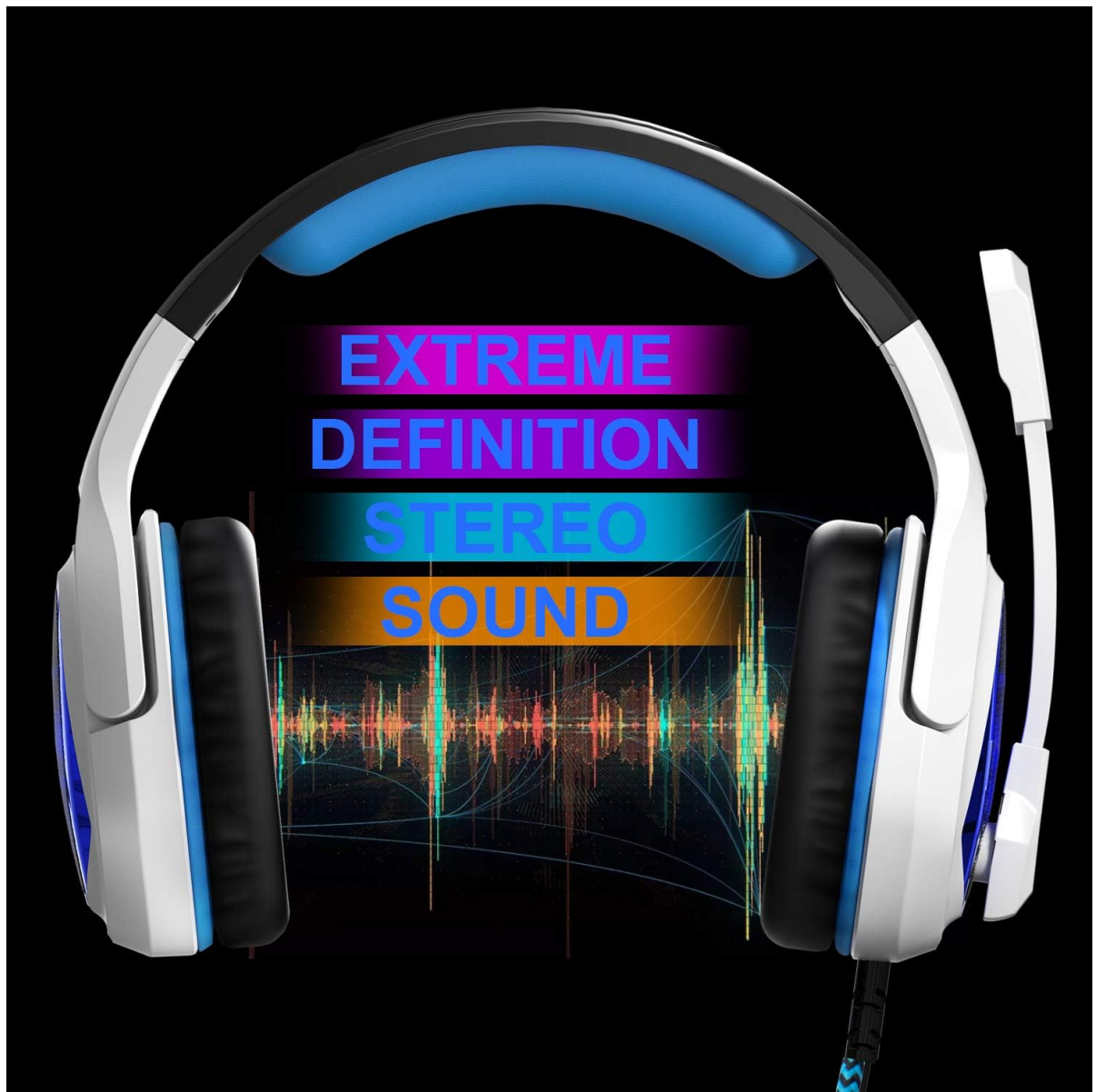
Image: Front view of the Anivia Y-901B-M Gaming Headset, showcasing its design with blue accents and the adjustable microphone.