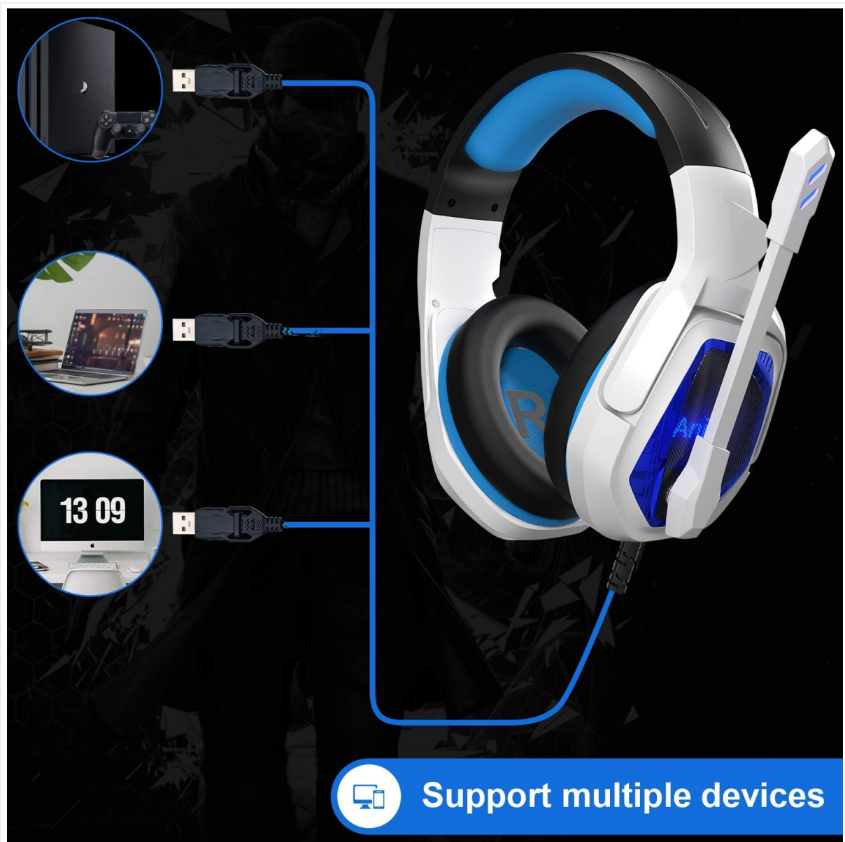
Image: Illustration of connecting the USB headset to various devices including a PlayStation, laptop, and desktop PC.