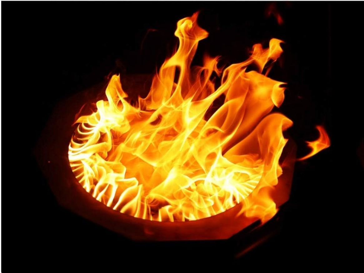
Figure 4: The INNO STAGE Fire Pit in operation at night, showcasing a vibrant, smokeless flame, indicative of its efficient combustion system.