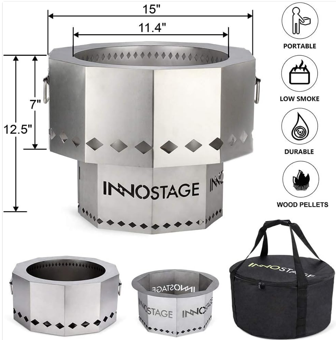
Figure 1: Overview of INNO STAGE Fire Pit components and key dimensions. The image displays the main fire pit body, the base, and the carrying bag, with measurements indicating a 15-inch outer diameter and 12.5-inch height.

Dimensions: Outer diameter 15" (inner diameter 11.4") x height 12.5".