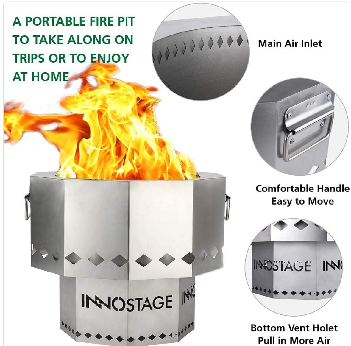
Figure 2: Close-up view of the INNO STAGE Fire Pit highlighting the main air inlet, comfortable handle for easy movement, and bottom vent holes designed to pull in more air for efficient combustion.