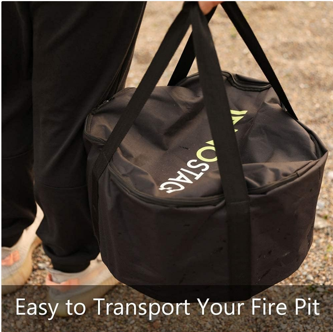
Figure 5: A person easily transporting the INNO STAGE Fire Pit using its portable carrying storage bag, highlighting its convenience for travel and storage.

Video 3: This video demonstrates the disassembly process of a similar fire pit, showing how to separate the components for cleaning and compact storage in the carrying bag.