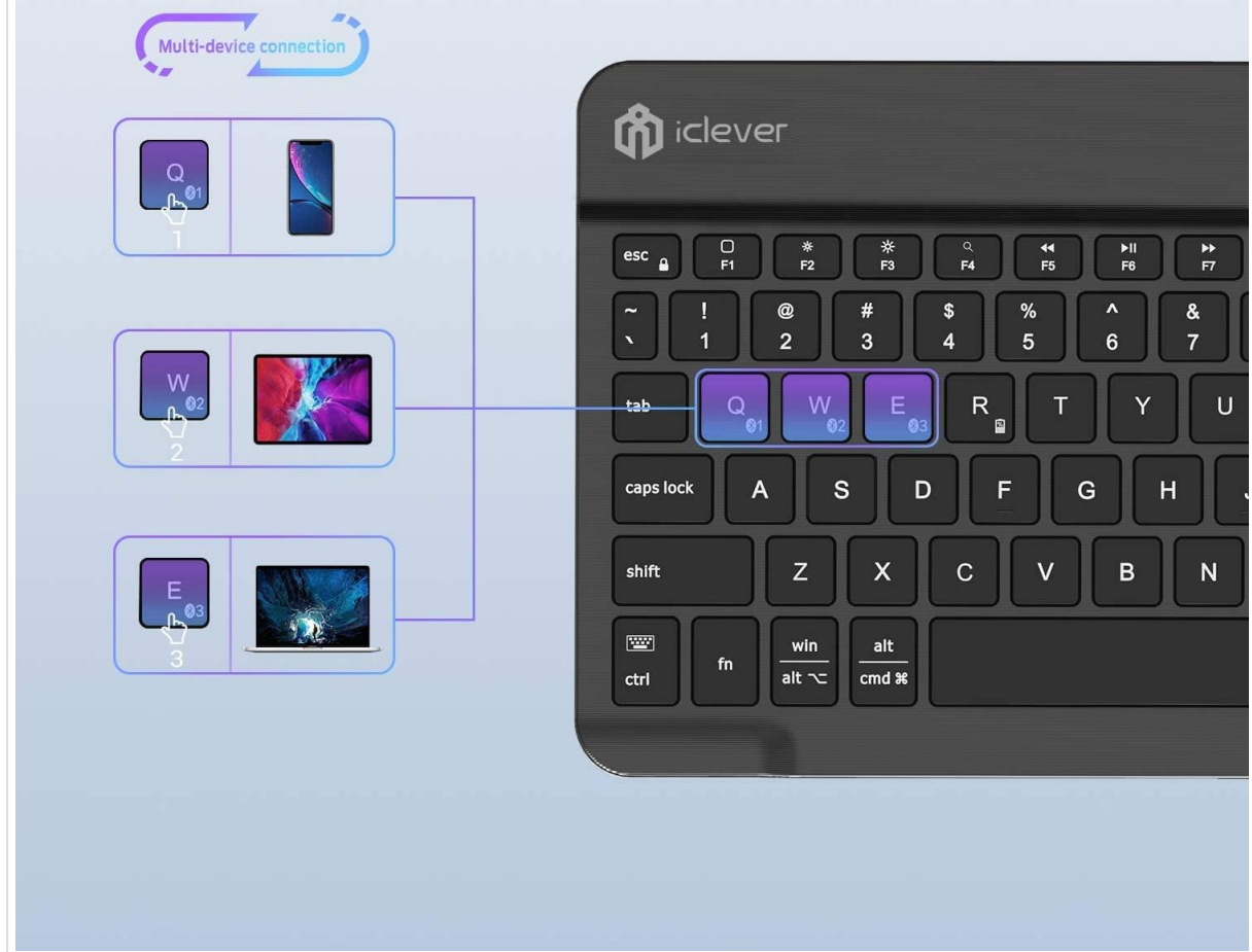
Diagram illustrating the multi-device connection capability of the iClever BK04 keyboard, allowing connection to a phone, tablet, and laptop.