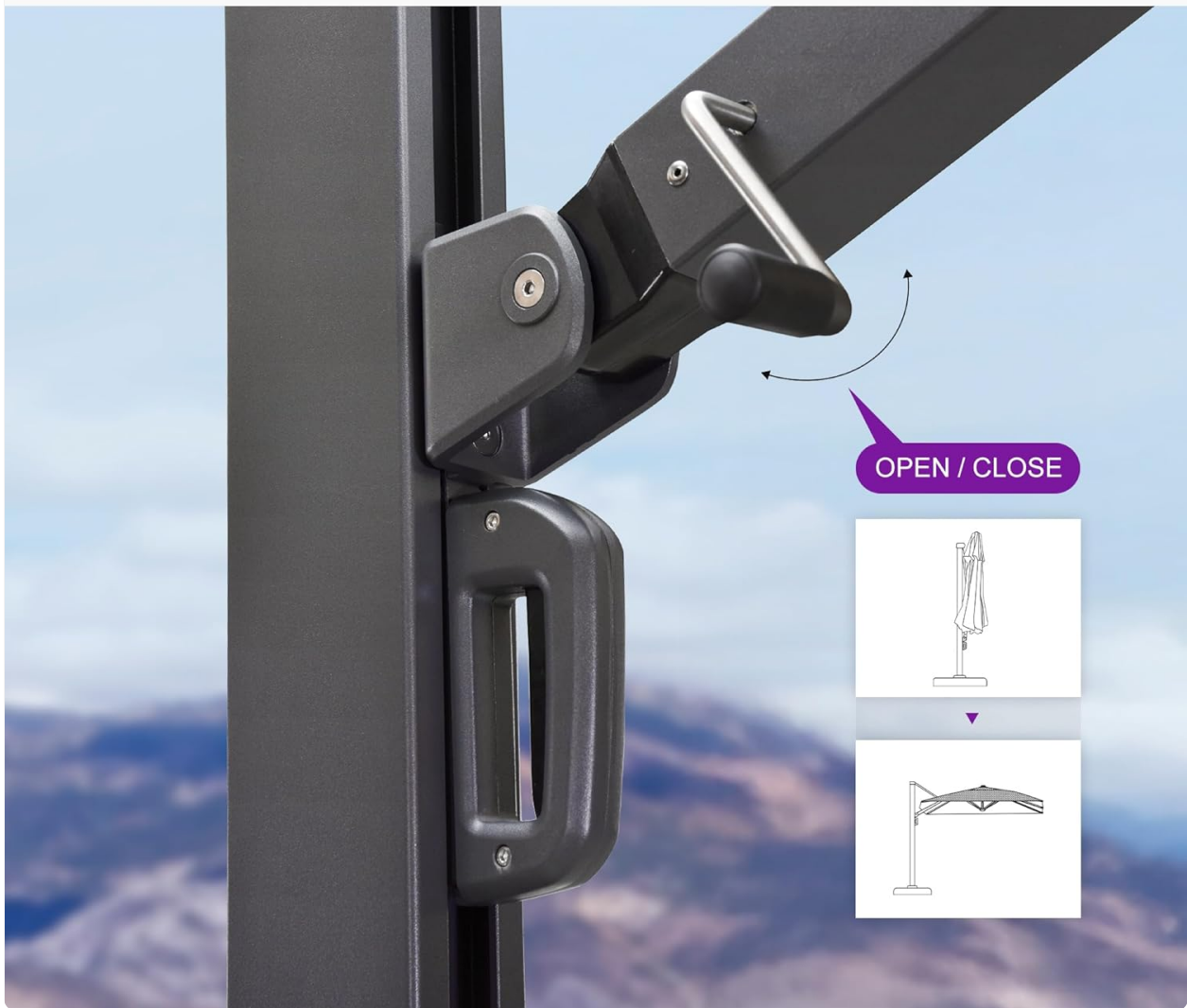
Image: A detailed view of the thickened stabilizing rod, which forms a strong union between the main pole and the umbrella ribs for enhanced durability.

Open or collapse the umbrella effortlessly with single-hand operation