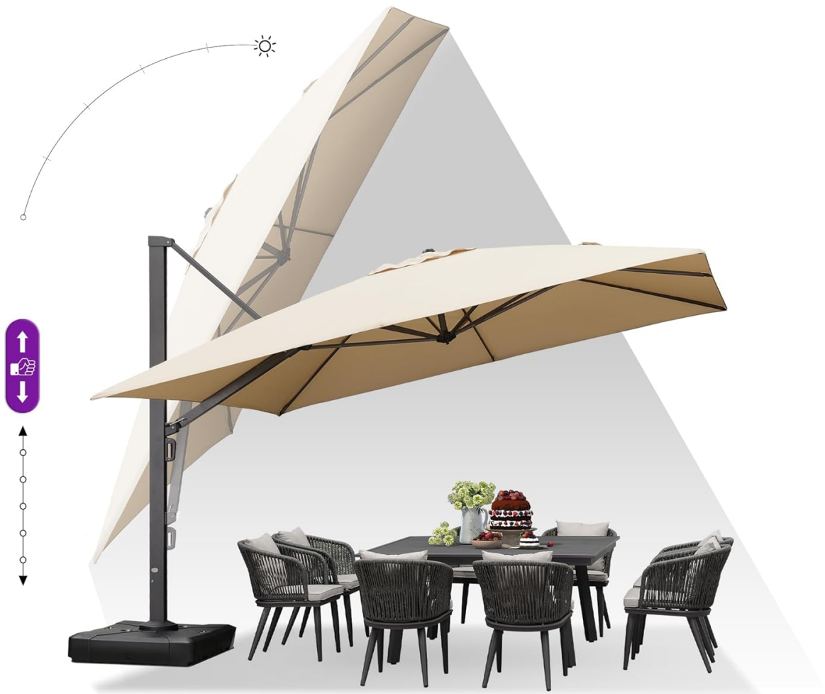
Image: The umbrella demonstrating its 360-degree rotation capability, allowing for flexible shade coverage.