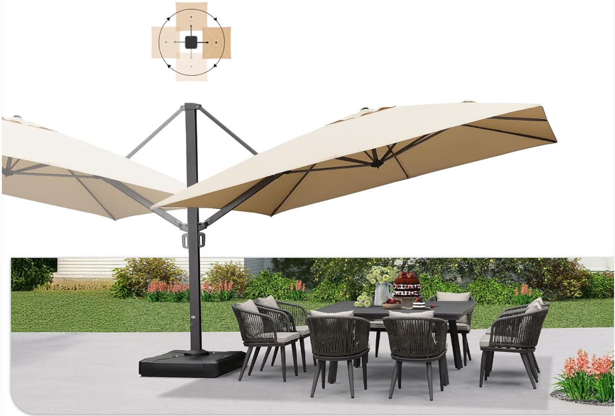
Image: A visual guide showing the various height and angle adjustments possible with the umbrella's mechanism.