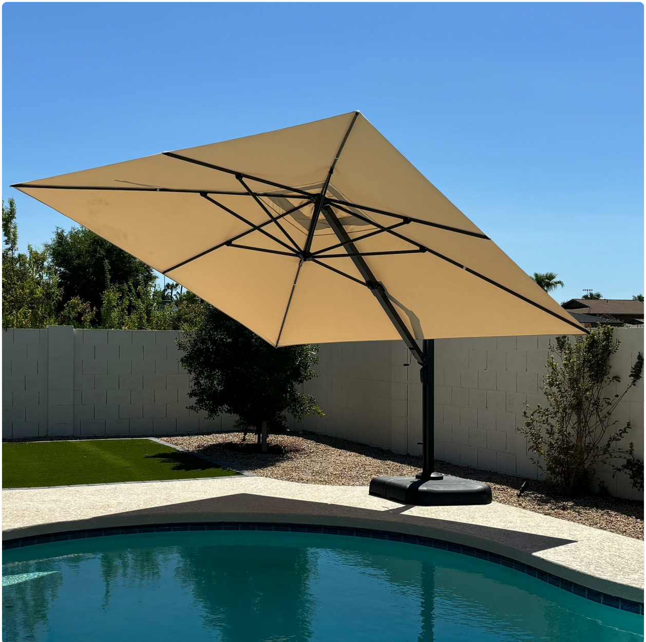
Image: The PURPLE LEAF 12 FT Square Cantilever Patio Umbrella fully open, providing shade over a patio seating area.