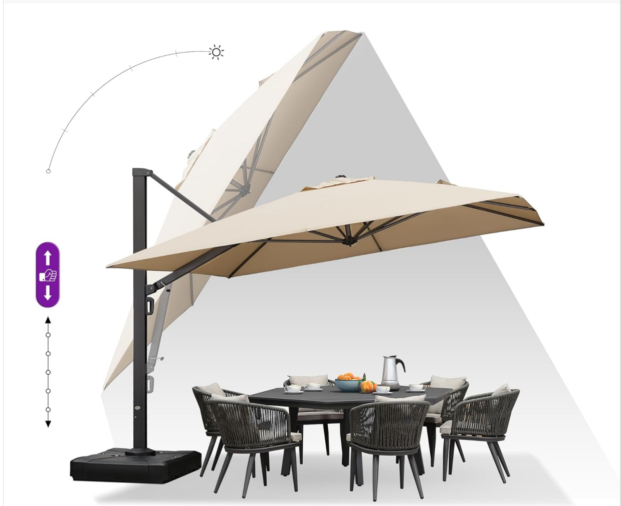
Image: 5 Levels Height Adjustment. This diagram demonstrates the five adjustable height and angle settings to provide maximum coverage from the sun.