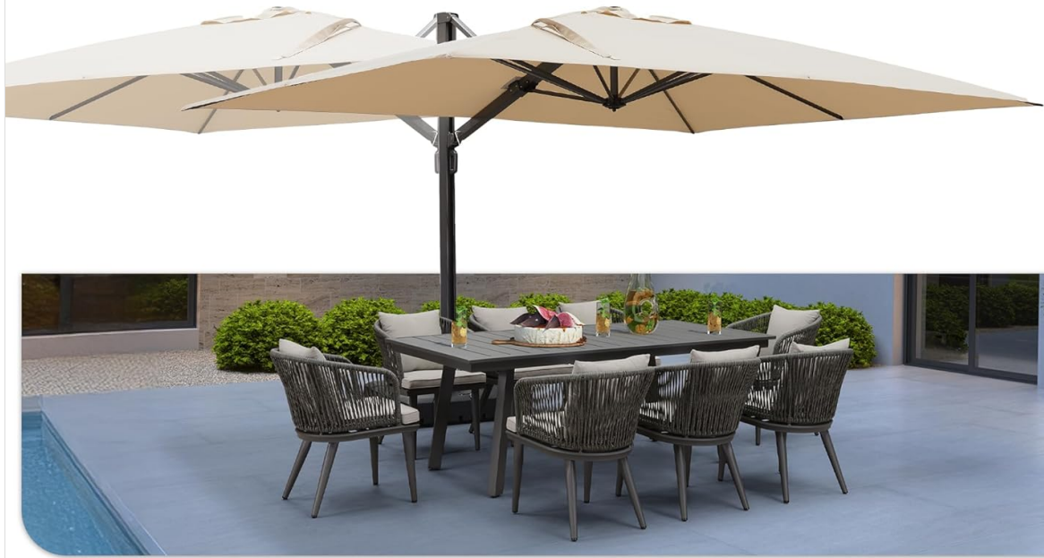
Image: 360-Degree Rotation. This image illustrates the umbrella's ability to rotate 360 degrees, allowing for flexible shade adjustment throughout the day.