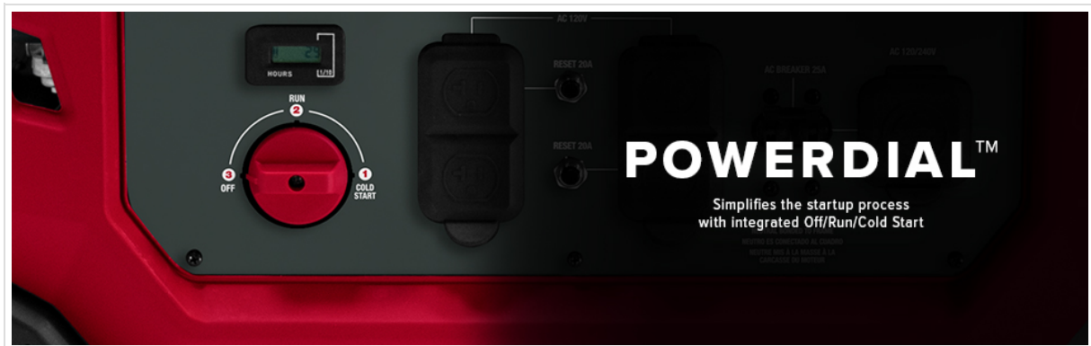
Figure 3: Close-up of the Powerdial, simplifying the startup process with integrated Off/Run/Cold Start settings.

Video 1: Official demonstration of the Powermate PM7500 generator's features and operation, including the Powerdial and COsense technology.