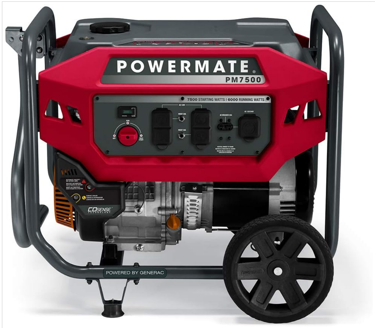
Figure 1: Front view of the Powermate PM7500 generator, showing the control panel and outlets.