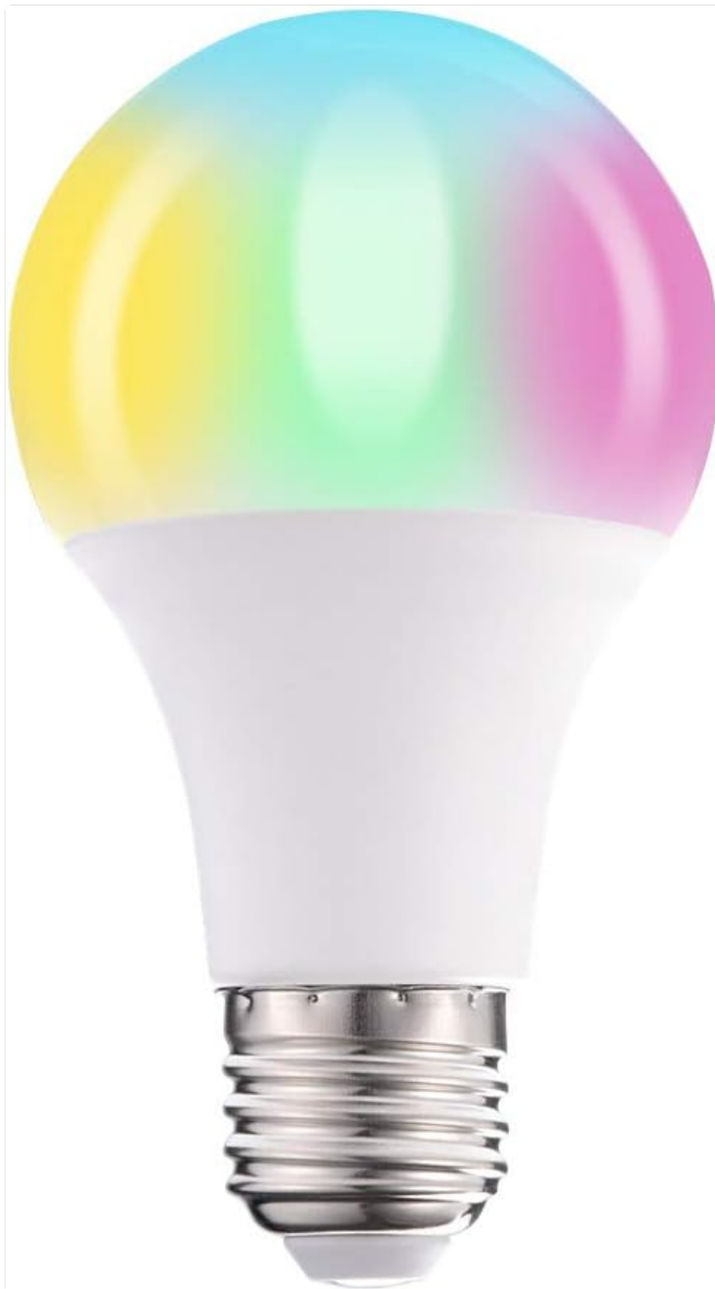
Image 1.1: The Gabba Goods Rainbow Color Changing LED Light Bulb, showcasing its standard shape and colorful illumination.