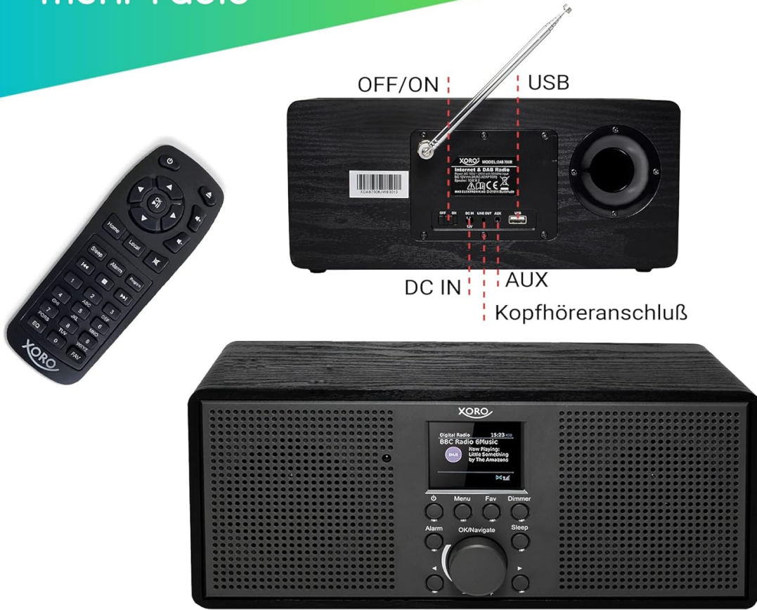
Image 4.3: Rear panel of the XORO DAB 700 IR, showing the Power ON/OFF switch, USB port, DC Power Input, Auxiliary Input (AUX), and Headphone Jack. A telescopic antenna is also visible.