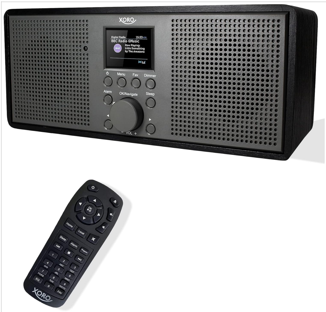
Image 4.1: Front view of the XORO DAB 700 IR Internet Radio and its remote control. The radio features a central display, control buttons for Menu, Fav, Dimmer, Alarm, OK/Navigate, Sleep, and a large rotary knob for volume and selection.

The front panel features a clear color LCD display and essential control buttons and a rotary knob for navigation and volume.