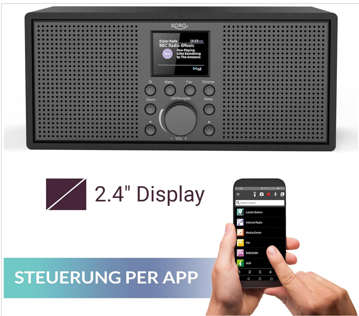
Image 6.11: The XORO DAB 700 IR's 2.4-inch display and an illustration of app control via a smartphone, showing various mode selections.

Control your radio conveniently using a smartphone or tablet app (iOS and Android).