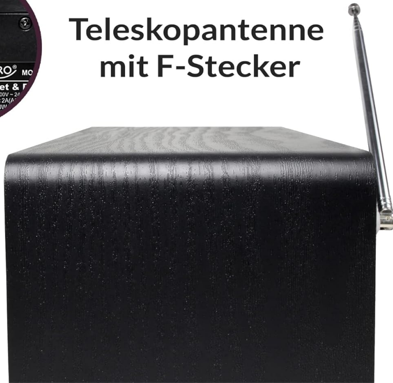
Image 4.4: Side view of the XORO DAB 700 IR, illustrating the bass-reflex wooden casing for rich stereo sound and the telescopic antenna with F-connector.