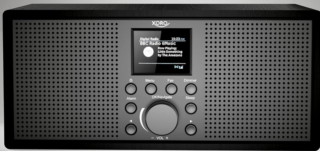
Image 4.2: Front view of the XORO DAB 700 IR, highlighting its stereo sound capabilities with 2 x 10 Watt output and DSP technology.