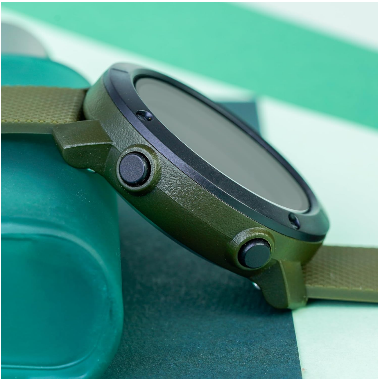
Image 3.1: Side view of the watch highlighting the control buttons.