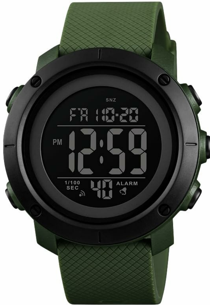
Image 1.1: Front view of the SKMEI Model 1426AGBK Digital Sports Watch.