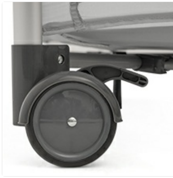
Image: Close-up of the playpen wheel with a locking mechanism for stability.