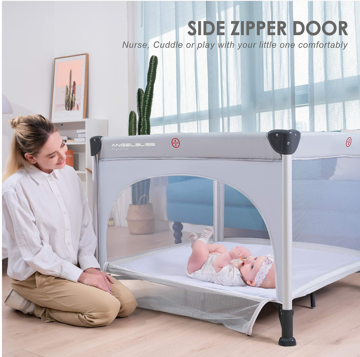
Image: The ANGELBLISS Playpen featuring a convenient side zipper door for easy access to your child.