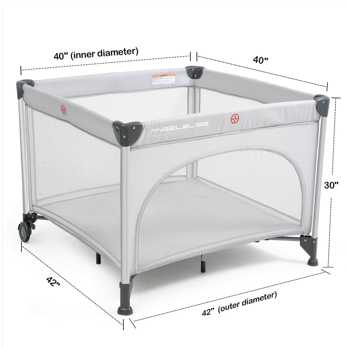
Image: Diagram showing the playpen dimensions: 42 inches outer diameter, 40 inches inner diameter, and 30 inches height.