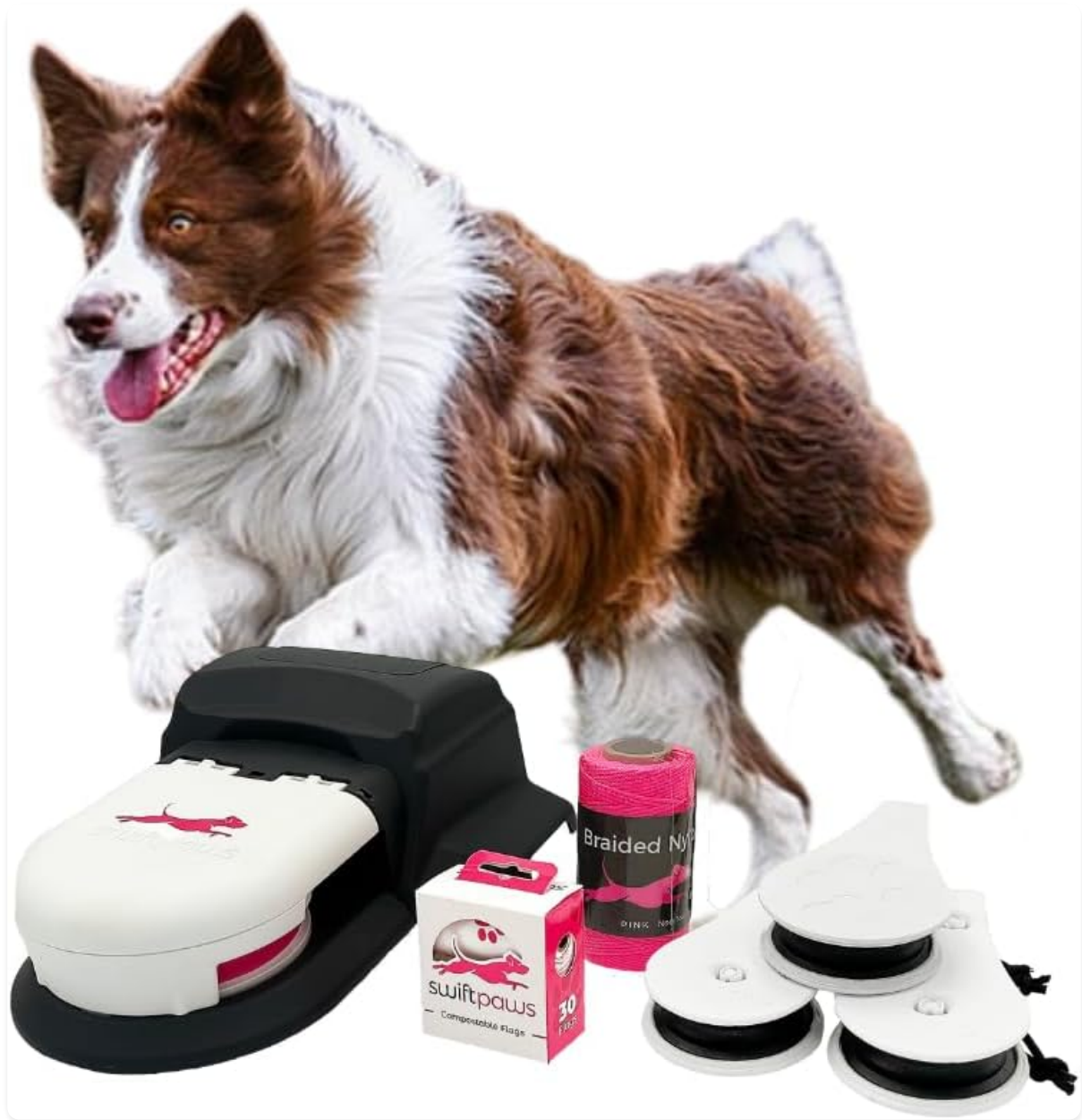
Image: The SwiftPaws Home Original system components, including the main unit, pulleys, line, and flags, with a dog actively chasing in the background. This illustrates the complete product and its intended use.