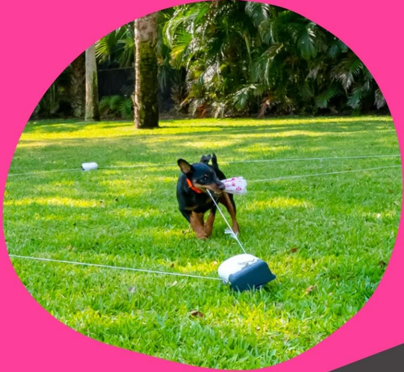
Image: Two SwiftPaws pulleys shown on green grass, highlighting their design and how they sit on the ground.