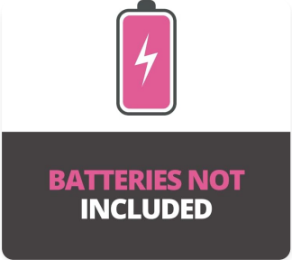
Image: A graphic clearly stating 'Batteries Not Included' with a battery symbol, emphasizing that a separate purchase is required.