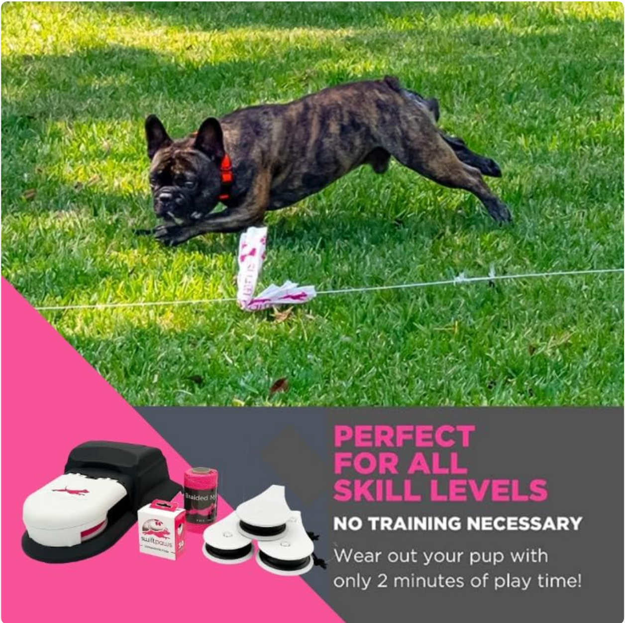
Image: A dog in mid-stride, focused on chasing the flag lure across a green lawn, demonstrating the toy's engaging nature.