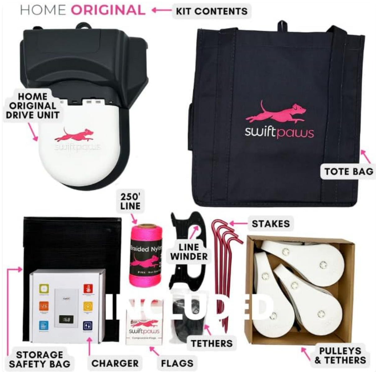
Image: A detailed layout of all components included in the SwiftPaws Home Original kit, such as the drive unit, pulleys, line, stakes, charger, flags, and tote bag.