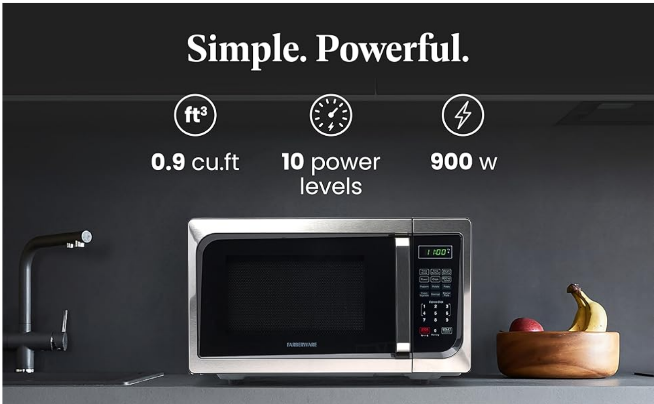
Image: The Farberware 0.9 cu ft 900-watt microwave oven, showcasing its compact design, 10 power levels, and 900 watts of power.