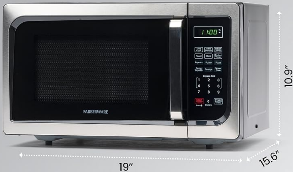
Image: A detailed view of the microwave's control panel, highlighting defrost options, six auto-cook presets, intuitive controls, one-touch start, and child safety lock.

compact size to make the most of your space