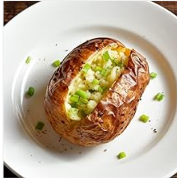
Image: A baked potato garnished with chives, demonstrating a common food item prepared using the one-touch potato setting.