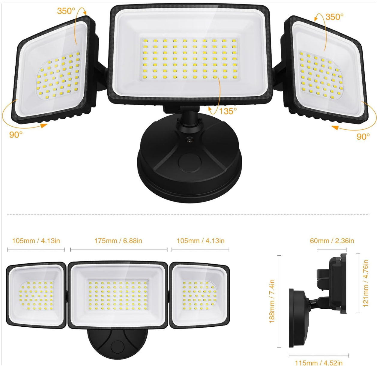
Figure 5: The three light heads offer extensive adjustability for wide area coverage.