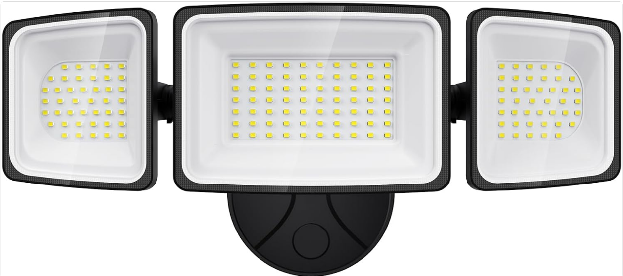
Figure 1: Onforu 100W Flood Light, showing the main light and two side lights.

The Onforu 100W Flood Light is a high-brightness LED exterior floodlight designed for outdoor security and illumination. Featuring three adjustable heads, it provides wide-angle lighting for various outdoor environments such as yards, garages, and eaves. This light is built with durable materials and an IP65 waterproof rating, ensuring reliable performance in diverse weather conditions.