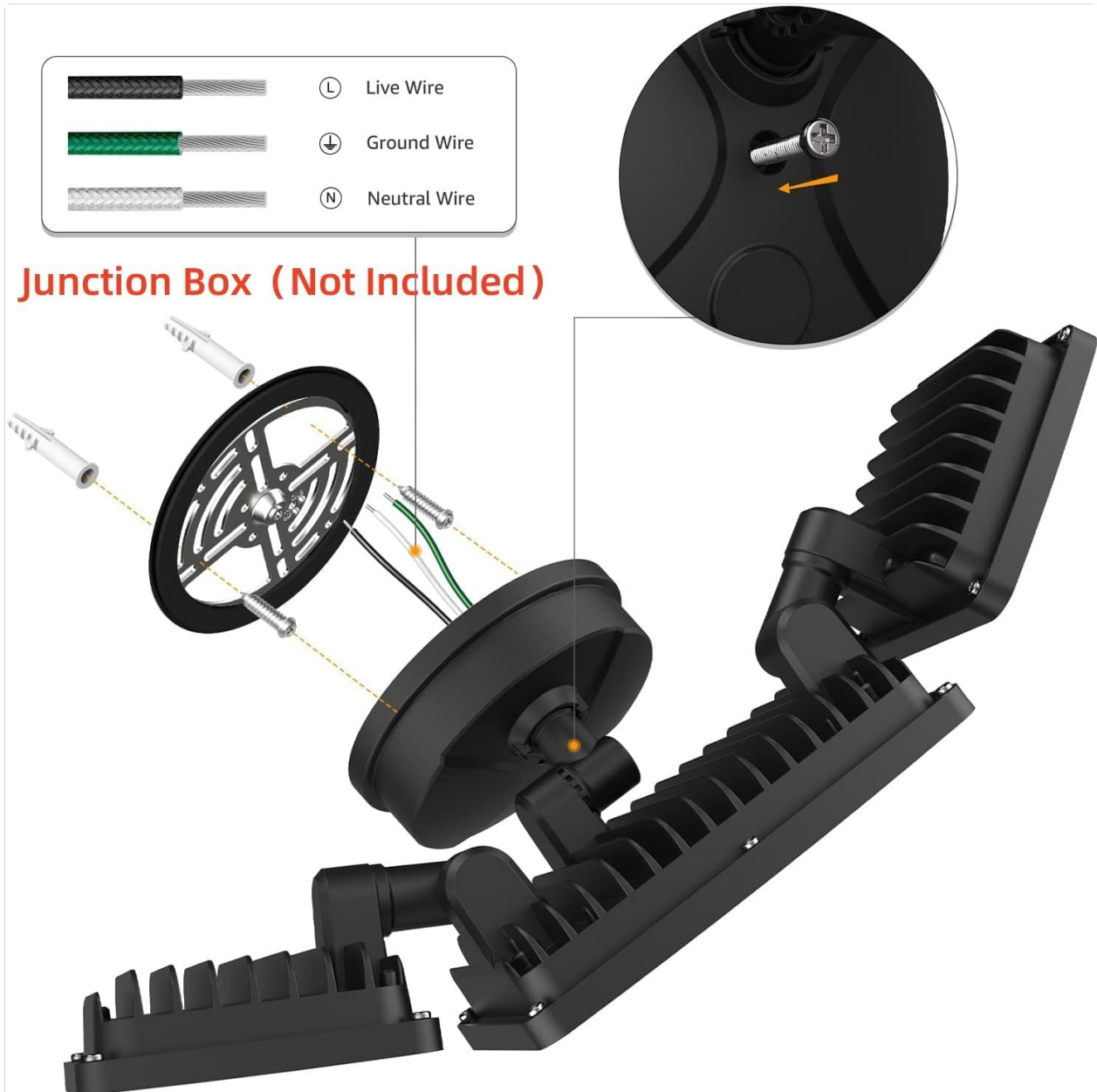
Figure 4: Wiring diagram for installation. Note: Junction Box is not included.