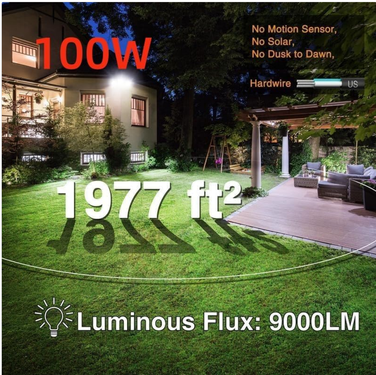
Figure 2: High brightness and wide coverage area of the flood light.