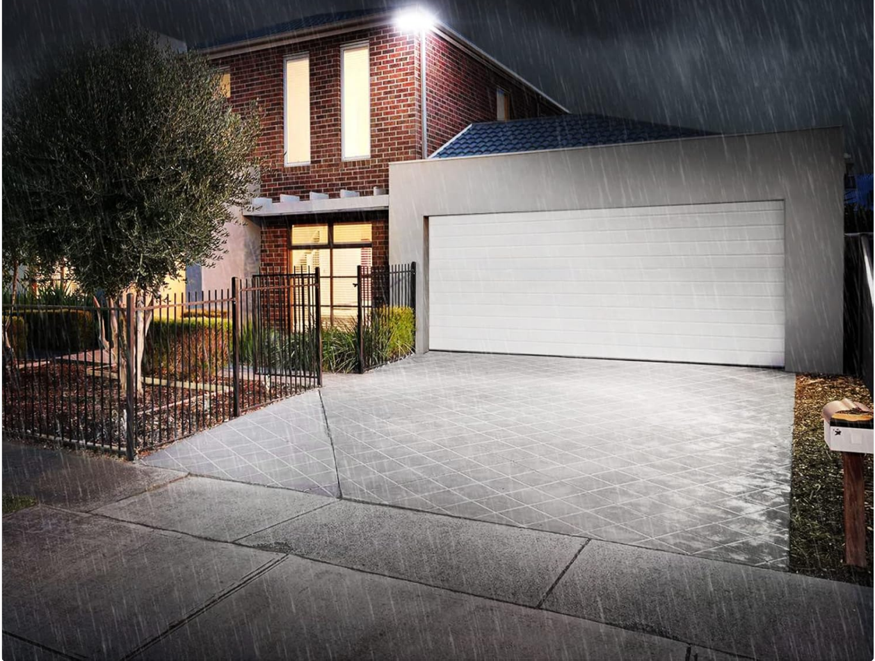
Figure 7: The IP65 waterproof design ensures durability in various weather conditions.