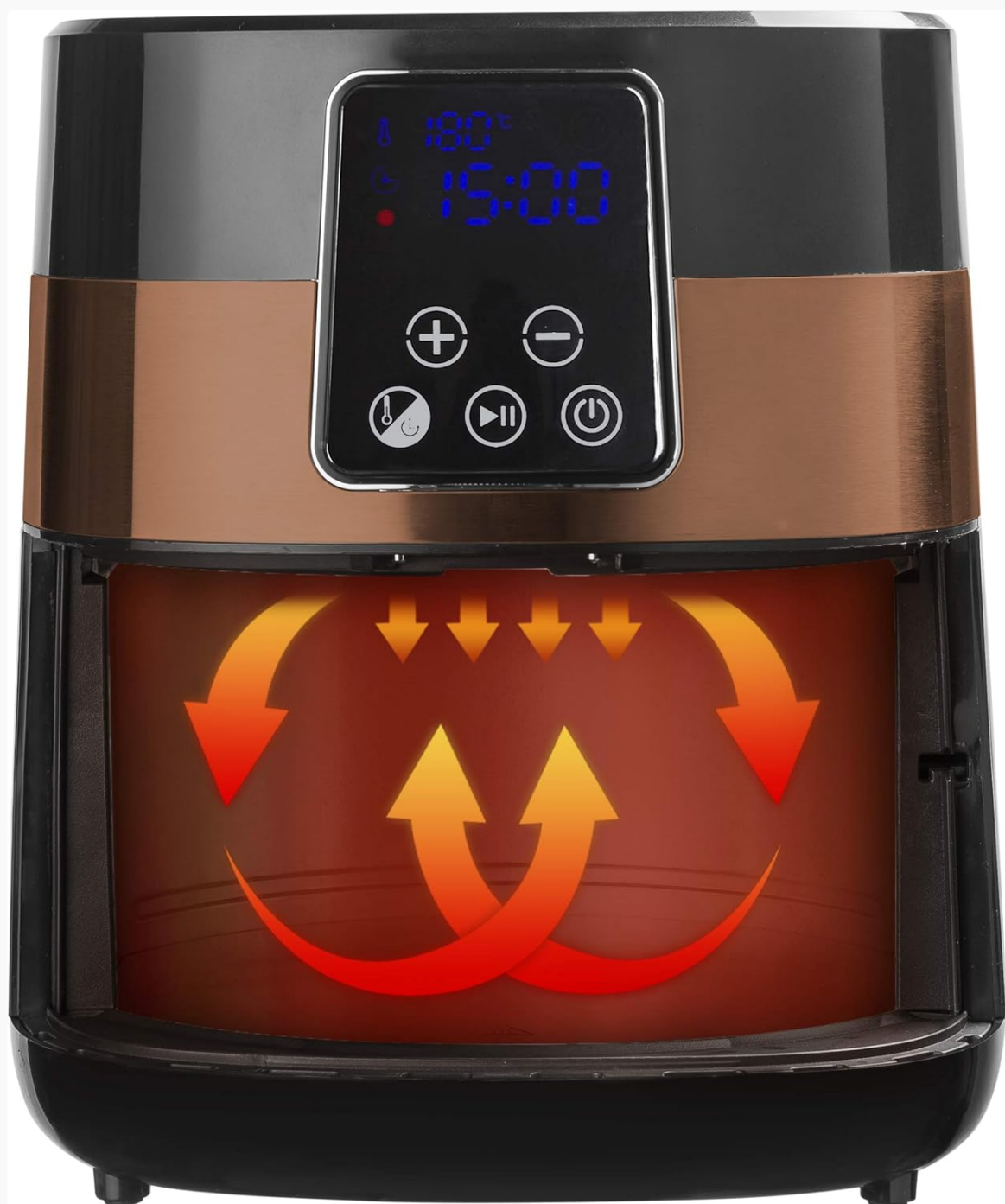
Figure 3: An internal view of the air fryer demonstrating the PrepAir technology with arrows indicating the rapid circulation of hot air for even cooking.