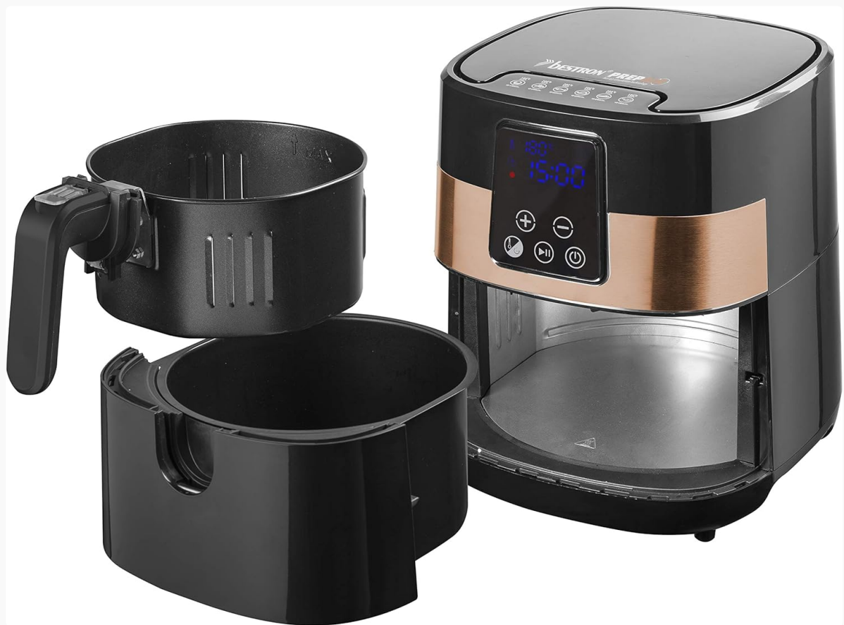
Figure 2: The main unit of the air fryer with the non-stick inner container and the frying basket detached, illustrating the removable components for easy cleaning.