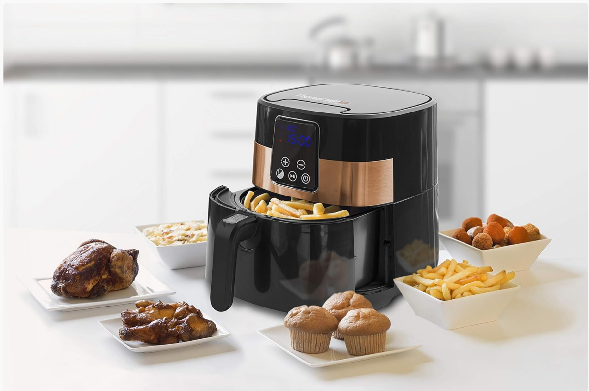
Figure 5: The air fryer on a kitchen counter surrounded by various dishes prepared using the appliance, including fries, chicken, and muffins, showcasing its versatility.