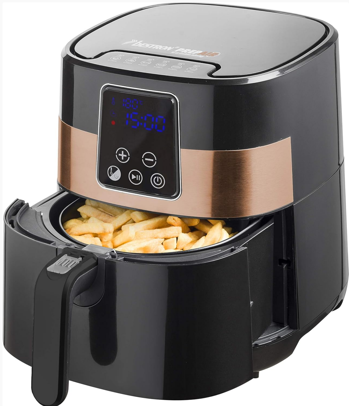
Figure 1: The Bestron Digital XXL Hot Air Fryer with its basket pulled out, showing crispy fries inside. The digital display shows temperature and time settings.

Familiarize yourself with the components of your Bestron Digital XXL Hot Air Fryer.