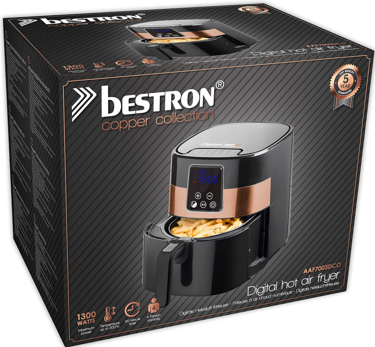
Figure 6: The product packaging box for the Bestron Digital XXL Hot Air Fryer, highlighting key features and the brand logo.