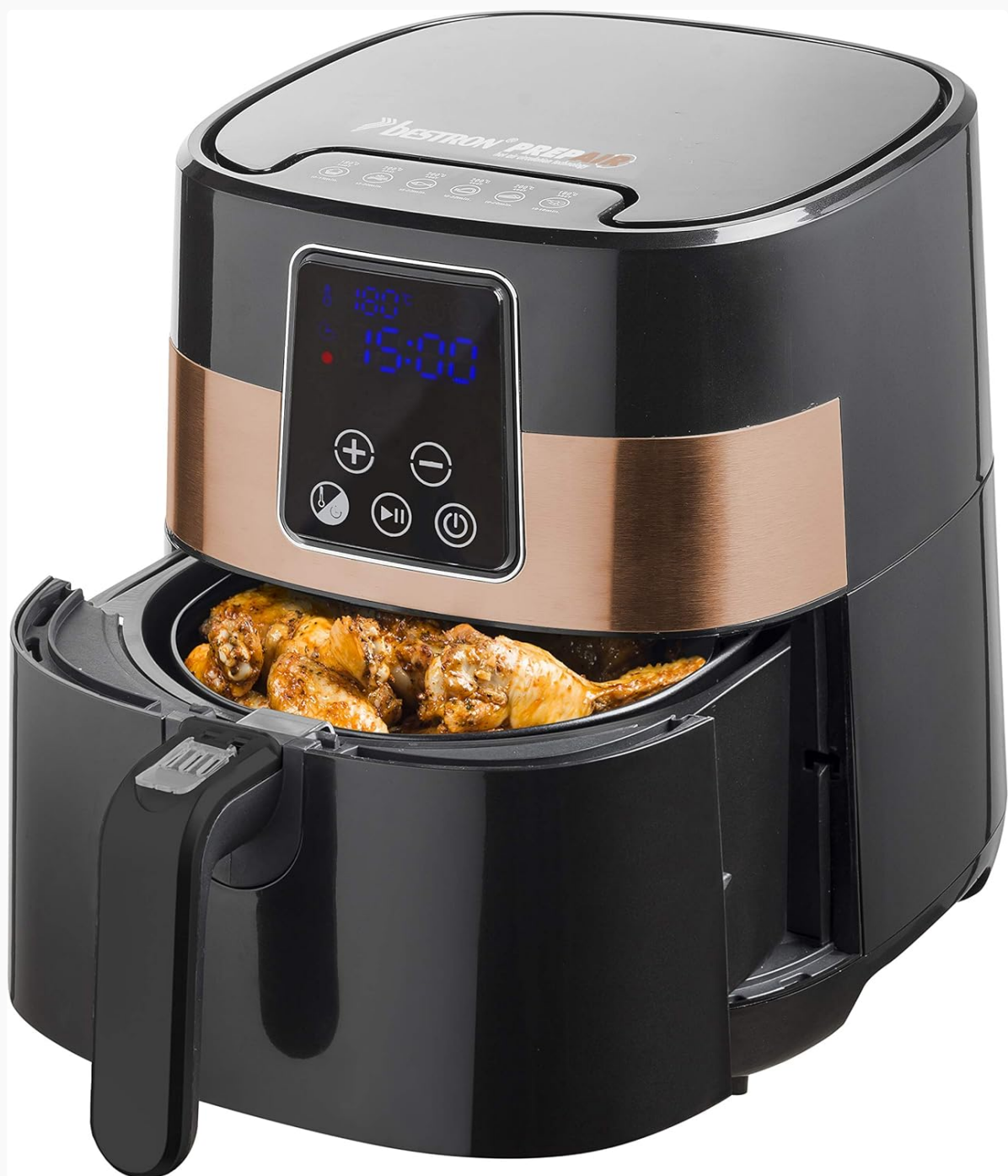
Figure 4: The air fryer in operation, with the basket pulled out to show chicken pieces being cooked. The digital display is active.