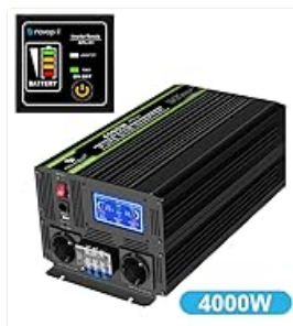
Image: The inverter features multi-protection against over-voltage, undervoltage, overload, over-current, over-temperature, and short circuits.