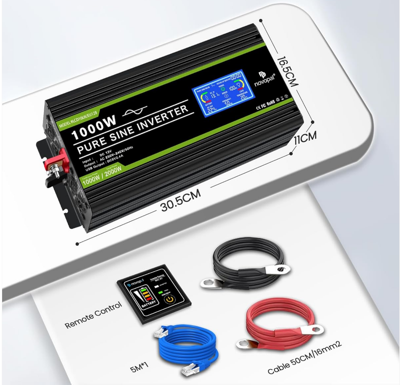
Image: NOVOPAL 1000W Pure Sine Wave Inverter with remote control, battery cables, and other accessories.