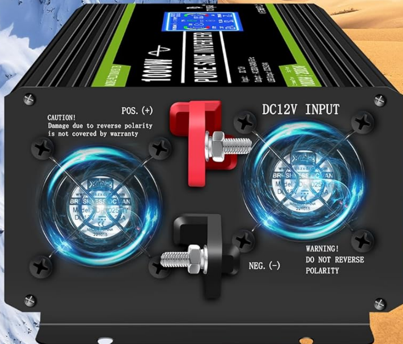
Image: The intelligent cooling fan operates based on internal temperature and inverter power, ensuring efficient heat dissipation.