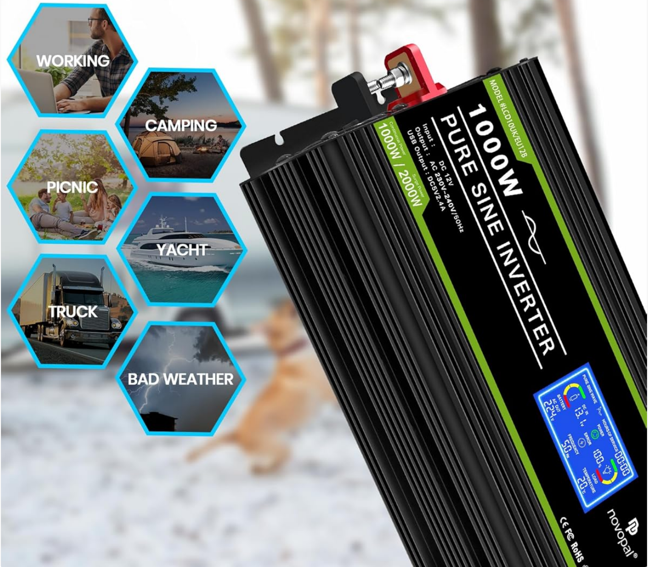
Image: The inverter is suitable for a wide range of applications including household appliances, power tools, and emergency equipment up to 1000 watts.

Household Appliances, Power Tools, Emergency Equipments, TV, etc up to 1000 watt