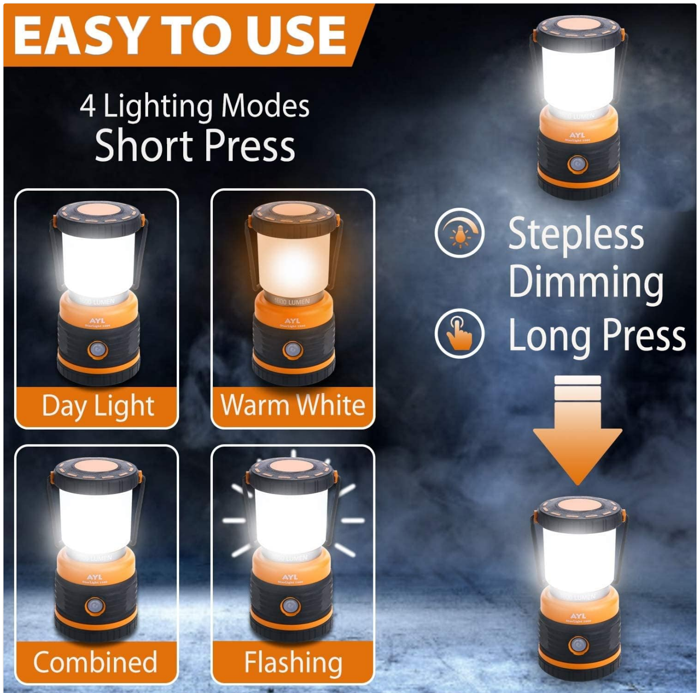
Image: Visual guide to light modes and dimming.