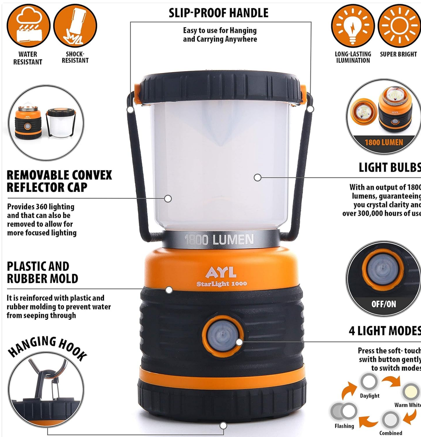
Image: Detailed view of the lantern's components and features.