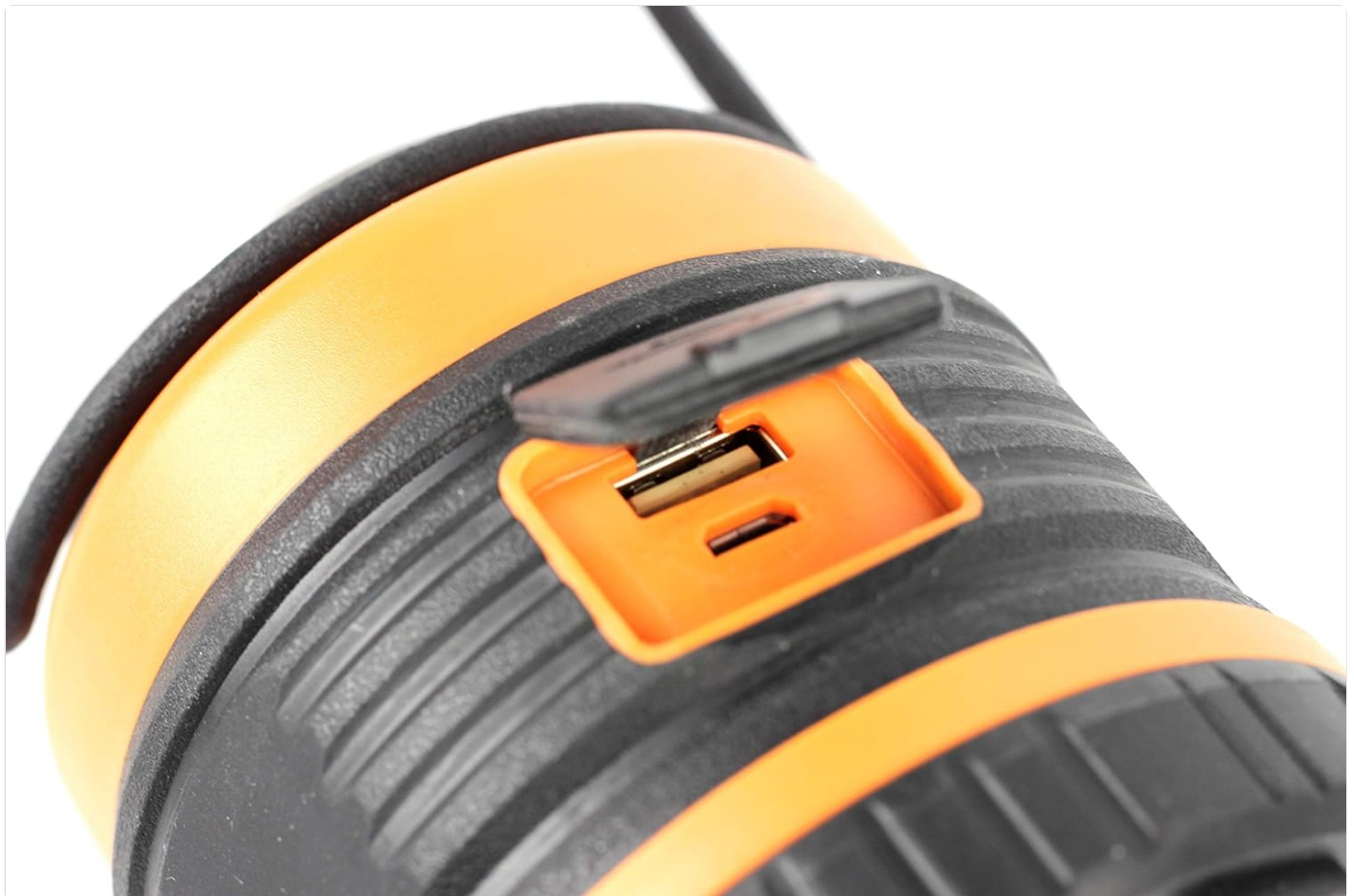
Image: Close-up of the USB charging ports.