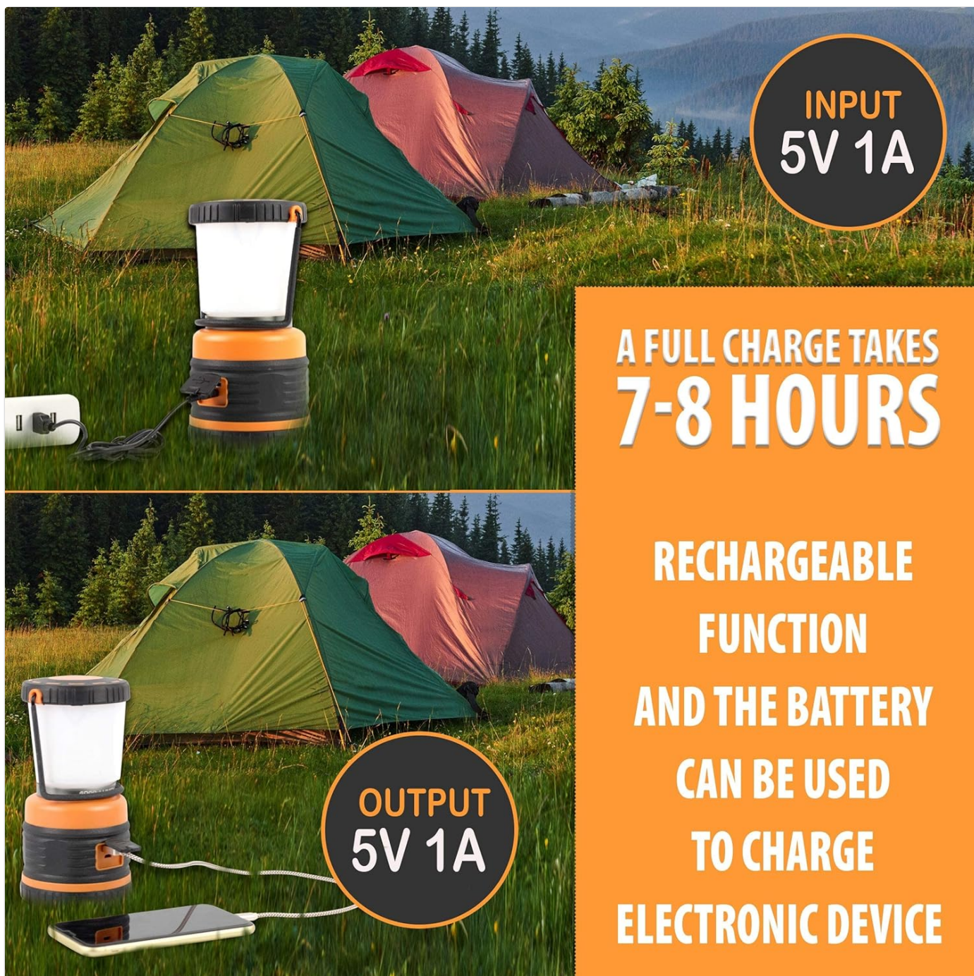
Image: Charging the lantern and using it to charge an electronic device.