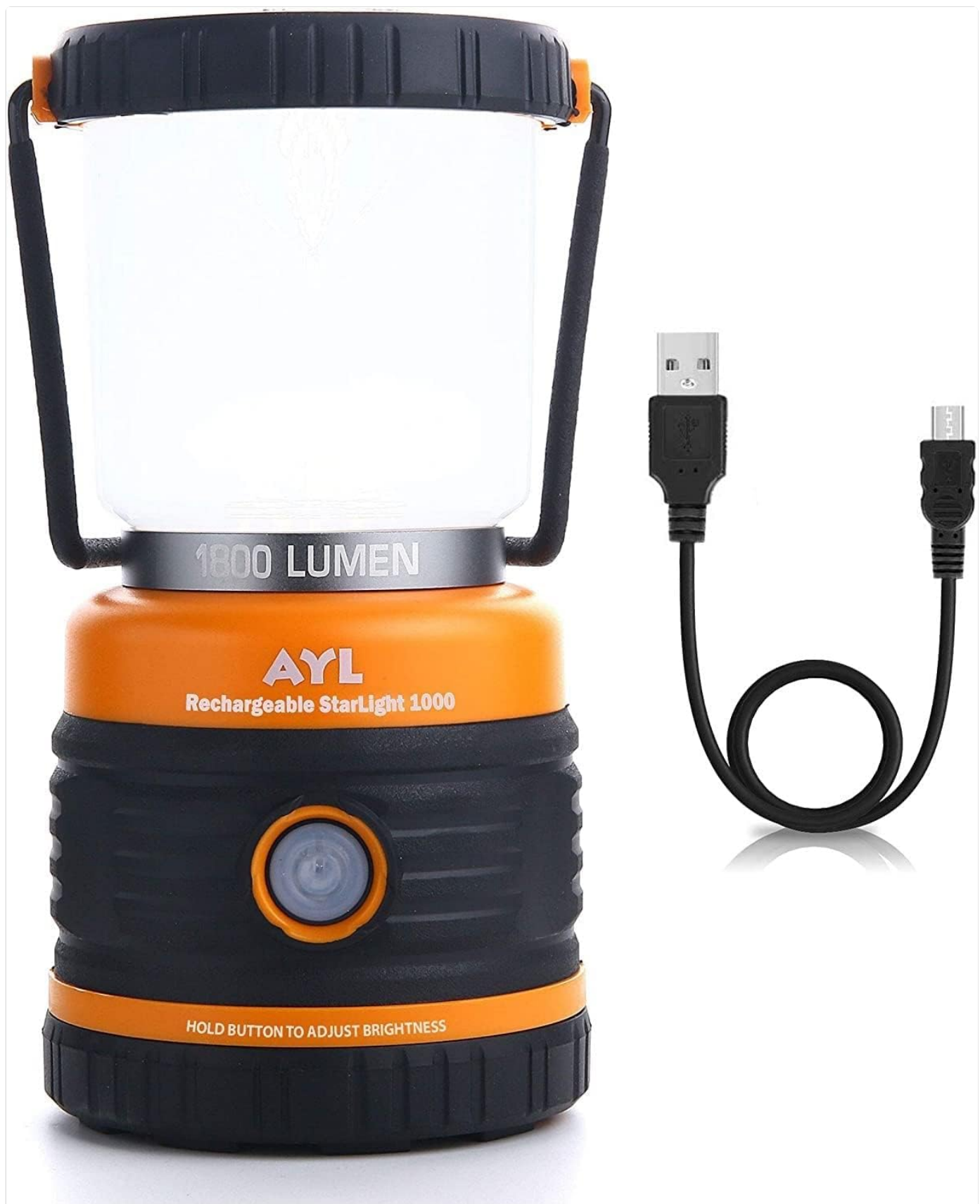
Image: The AYL LED Camping Lantern and its USB charging cable.