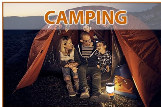
Image: Lantern dimensions and suggested uses.