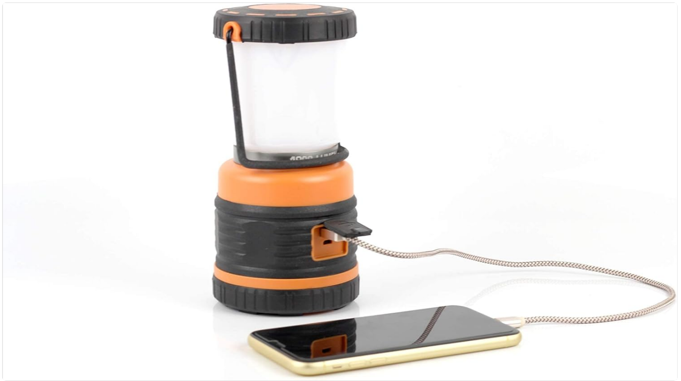
Image: The lantern functioning as a power bank to charge a smartphone.