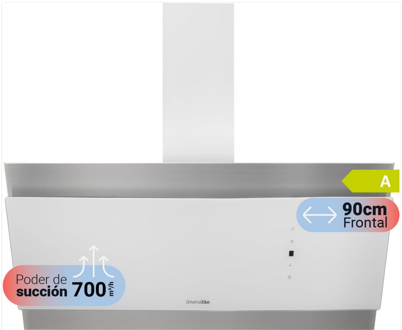
Image: Front view of the UNIVERSALBLUE 90 cm Inclined Glass Range Hood in white and stainless steel.