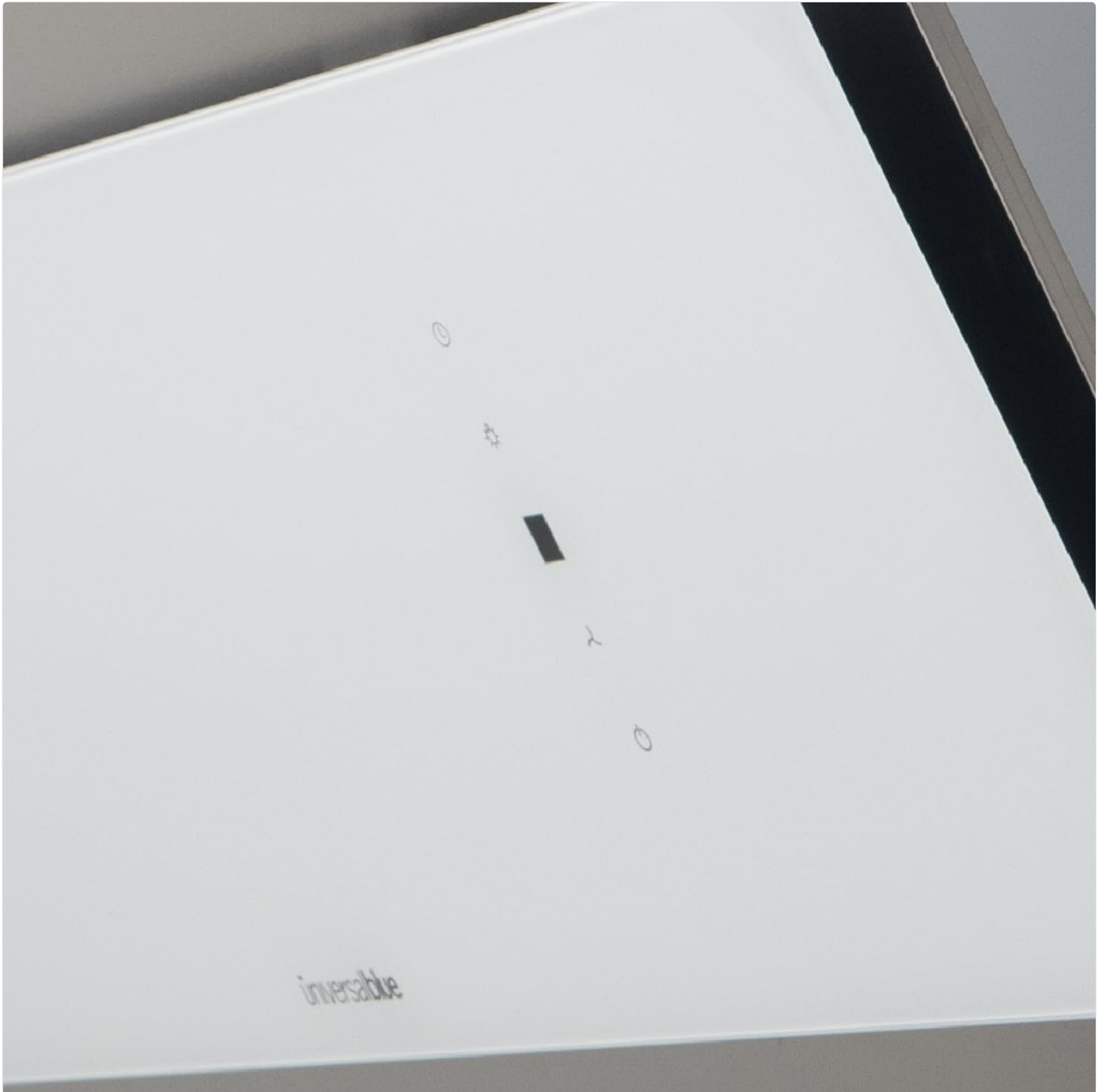
Image: Detailed view of the touch-sensitive control panel, showing icons for power, speed settings, and light.

Your UNIVERSALBLUE range hood features intuitive touch controls for easy operation.