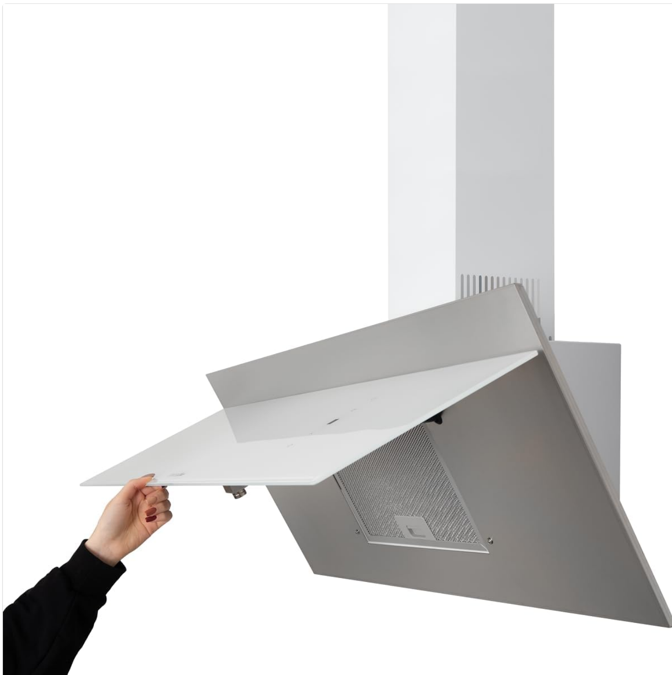
Image: A hand demonstrating how to open the inclined glass panel to reveal the aluminum grease filters inside the hood.