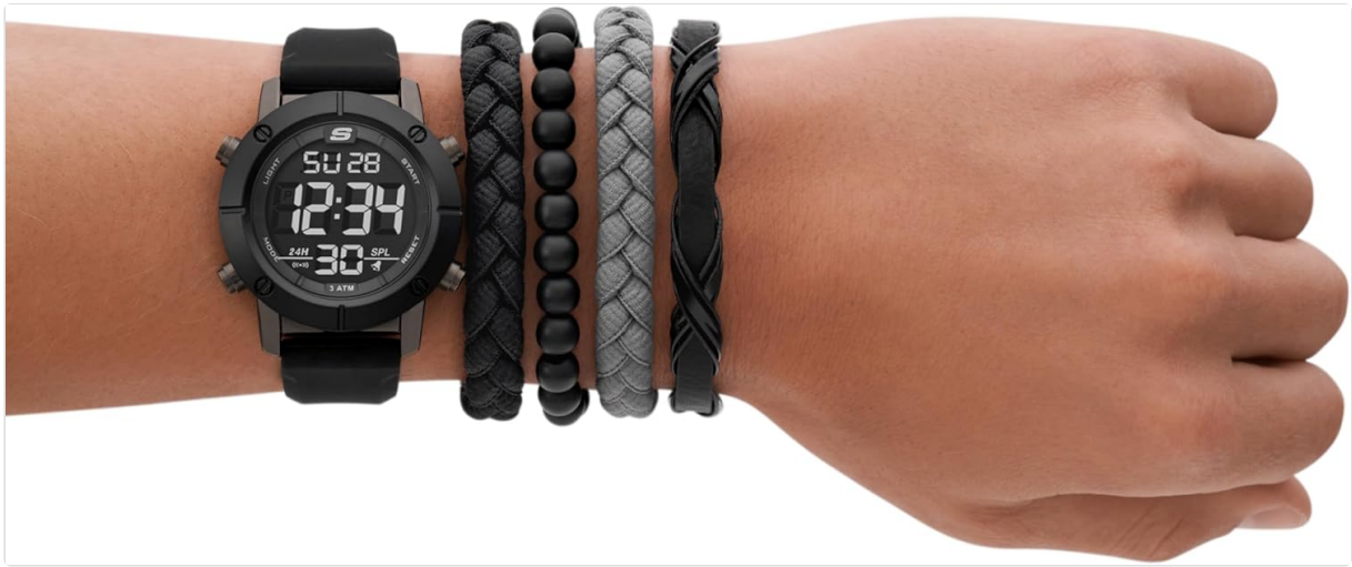
Image: Front view of the Skechers digital watch face, showing the time display and the "LIGHT", "MODE", "START", and "RESET" buttons on the sides of the case.