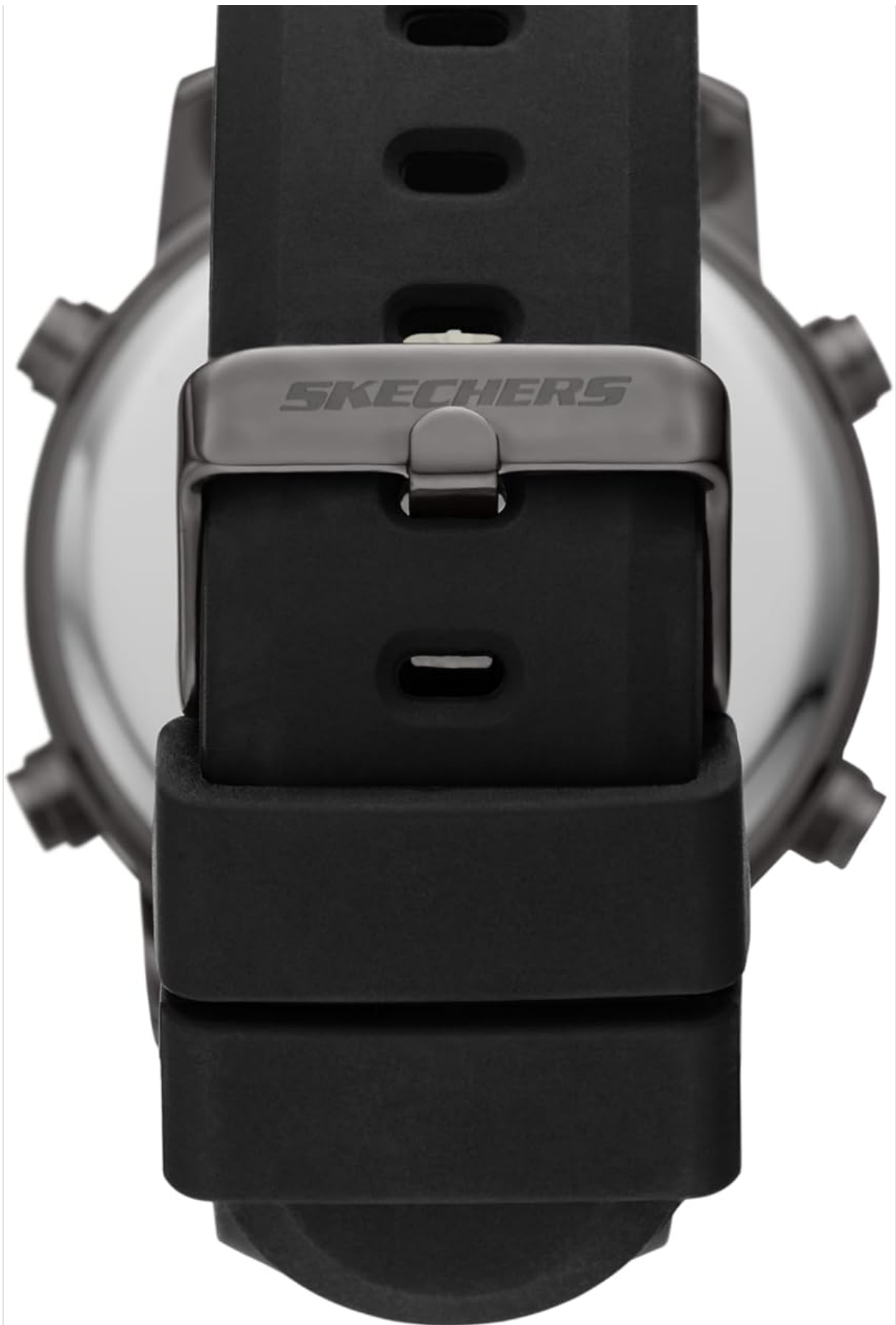
Image: Side view of the Skechers digital watch, highlighting the watch case, buttons, and the silicone band.