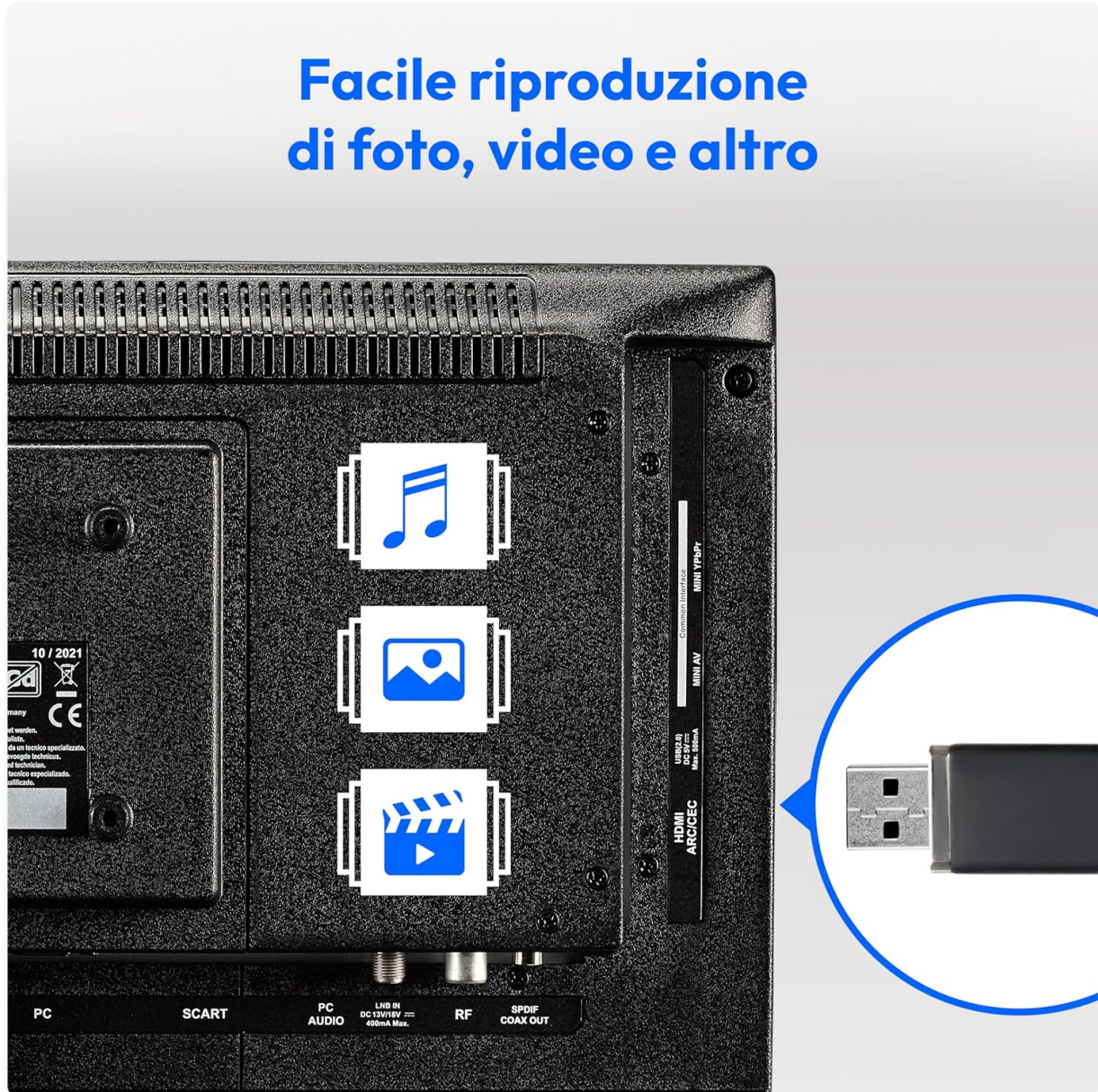
Figure 4: Easy playback of photos, videos, and more. This image highlights the USB port on the TV's side and icons representing music, photos, and video files, indicating the TV's multimedia playback capabilities.