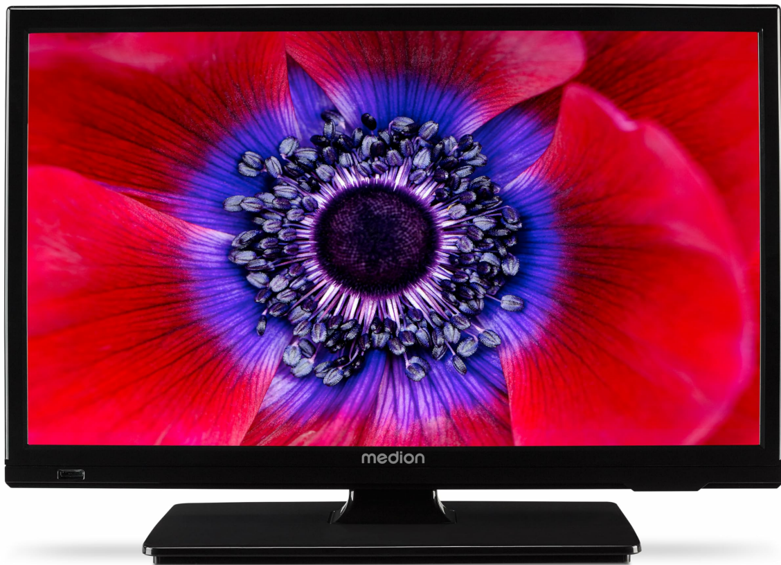
Figure 1: MEDION E11909 19-inch HD TV. This image shows the front view of the television, highlighting its compact design suitable for various environments.