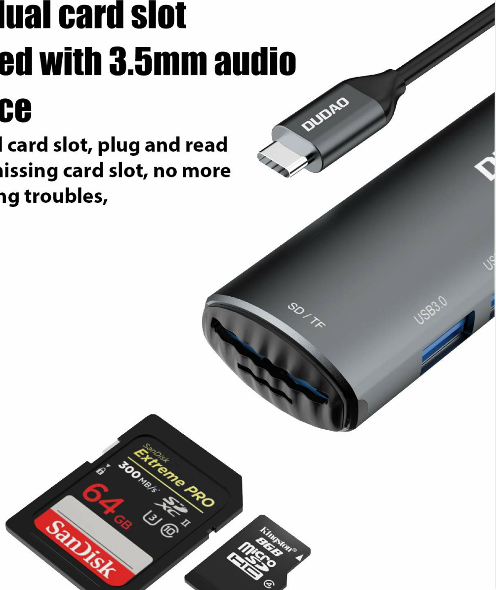
Image 5.4: Close-up of the DUDAO hub's SD and TF card slots, shown with memory cards inserted for data access.

TF/SD dual card slot, plug and read No more missing card slot, no more card reading troubles,