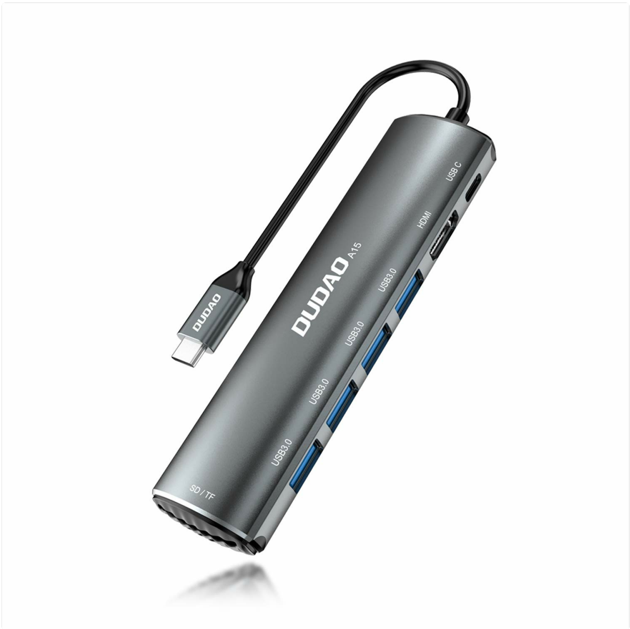
Image 1.1: Overview of the DUDAO 8-in-1 Type C Hub, Model A15 Pro, showcasing its compact design and various ports.