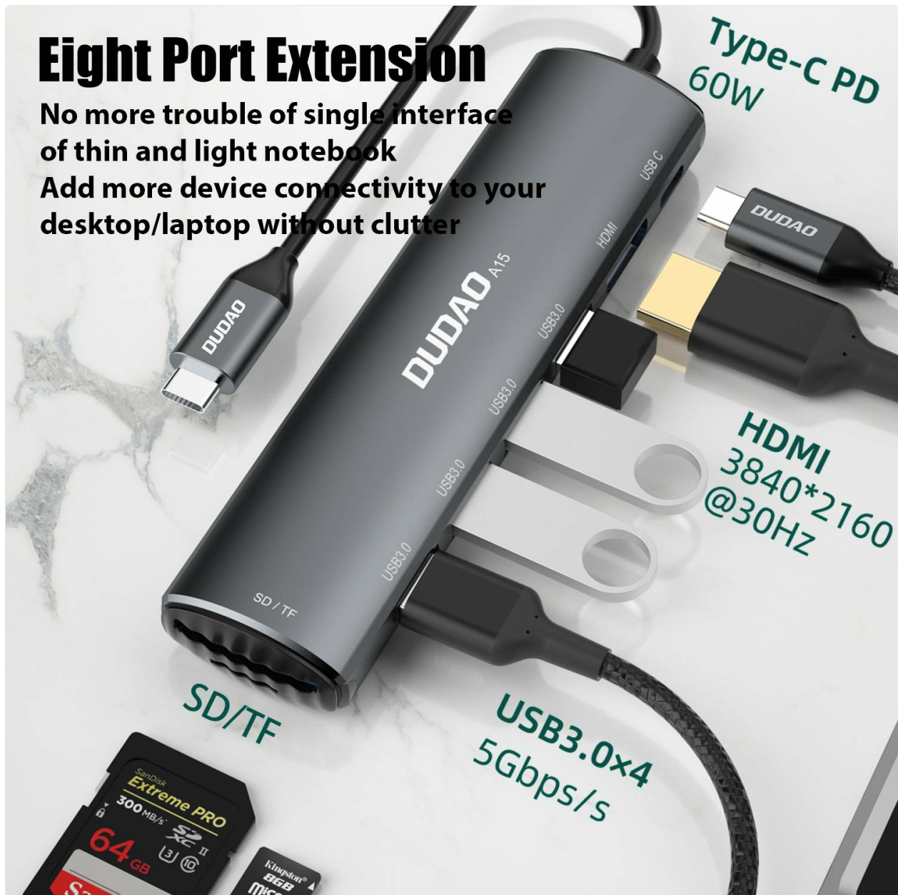
Image 4.1: The DUDAO 8-in-1 Type C Hub connected to a laptop with various peripherals such as USB drives and an HDMI cable.