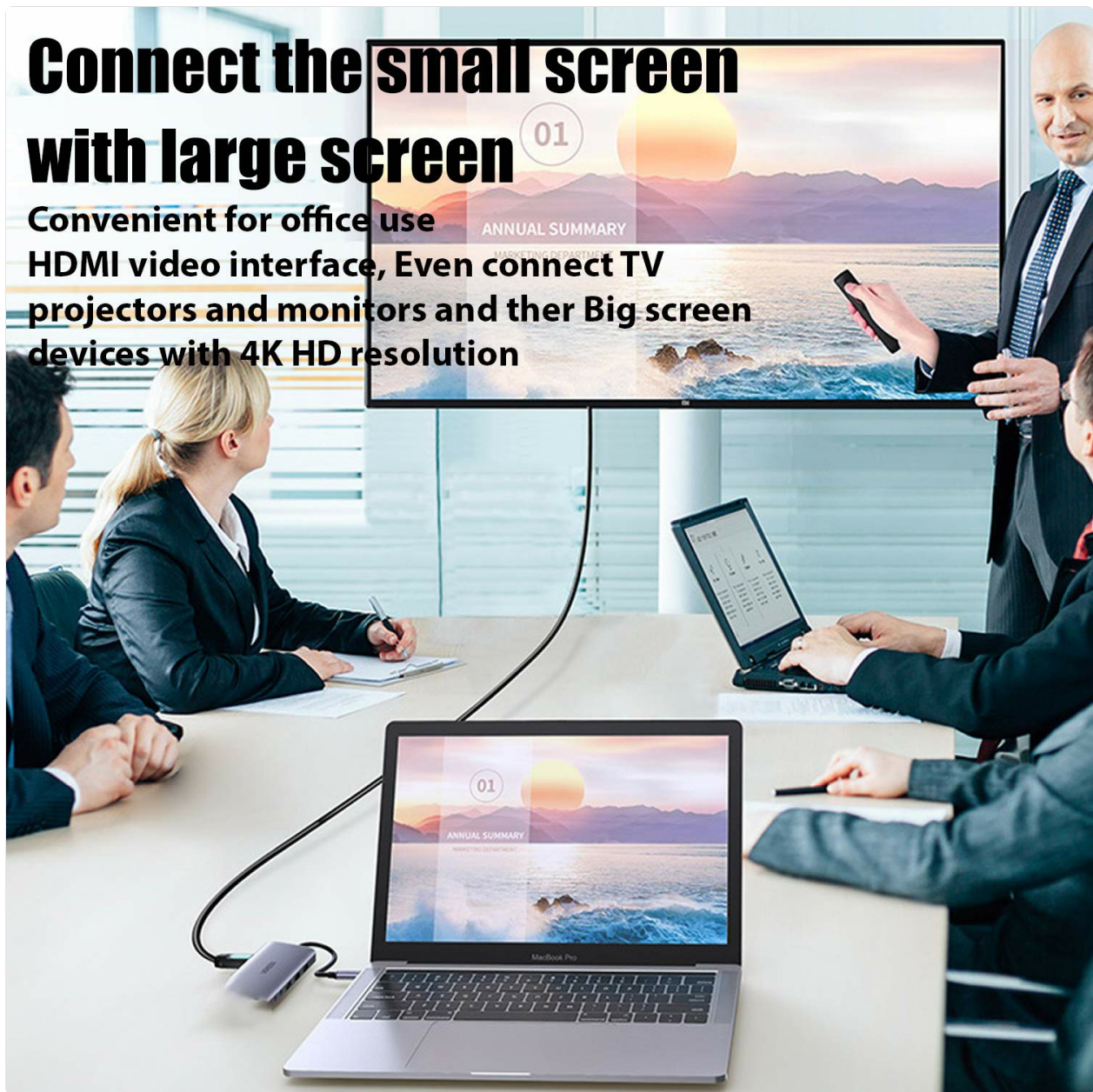
Image 5.2: A laptop connected to a large external display through the DUDAO hub's HDMI port, suitable for presentations or extended workspaces.