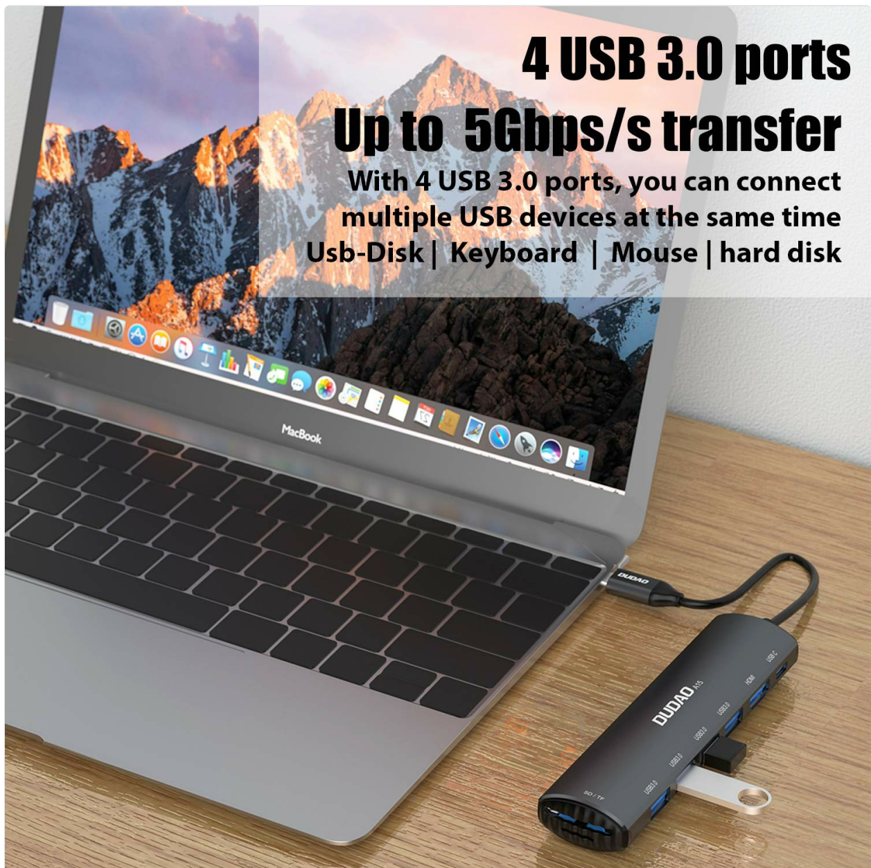
Image 5.1: A laptop connected to the DUDAO hub, demonstrating the use of USB 3.0 ports for connecting multiple USB devices.