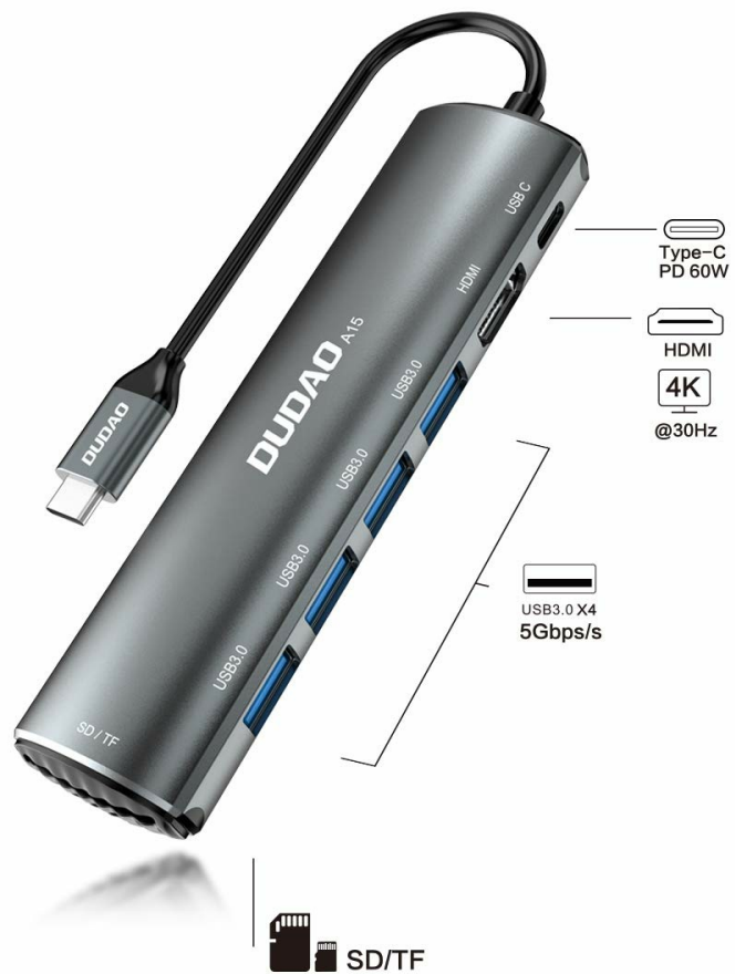
Image 2.1: Detailed view of the DUDAO 8-in-1 Type C Hub, highlighting its various ports including Type-C PD, HDMI, USB 3.0, and SD/TF card slots.