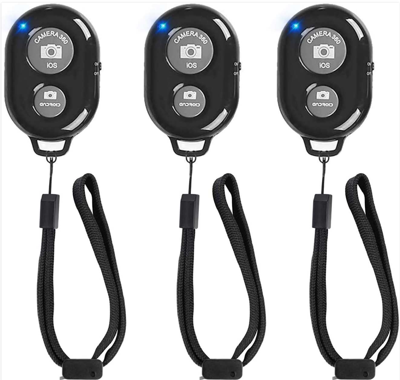
Image: Three black wireless remote shutters, each equipped with a wrist strap, as included in the package.