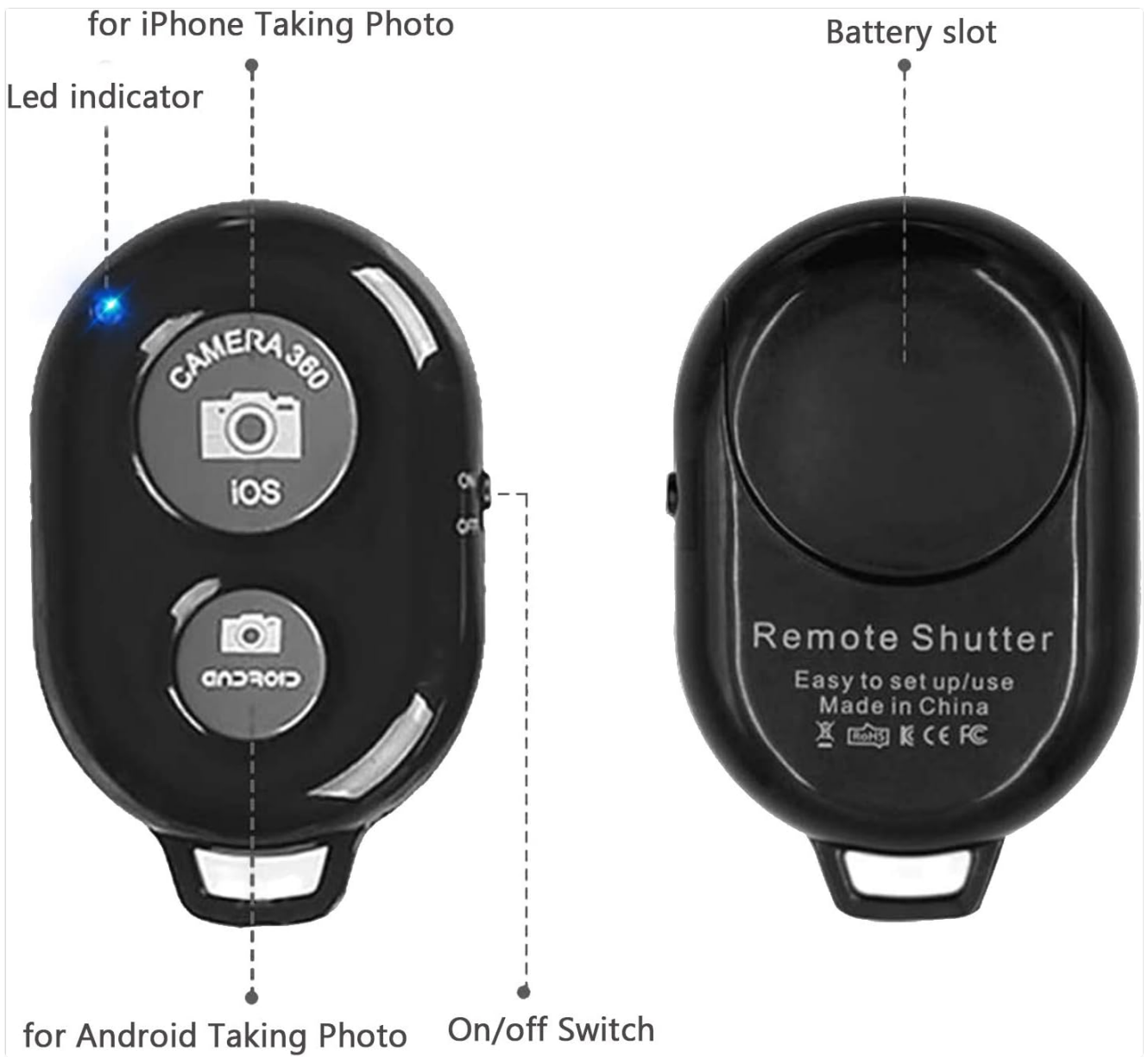
Image: Detailed diagram of the remote shutter, highlighting the LED indicator, iOS button, Android button, On/off switch, and battery slot.