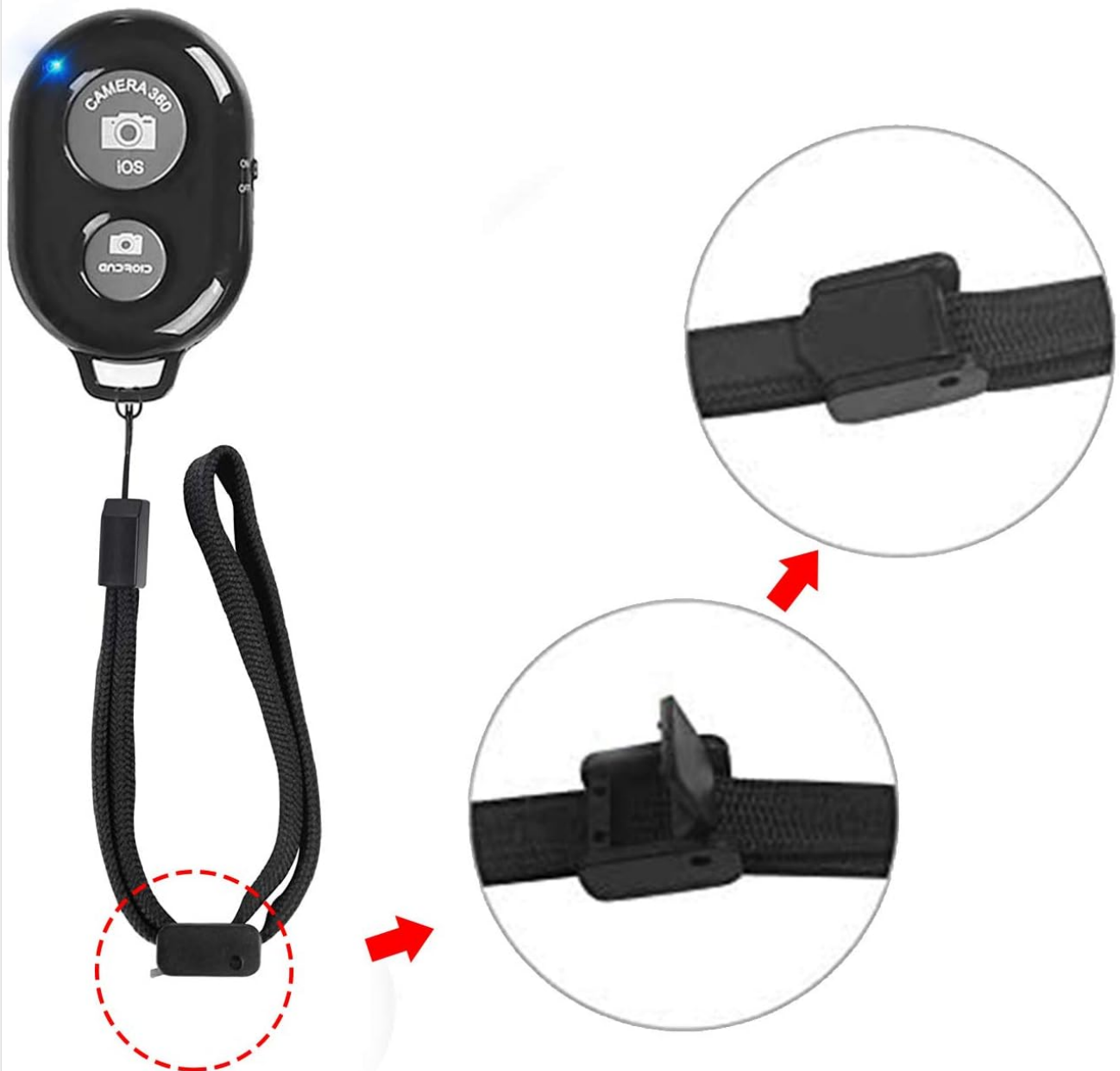
Image: Step-by-step visual guide demonstrating the correct method for attaching the wrist strap to the remote shutter.