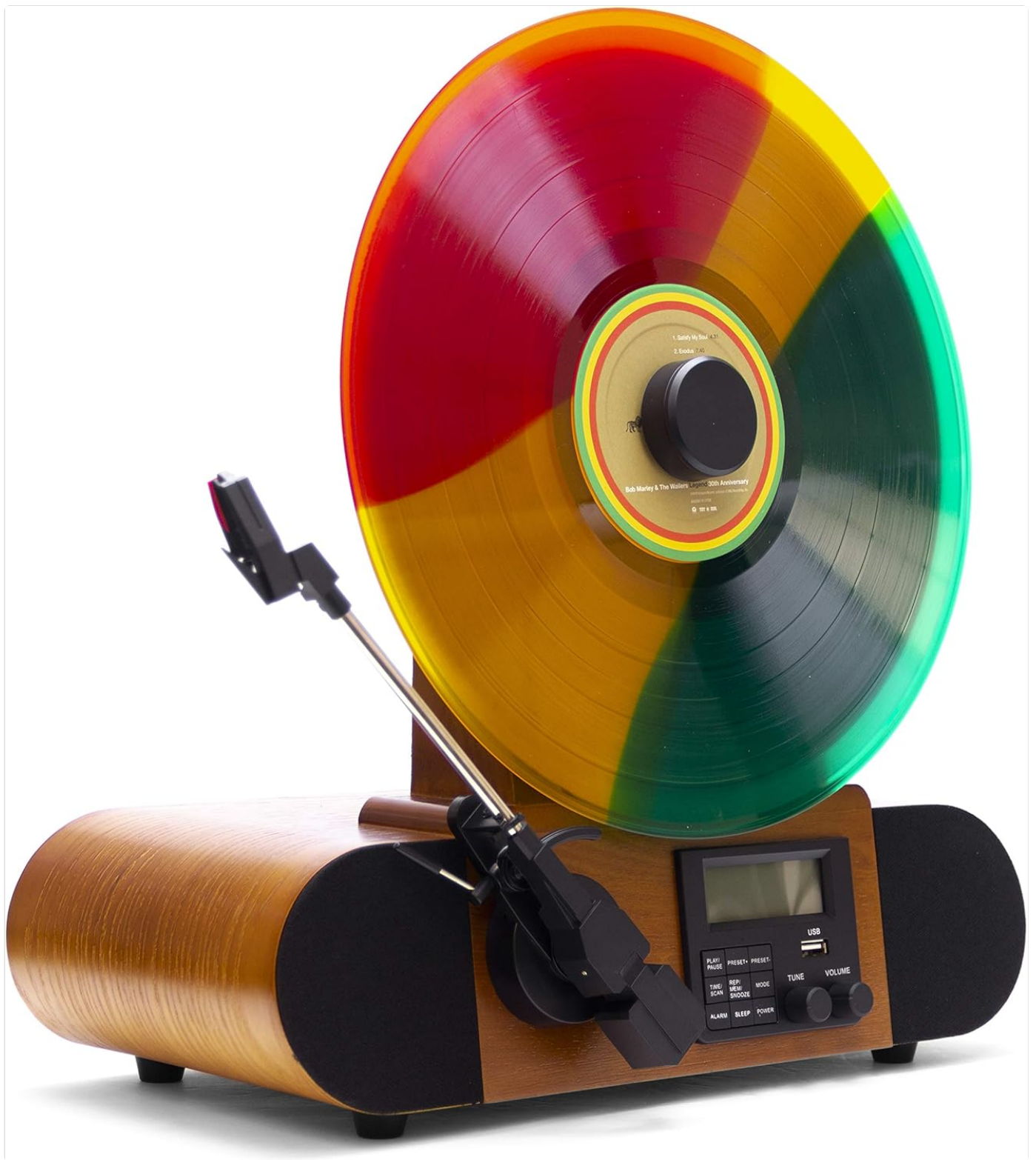
Figure 1: Front view of the Fuse Vert Vertical Vinyl Record Player with a record in place.