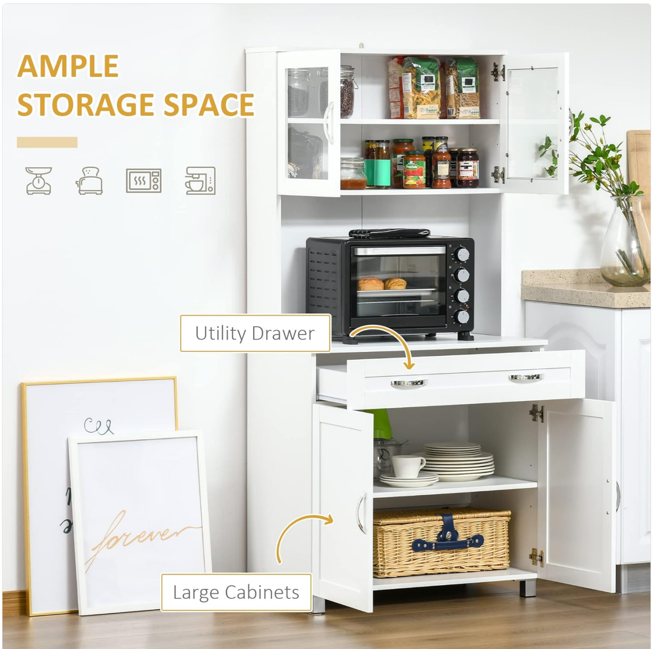
Figure 4.3.1: Ample Storage Space. This image highlights the various storage options, including the countertop for appliances like a microwave, a pull-out utility drawer, and large lower cabinets.