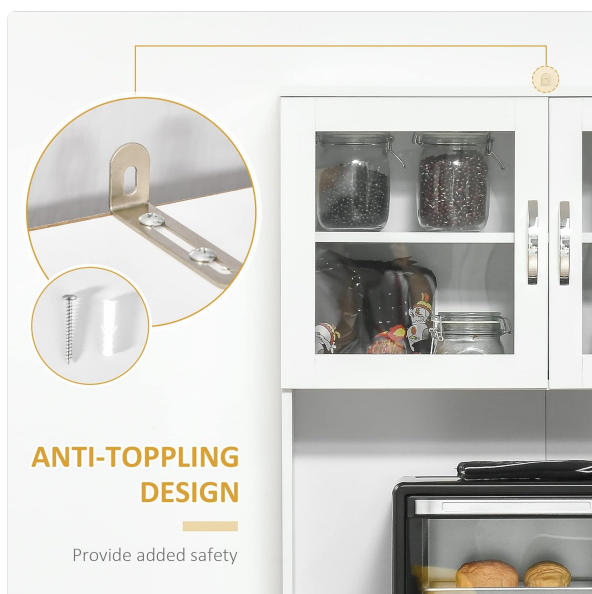
Figure 4.2.4: Anti-Toppling Design. For safety, attach the provided anti-tipping kit to the back of the cabinet and secure it to a wall stud. This prevents accidental tipping, especially in households with children or pets.