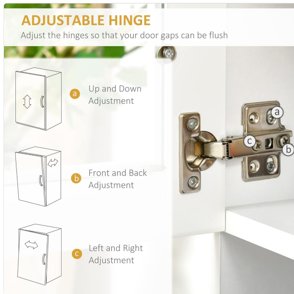
Figure 4.2.3: Adjustable Hinges. The door hinges are adjustable to ensure proper alignment and flush closure. Use a screwdriver to make minor adjustments for up/down, front/back, and left/right positioning.

adjustable shelves, allowing you to customize storage space for items of various sizes. Adjust the shelf height by repositioning the shelf pins.