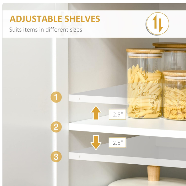
Figure 4.2.2: Adjustable Shelves. The cabinet features