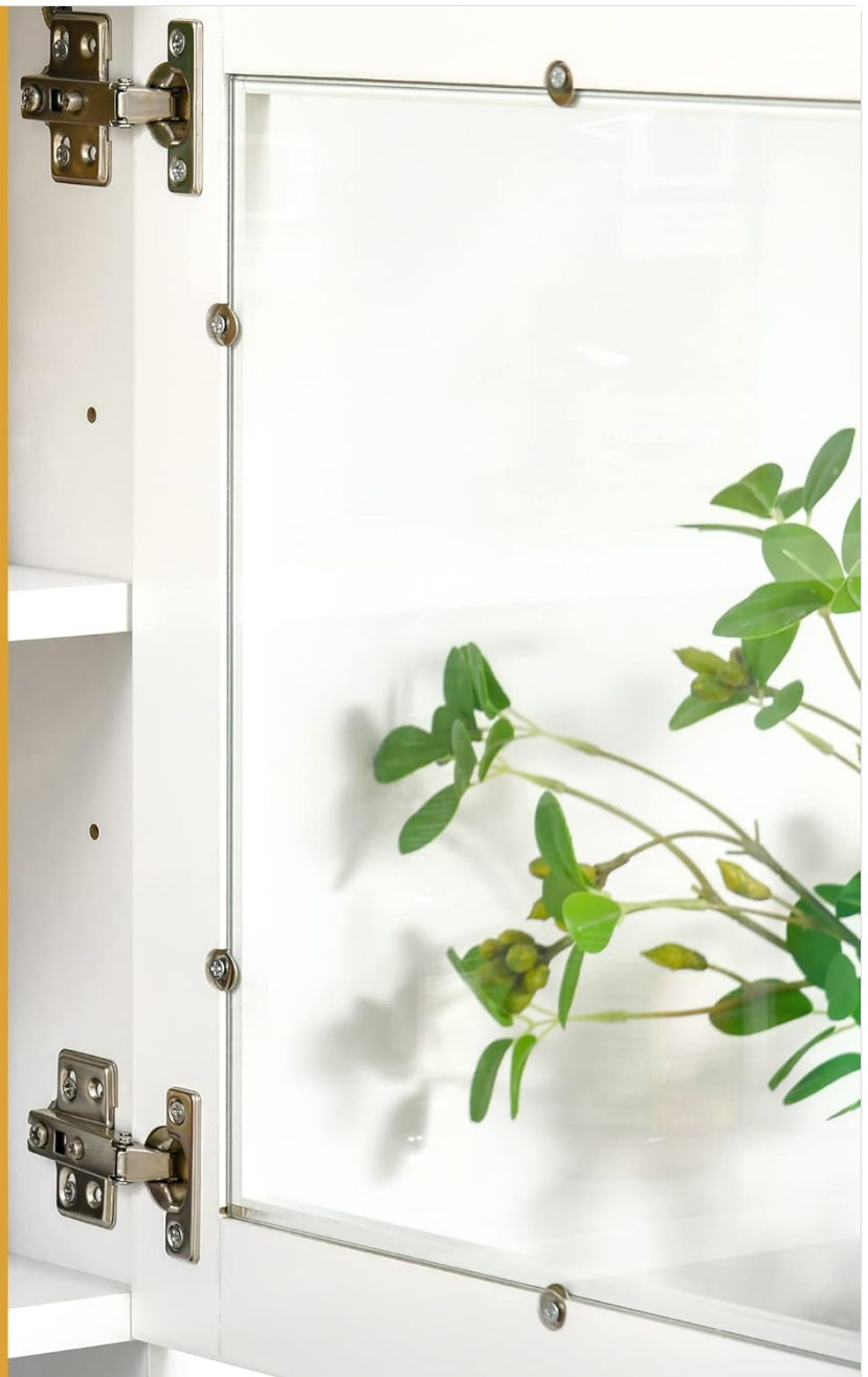
Figure 4.3.2: Framed Glass Doors. The upper section features framed glass doors, ideal for displaying decorative items while keeping them dust-free.