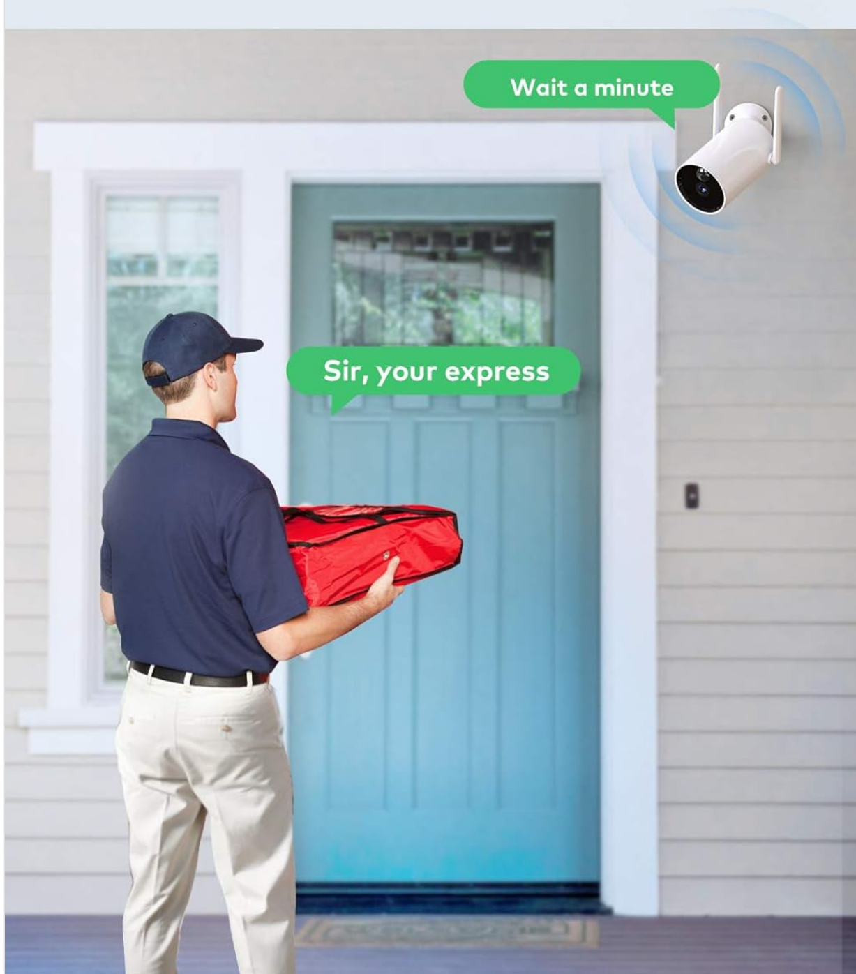
Figure 4.3: An image depicting a person at a door, with a speech bubble indicating communication through the camera's two-way audio feature.

With the built-in speaker and mic you can talk to everybody