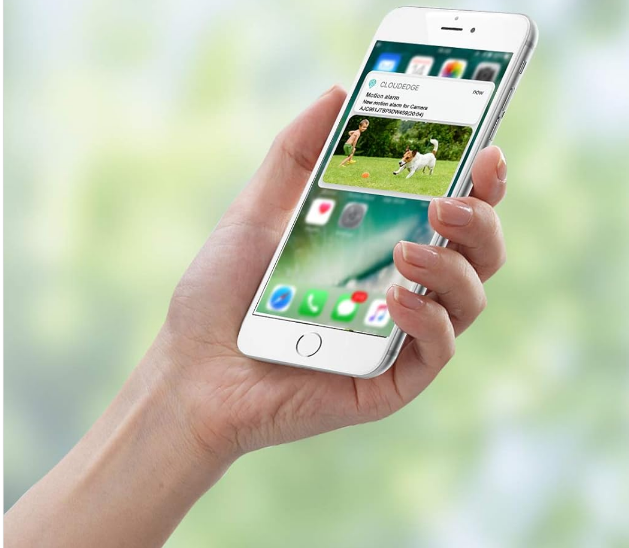
Figure 4.2: A smartphone screen displaying a 'Motion alarm' notification from the CloudEdge app, indicating that the camera has detected activity.