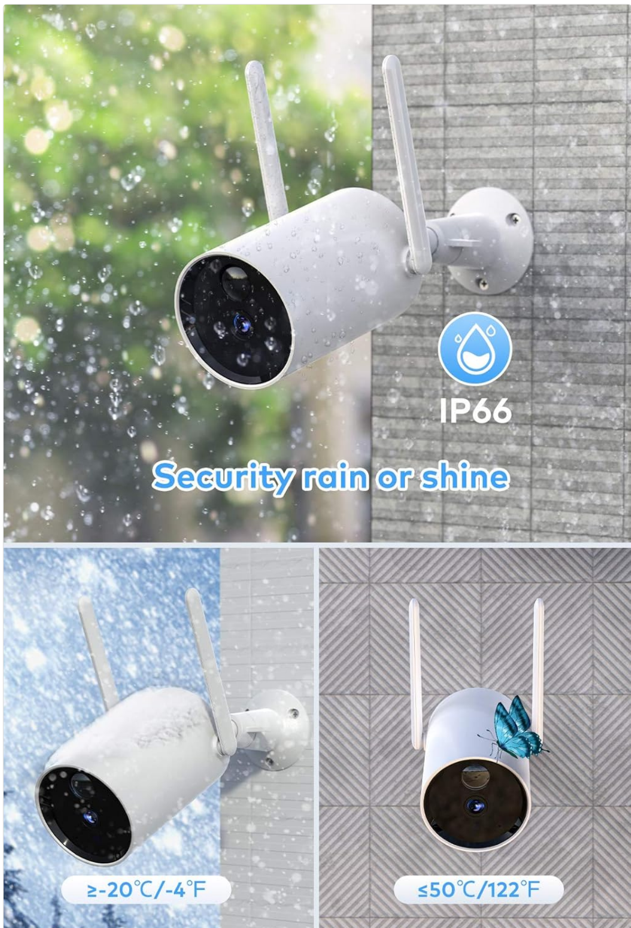
Figure 3.2: The Mibao P650 camera shown enduring rain, snow, and heat, illustrating its IP66 weatherproof rating and ability to operate in temperatures from -20°C to 50°C.

Choose a suitable location for mounting, considering the camera's field of view and Wi-Fi signal strength. The camera is IP66 weatherproof, making it suitable for outdoor use in various conditions.