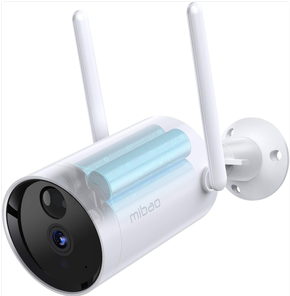
Figure 2.1: Mibao P650 Wireless Security Camera. This image shows the overall design of the camera, highlighting its dual antennas and an internal view of the integrated batteries.

The camera unit includes the main camera body, dual antennas, a lens, infrared LEDs, a PIR sensor, a microphone, and a speaker. The internal battery is rechargeable.