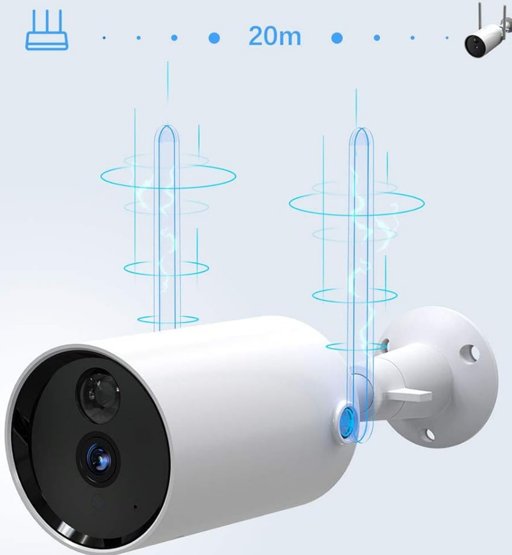
Figure 3.1: Illustration demonstrating the enhanced signal range and stability provided by the Mibao P650's dual 5dBi antennas, allowing for longer transmission distances.

Wide and more stable signal longer transmission distance