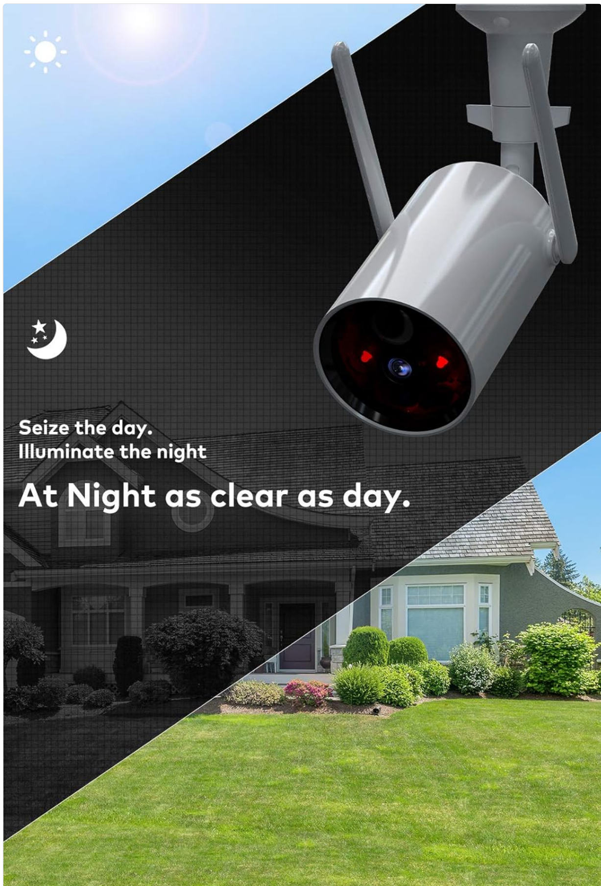
Figure 4.4: A split image showing a daytime view of a house and a nighttime view, demonstrating the camera's ability to provide clear visibility even in complete darkness using infrared night vision.