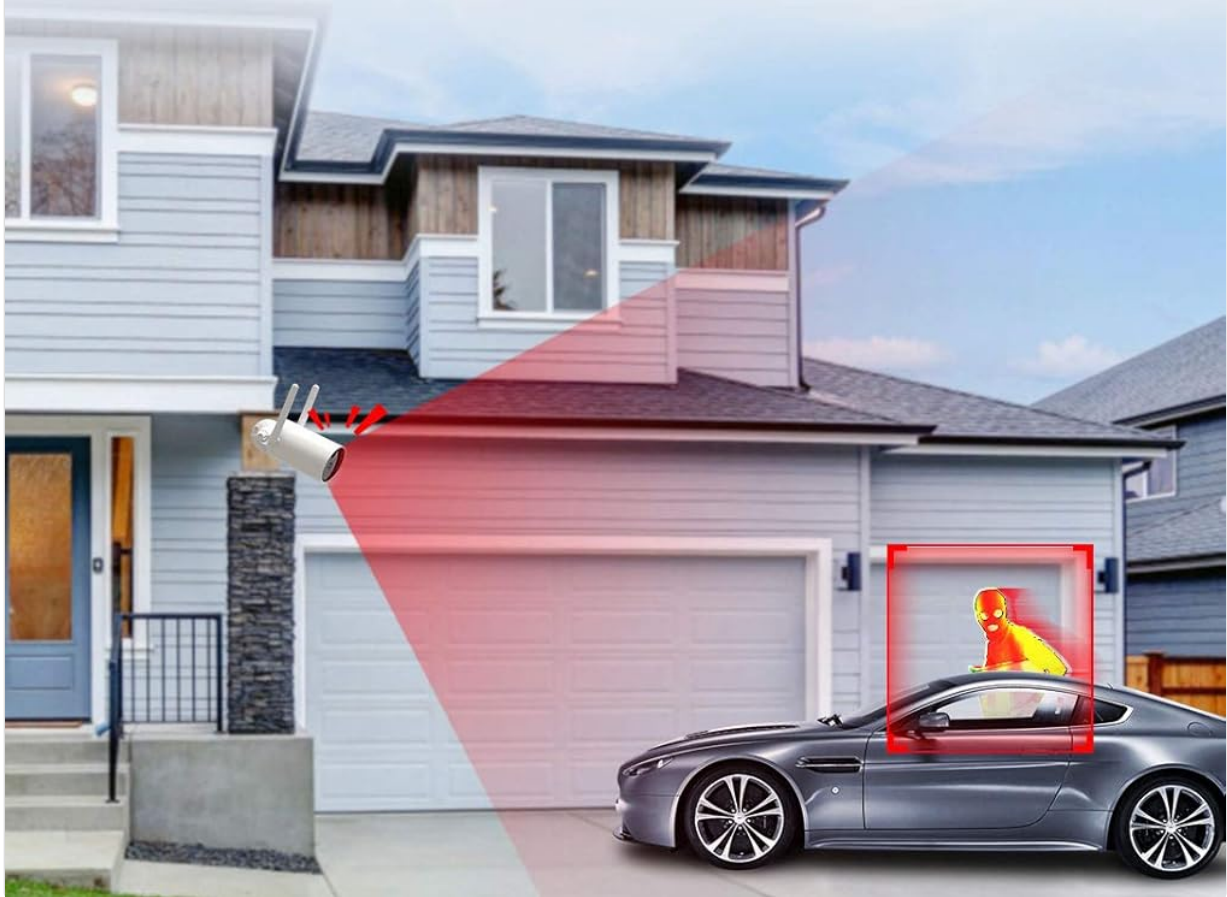
Figure 4.1: Diagram illustrating the PIR Human Motion Detection feature, showing how the camera identifies human heat sources to trigger alarms, extending battery life and reducing invalid alerts.