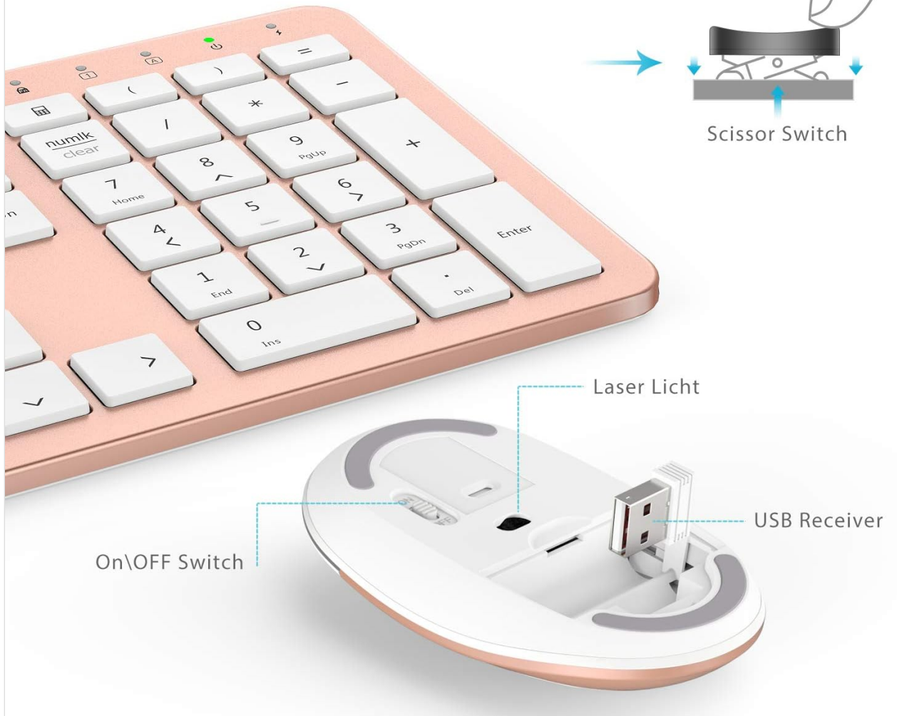
Image: A close-up view of the iClever mouse, highlighting the compartment where the USB nano receiver is stored for convenience.

Remarkably tactile for a comfortable and silent typing experience