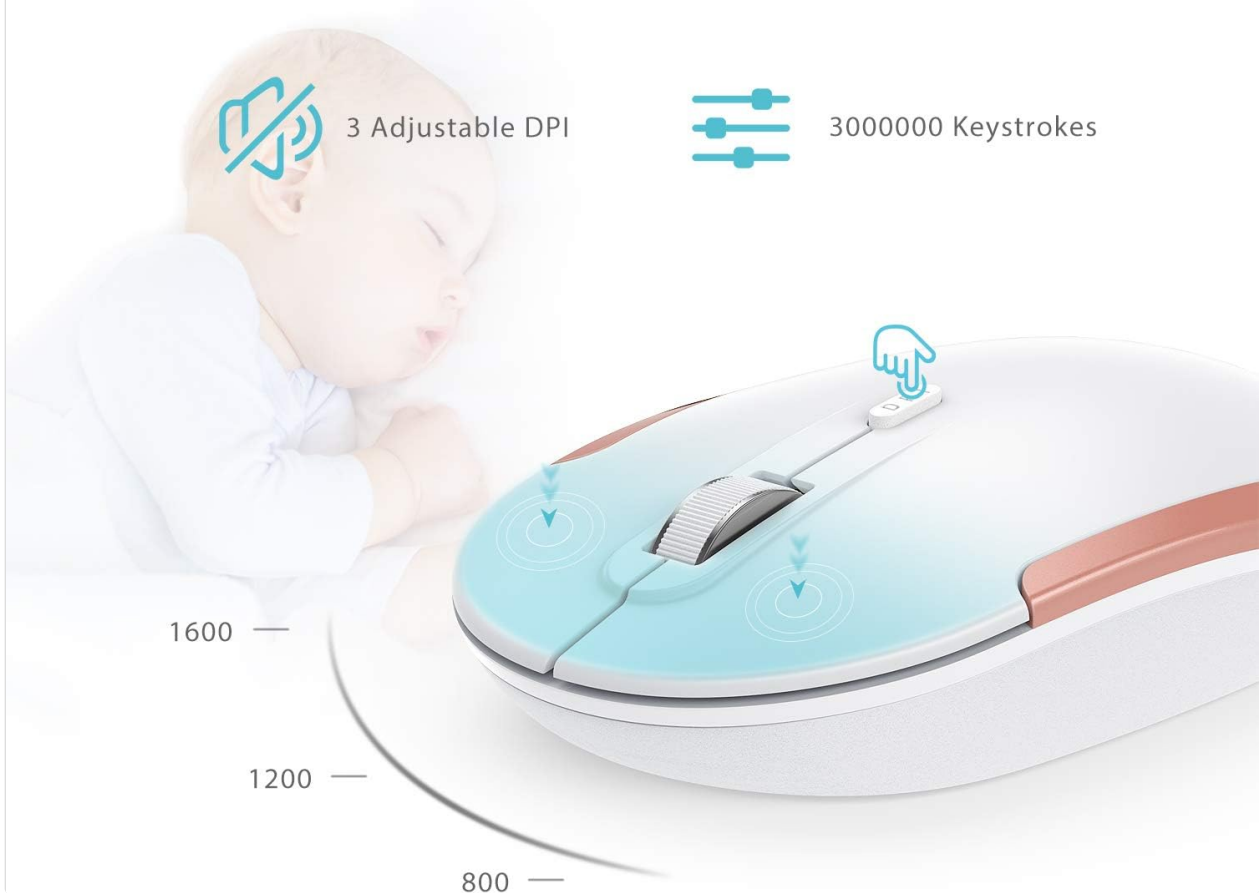
Image: A visual demonstrating the quiet operation of the iClever mouse and the three adjustable DPI settings (800, 1200, 1600) for varied precision needs.