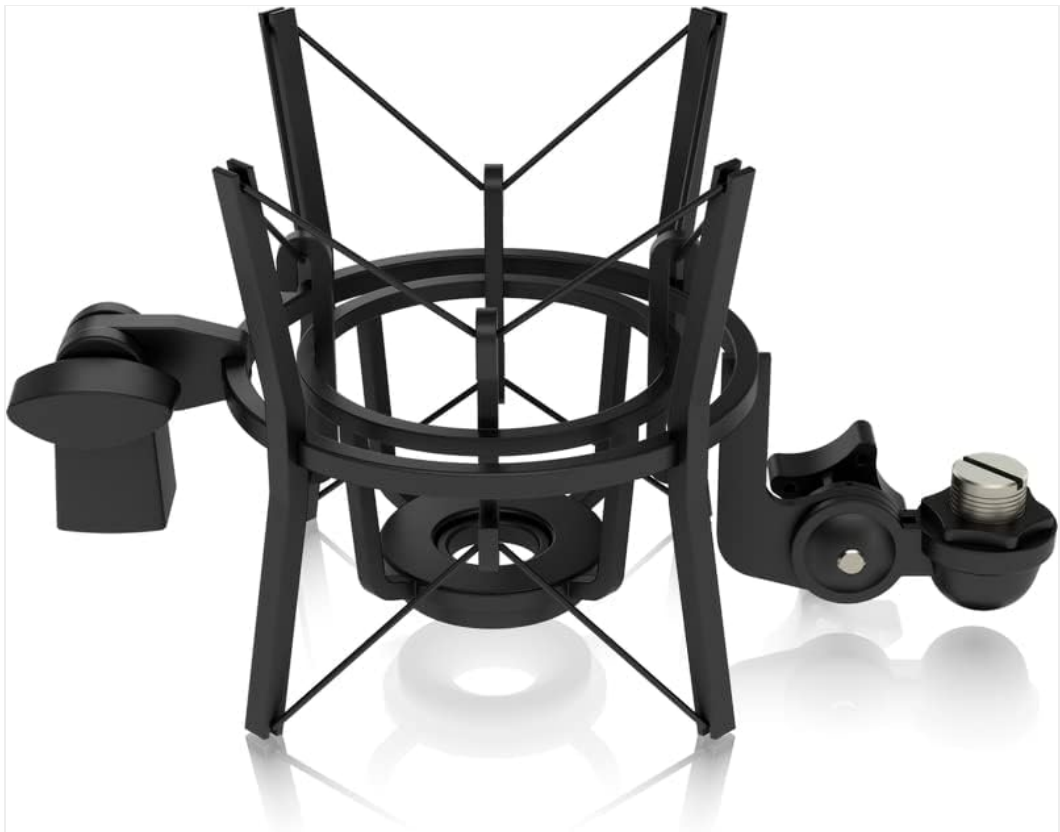
Image: The Behringer TM1 shock mount, designed to hold the microphone securely and reduce vibrations.