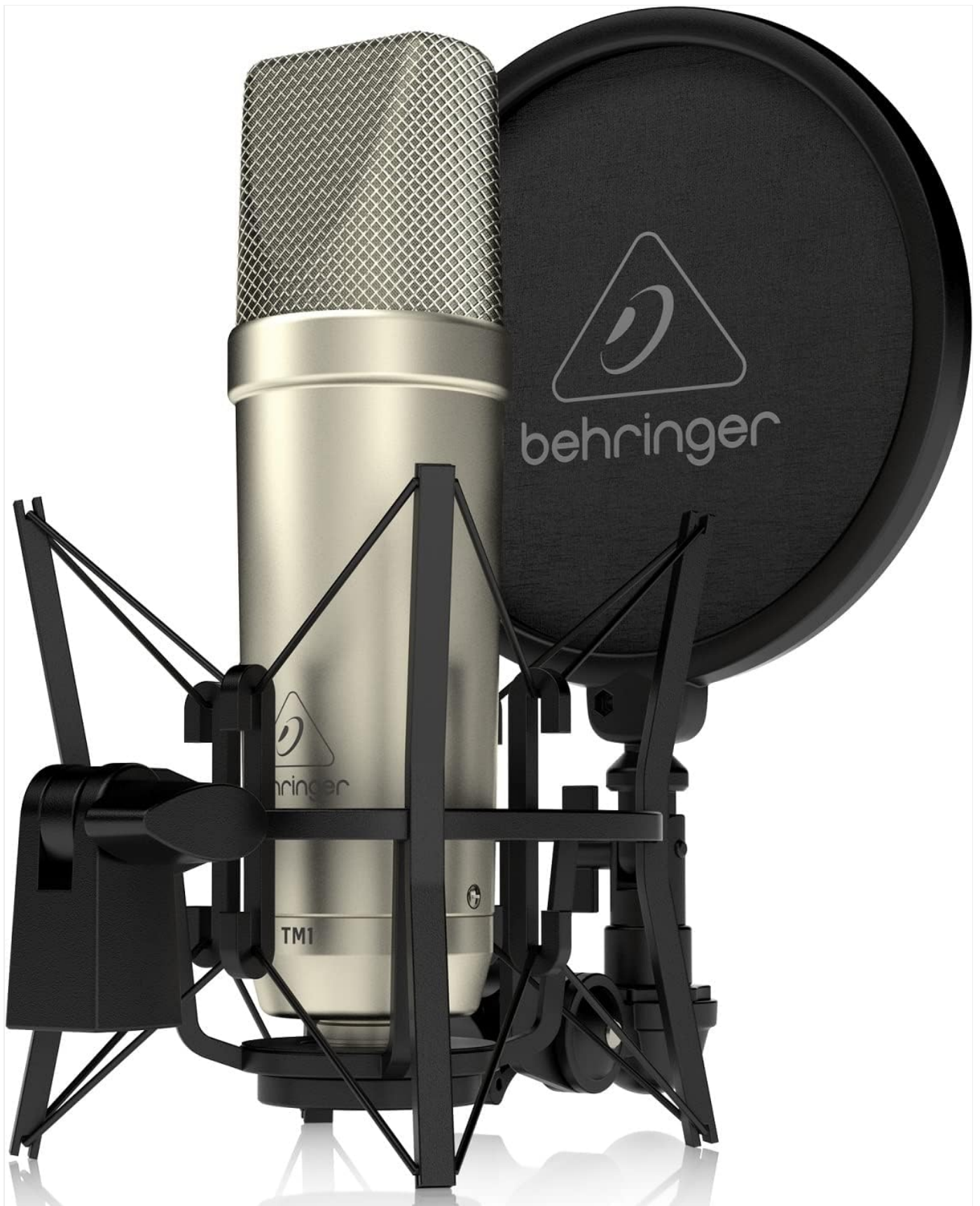
Image: The complete Behringer TM1 microphone recording package, including the TM1 microphone, shock mount, and pop shield.