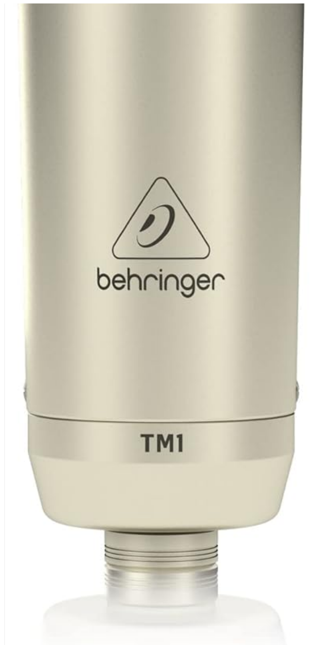
Image: The Behringer TM1 condenser microphone, a key component of the recording package.