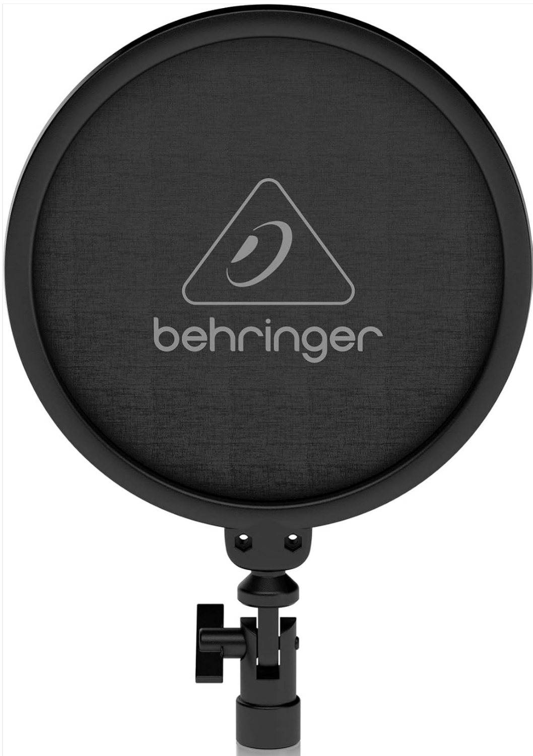
Image: The Behringer pop shield, used to filter out harsh plosive sounds during recording.