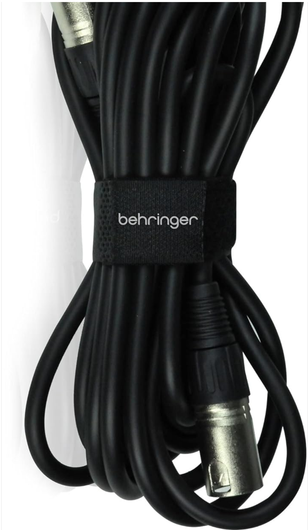
Image: The included 20-foot XLR cable, essential for connecting the microphone to audio equipment.

5. Connect to Device: Connect your audio interface/mixer to your computer or recording device.