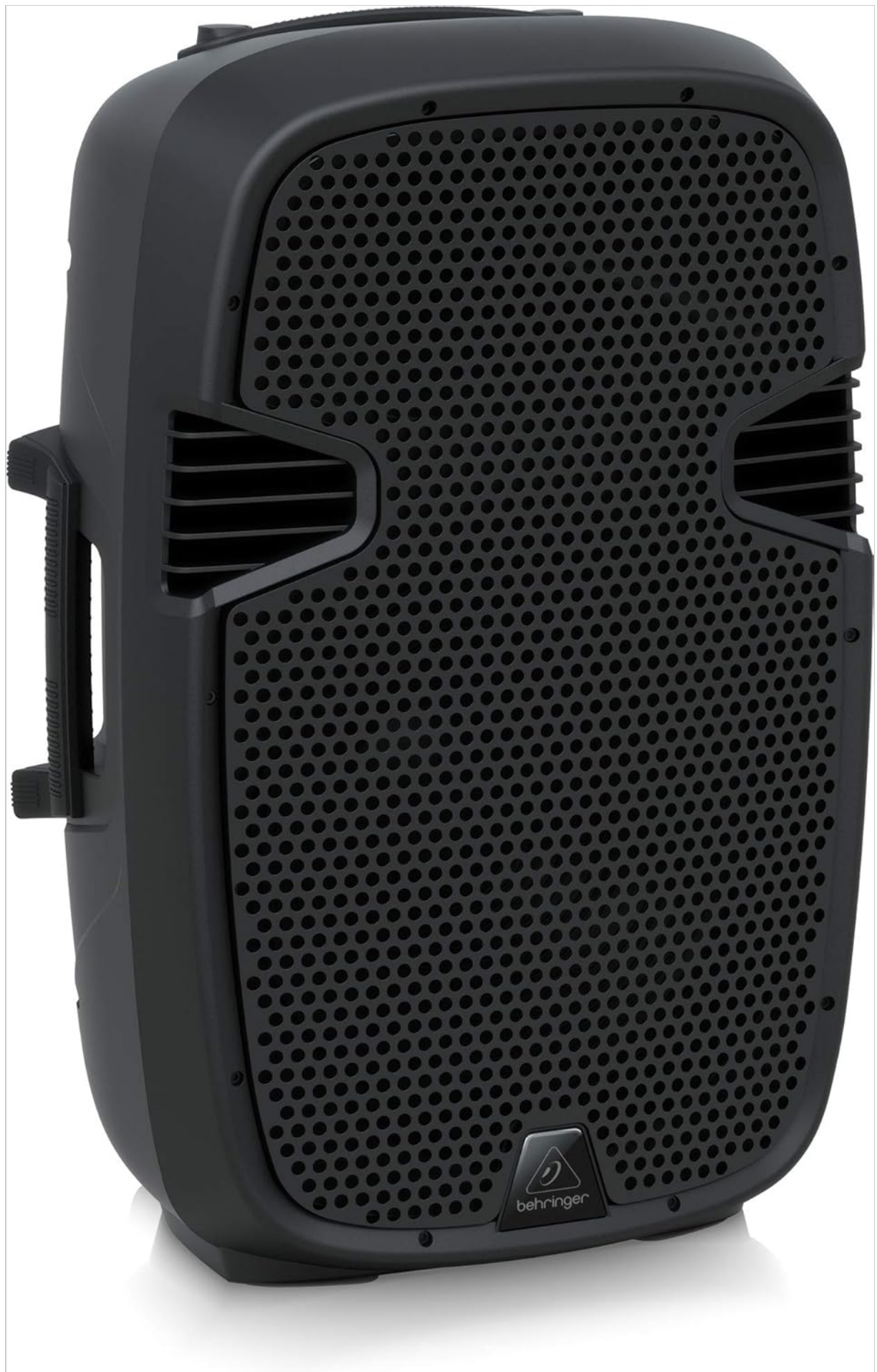
Figure 2: Angled view of the PK115A, highlighting the integrated side handle for portability and the robust enclosure.