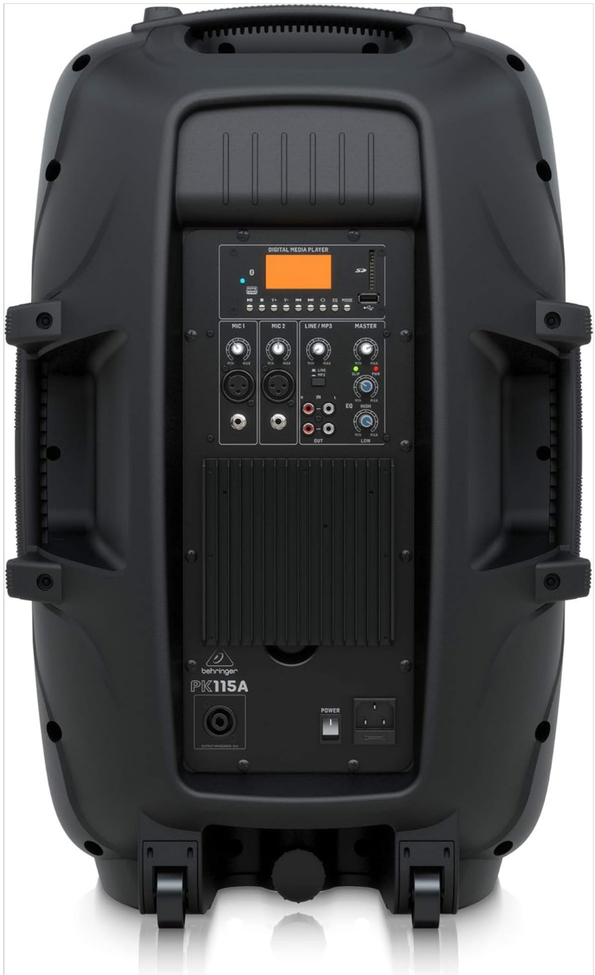
Figure 3: Rear panel of the PK115A, detailing the digital media player, mixer controls, and various audio input/output ports.