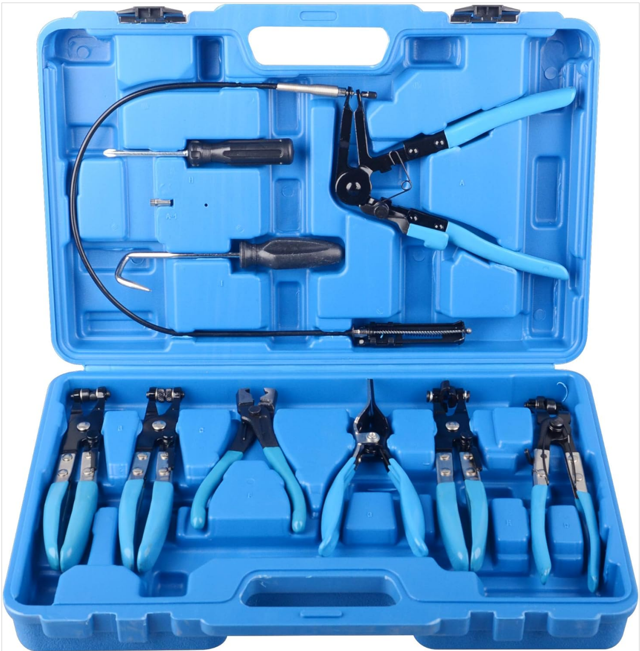
Figure 1: Complete 9-piece hose clamp pliers set in storage case.