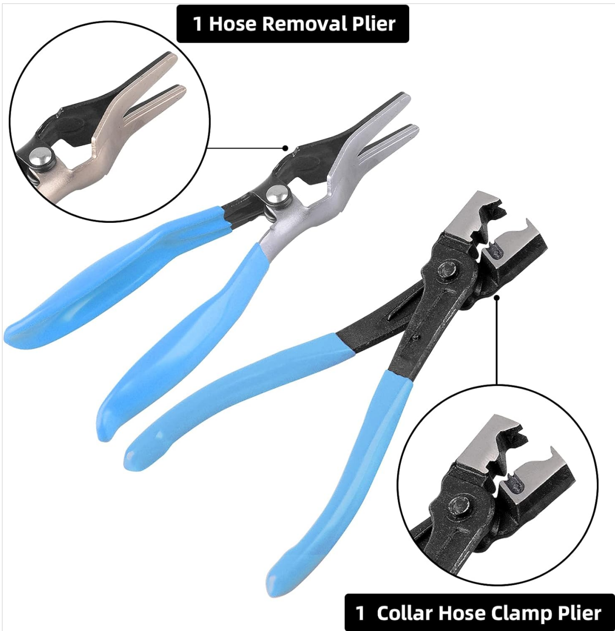
Figure 3: Hose Removal Plier (top) and Collar Hose Clamp Plier (bottom).

The Hose Removal Plier assists in separating hoses from fittings. The Collar Hose Clamp Plier is used for specific collar-style clamps.