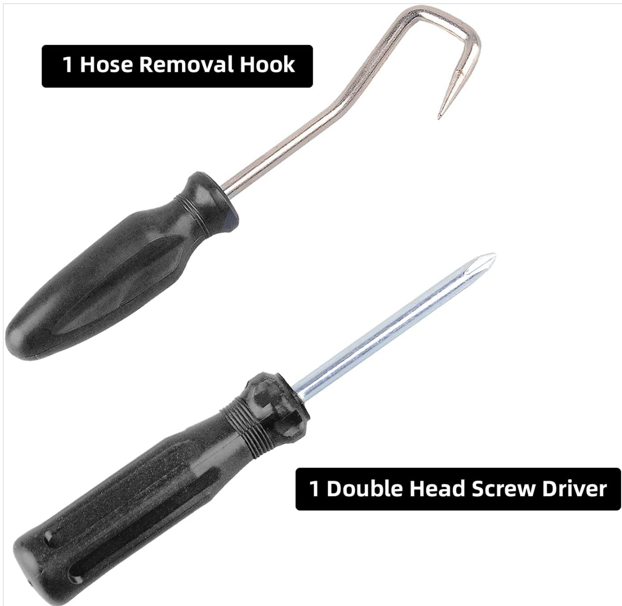
Figure 6: Hose Removal Hook (top) and Double Head Screwdriver (bottom).

The Hose Removal Hook assists in prying hoses from stubborn connections. The Double Head Screwdriver provides versatility for various fastening needs.